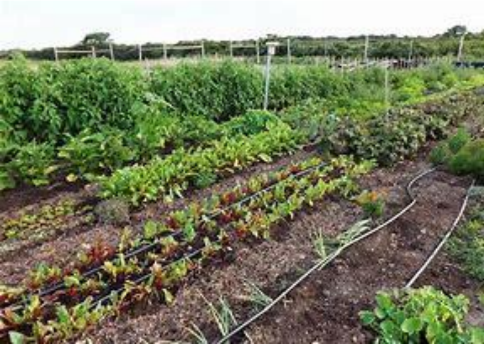
Economic Multiplier for every $1 spent on incentives generates $2.70 to support local economy