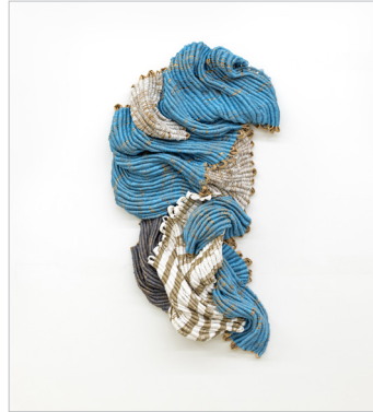
THE NICETIES Poly cord, paper and plywood 70 x 37.5 x 9 in 2023