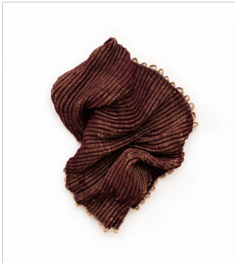
INTENTIONS Poly cord, paper, and plywood 46 x 34 x 10 in 2023