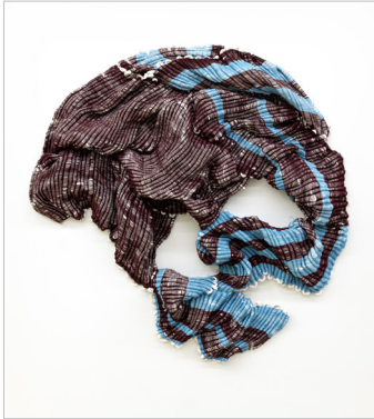
THEIR UNSPOKEN Poly cord, paper and plywood 75 x 75.5 x 9 in 2023