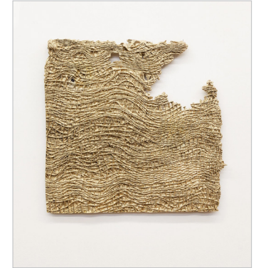
FLAT BRASS CAST 4 Brass casting 28.25 x 29.5 x 2 in 2020