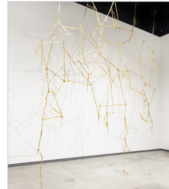
BACK TO THE LINE 1 BACK TO THE LINE 2 168 x 72 x 2 in 168 x 120 x 2 in 2025

Site-responsive installation Ceiling-mounted, adjustable height