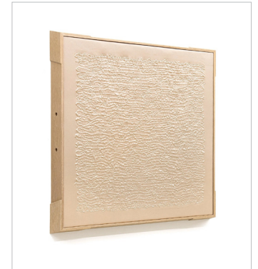
KEEP, SILK Silk, foam, stainless steel hardware and white oak 46.375 x 43.375 x 4.5 in 2026

Site-responsive installation Ceiling-mounted, adjustable height