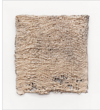
FLAT SAND CAST IRON Enameled cast iron 34.5 x 32 x 2.25 in 2020