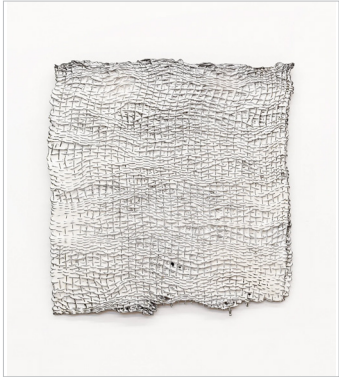
FLAT DUNE CAST IRON Enameled cast iron 33.25 x 32.75 x 2.375 in 2020