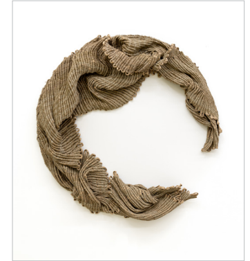
SO TELL ME Poly cord, paper and plywood 76 x 75.5 x 11 in 2023