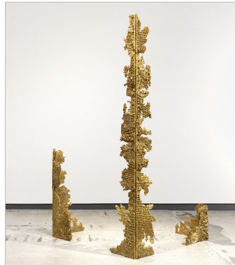
FRAGMENTED BRASS PILLAR 2 FRAGMENTED BRASS PILLAR 1 FRAGMENTED BRASS PILLAR 3 (left to right) Brass casting 36 x 18 x 12 in, 74 x 13 x 11 in, 14 x 15 x 16 in, 2025