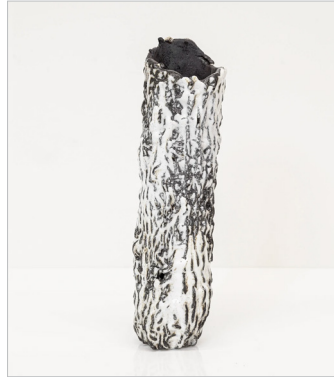
CAST IRON TUBE Enameled cast iron 15 x 4 in 2020