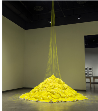
CERTAIN UNCERTAINTY Poly cord, paper and plywood 263 x 183 diameter in 2026

Site-responsive installation Ceiling-mounted, adjustable height