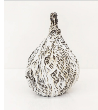
CAST IRON DROP Enameled cast iron 12.5 x 9 in 2022