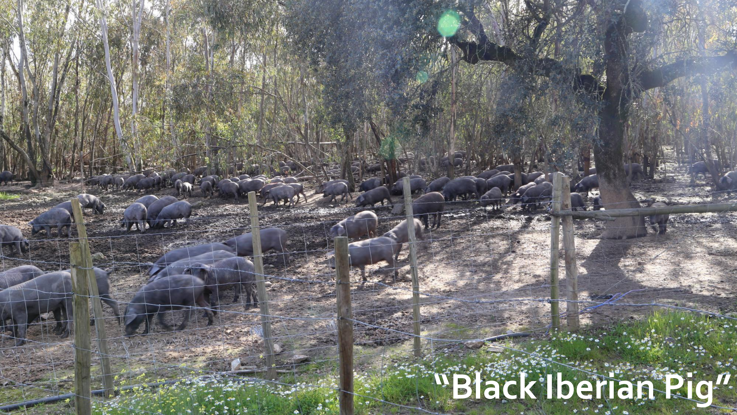
“Black Iberian Pig”