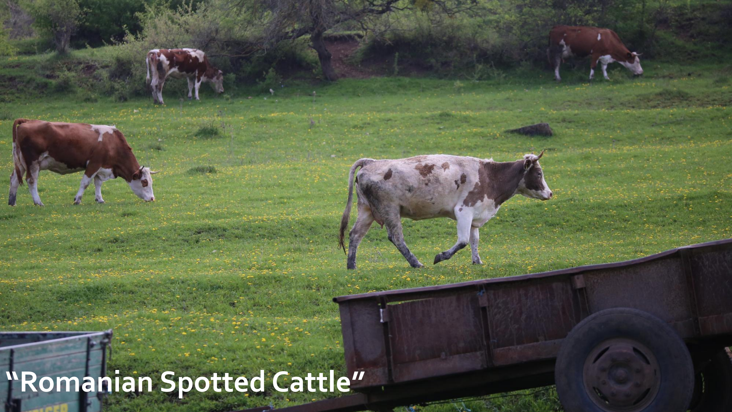
“Romanian Spotted Cattle”