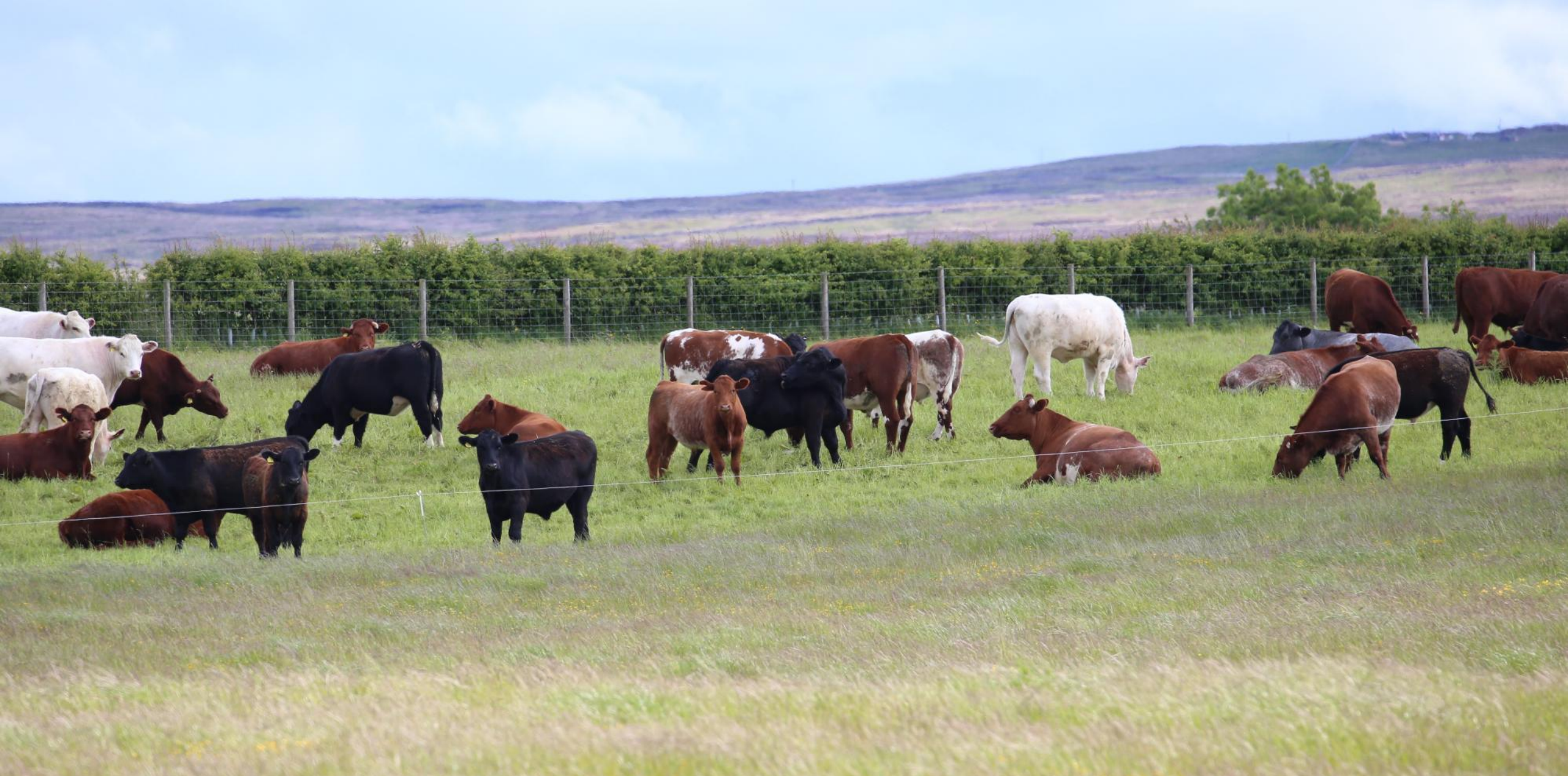
“Mixed Aberdeen Angus”