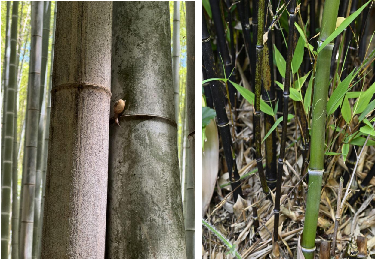
Left: Phyllostachys Edulis 'Moso' is a common timber variety growing in Arashiyama Bamboo Forest in Kyoto, Japan. Right: Phyllostachys nigra 'Black Bamboo' showing the smaller canes from the purchased nursery pot in the back and the new larger green culms produced two years later.

Whether it was short or timber-sized? The key to being in zen with your bamboo is understanding how to select, grow, and maintain the plant.