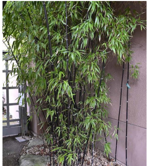
Phyllostachys nigra 'Black Bamboo' grown against a foundation and contained by a sidewalk at the Elisabeth C. Miller Library in Seattle. In this shady contained location, it will not grow to its unconstrained height of 35'.