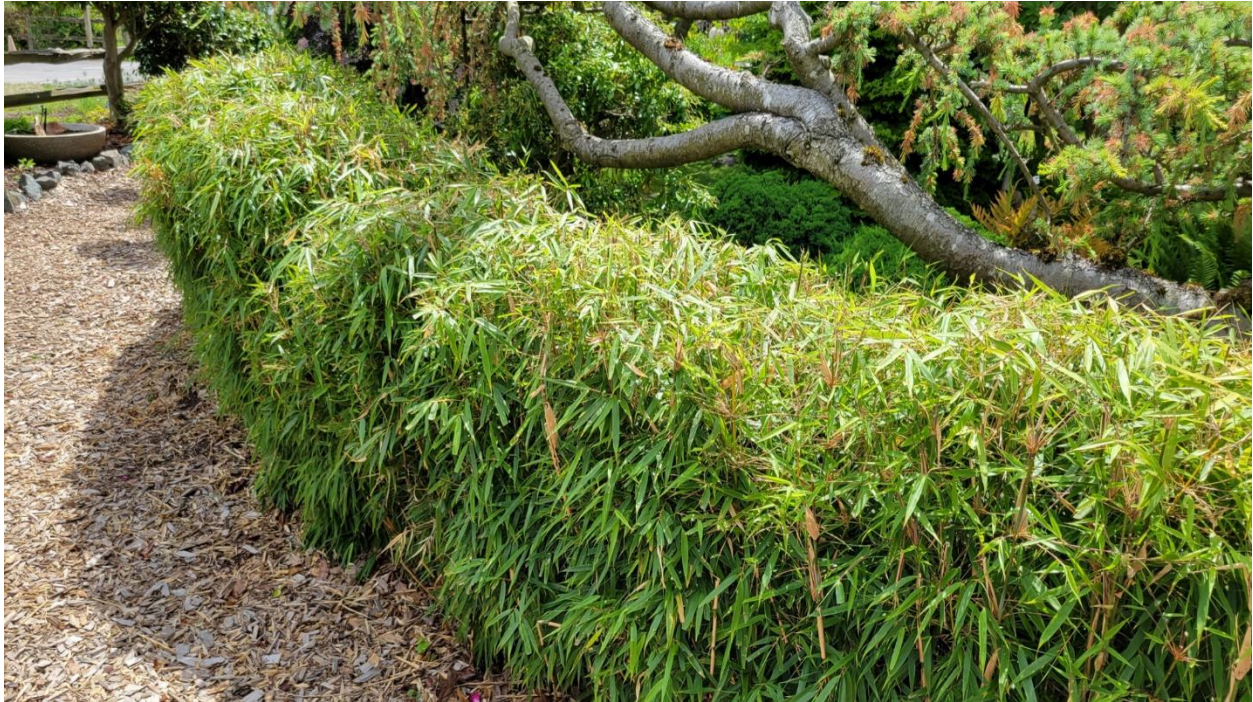
Fargesia dracocephala 'Rufa' 'Dragon's Head' at the WSU Discovery Garden. This clumping bamboo has a loose weeping habitat so the hedge has been pruned to keep it off the path. Bamboos tolerate pruning well as long as adequate leaves are left for plant health.

If you need immediate removal of the plant and rhizomes, the only solution is digging. It is best done when the soil is moist. Cut the canes at one foot (or so) above the ground and use them to help pull out the rhizomes. Get all the rhizomes, but don't worry about the fibrous roots. As for other methods, there are many: applying chlorine, salt, vinegar, and even gasoline. These contaminate the soil. They may kill the bamboo, but they will destroy the soil ecology and everything nearby.