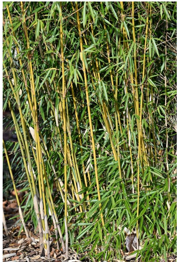
Left: Fargesia nitida 'Jiuzhaigou' is a clumping bamboo. This cultivar is 'Red Fountain' with red canes. Many cultivars of this variety can be found with different colored canes. Right: Fargesia robusta 'Campbell' is a clumping bamboo with \frac{3}{4} " canes.

You can use metal, wood, or fabric as barriers. Metal will rust and disintegrate over time, and wood will rot. The most long-lasting barriers are either rigid 40 mil HDPE (high-density polyethylene) or flexible EPDM (ethylene propylene diene monomer). Alternatively, you can buy a thick EPDM pond liner and cut it to size. Standard landscaping fabric is insufficient for control. You can buy molded pond liners in various shapes and fill them with dirt instead of