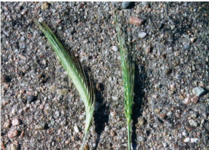
Figure 2. Feral rye seed heads (left) are slender, longer, and somewhat nodding compared to winter wheat seed heads (right).

This level of seed production allows a small infestation of feral rye to dramatically increase in density in a short time if management is not implemented.