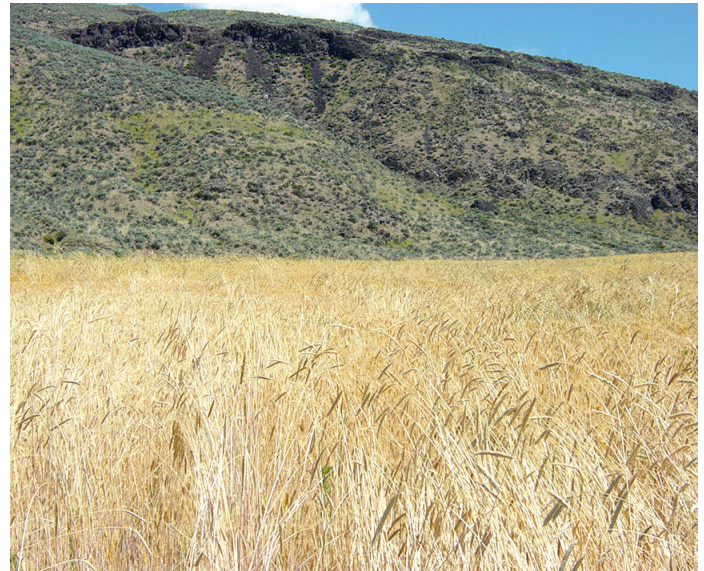
Figure 1. Feral rye is a troublesome winter annual grass weed in Pacific Northwest winter wheat–fallow production regions.

Feral rye plants, collected from seven winter wheat fields in Oregon in 2016 through 2018, produced an average of 360 seeds per plant with a range from 111 to 935 seeds per plant (San Martin et al. 2021).