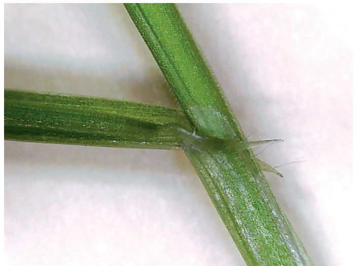
Figure 5. Winter wheat seedlings have sharply curved auricles (as seen above) that, while present early in feral rye, often wither and are hard to see.