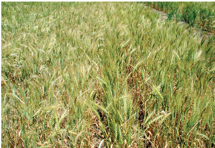
Figure 7. Feral rye control in CoAXium winter wheat with Aggressor herbicide applied at 10 oz/acre in the spring of 2017 at Moro, OR.

The development of herbicide resistance is of great concern with Group 1 herbicides. In fact, a downy brome biotype resistant to quizalafop, the active ingredient in Aggressor AX herbicide, was identified in northeast Oregon in 2005 (Ball et al. 2007). In 2023, Riberio et al. (2023) reported nine more cases in Oregon. Careful stewardship of the CoAXium wheat production system is critical if this technology is to last more than just a few years. Consider crop rotations where winter wheat is grown only once every three or four years. The active ingredient in Aggressor AX is the same active ingredient found in Assure II herbicide, which is labeled for use in dry pea (including winter pea), chickpea, lentil, and canola. Growers should avoid using Aggressor AX and Assure II herbicides in their crop rotations. Growers should consider rotating the use of the CoAXium wheat production system with the Clearfield wheat production system. Always rogue and remove feral rye plants that survive herbicide treatments.