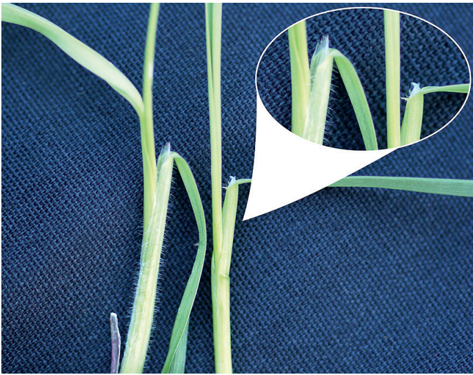
Figure 6. The ligule of feral rye (left) is membranous, whereas in wheat (right) the membranous ligule is fringed with minute hairs.

the base of the leaf) that is fringed with minute hairs, while rye may have them early on, but they often wither and are difficult to see. Feral rye seedlings have a membranous ligule (an outgrowth from the top of the leaf sheath), while in wheat the ligule is fringed with minute hairs but is not membranous (Figure 6).