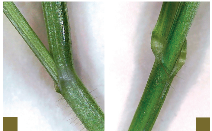
Figure 4. The stems of feral rye seedlings (a) often have numerous fine hairs, while wheat stems (b) tend to have few or no hairs.