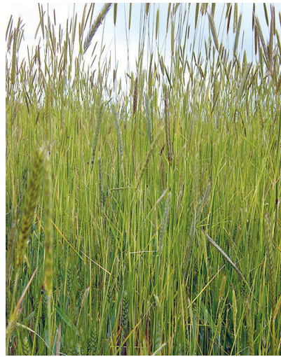
Figure 8. Feral rye is usually easy to locate in a winter wheat field after the boot stage because of its tall stature relative to most winter wheat varieties. The height differential between winter wheat and feral rye also provides an opportunity for selective chemical control with a rope-wick application of glyphosate.

Another option for controlling feral rye in winter wheat is to apply glyphosate with a rope-wick applicator. The feral rye should be 10–12 inches taller than the wheat for best results (Figure 8). In heavy stands of feral rye, the applicator should travel in both directions. Any contact between the rope wick and winter wheat or drip of herbicide on the crop will cause injury. The glyphosate should be mixed at a 33 percent concentration, which is 1 gallon of herbicide with 2 gallons of water. Surfactants may be needed for some glyphosate formulations.