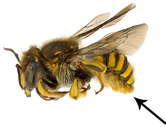
Figure 4. Wool carder bee adult. This individual has the bold yellow and black striping pattern common to this group. Arrow indicates scopal hairs located on the abdomen.

Description: There are approximately three species of wool carder bees in the Puget Sound Region. Coloration of individuals in this group is often a bold yellow and black striping pattern on the abdomen (Figure 4). Wool carder bees will also have pollen-carrying scopal hairs on the bottom side of the abdomen. Bees within this group collect trichomes (i.e., plant hairs) from plants in the family Lamiaceae to seal their brood cells.