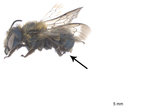
Figure 2. Mason bee adult. This individual has the metallic body color common to this group. Arrow indicates scopal hairs located on the abdomen, which is a common feature shared with leaf-cutter and wool carder bees.

Description: There are approximately 19 species of mason bees in the Puget Sound Region. Most are metallic blue or green, with a short robust body (Bosch and Kemp 2001; Roof and DeBano 2016). The pollen-carrying scopal hairs found on the underside of the abdomen can also be used to easily identify mason bees (Figure 2). Bees within this group seal brood cells using a variety of materials, among them moist soil or mud.