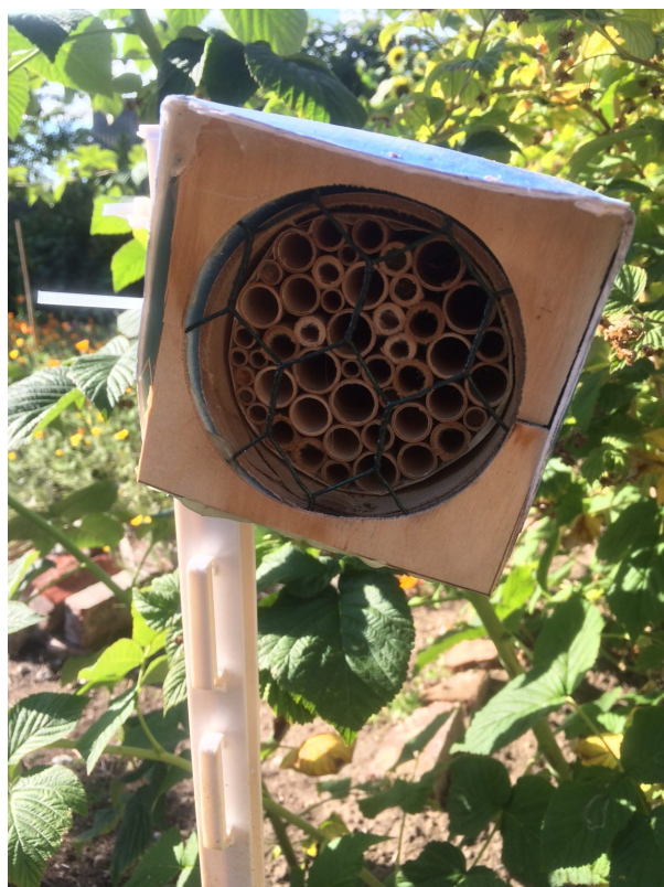
Figure 8. Example of a rolled cardboard tube bundle used in our now complete citizen science project: The Pollinator Post Project.

Citizen science, the involvement of the public in research, can be used to effectively monitor cavity-nesting bees, aiding in the understanding and conservation of these important pollinators (Gardiner et al. 2012). From 2015 to 2017, we worked with farmers and gardeners to collect data on the diversity of cavity-nesting bees in home gardens of the Puget Sound Region. The goal of this project was to help gardeners identify key nesting resources needed to conserve cavity-nesting bees, and improve pollination to nearby crops. Our preliminary results indicate that citizen scientists in the Puget Sound Region can help researchers identify species of critical restoration concern, and better understand long term trends in cavity-nesting bee biodiversity. To see the results of this project, visit our website: www.nwpollinators.org .