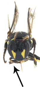
Figure 6. Masked-faced bee adult. Arrow indicates the bright yellow markings common to this group.

Description: There are approximately five species of masked-faced bees found in the Puget Sound Region. Bees are generally quite small (between 5 and 7 mm in length), and body color is mainly black, with bright yellow and white markings. This group will often have “diamond-shaped” yellow markings on their face (Figure 6), and they collect pollen internally (i.e., not in hairs on the abdomen or legs). Masked-faced bees produce a cellophane-like material to seal brood cells.