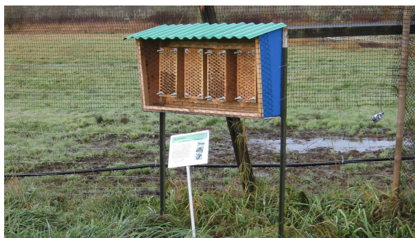
Figure 7. A purpose-built structure with wooden blocks inside. Chicken wire is used to exclude birds from developing homes, and the structure is painted blue to attract potential nest occupants.

Our research from the Puget Sound indicates that cavities 4–11 mm in diameter and 90–140 mm in depth provide nesting habitat for a diversity of species. Wooden blocks are highly durable and attractive to bees. However, bundles or groupings of loose stems and tubes can provide a less costly and easy to manage alternative (Figure 8). Farmers and gardeners should also take steps to prevent the buildup of pests and disease in artificial nest substrates, as these pests may reduce the health of bee populations over time. See the Additional Reading section for detailed instructions on artificial and natural habitat restoration and how to maintain disease-free bee populations.