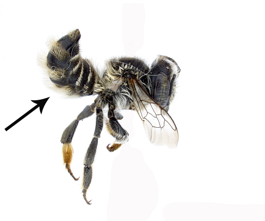
Figure 3. Leaf-cutter bee adult. This individual has the drab body color and striping on the abdomen common to this group. Arrow indicates scopal hairs located on the abdomen.

Description: There are approximately nine species of leaf cutter bees in the Puget Sound Region. Generally, this group is comprised of dark or drab bees (i.e., not metallic) that have stripes on the abdomen (Figure 3). Similar to mason bees, leaf-cutter bees have pollen-carrying scopal hairs on the underside of the abdomen. Leaf-cutter bees cut pieces of leaves and petals to seal brood cells, although other materials can also be used.