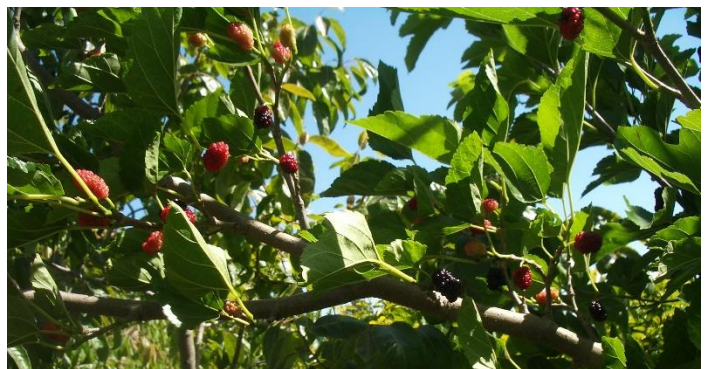
Figure 12. Mulberry fruit ripen over an extended period of time.

Mulberry ( Morus spp.) trees are self-fertile, grow quickly, and bear fruit early; the trees grow large and are quite wind-resistant but can be pruned to a size allowing for ground picking. They are among the last trees to break dormancy in the spring, which often saves flowers from late frost damage. Flowers are wind pollinated, and some cultivars will set fruit without any pollination. Botanically, the fruit is not a berry but a multiple fruit (i.e., fruit formed from a mass of individual flowers that fuse). Produced on new growth, it resembles a blackberry in appearance and size and ripens over an extended period of time. The color of the fruit does not identify the mulberry species (Figure 12).