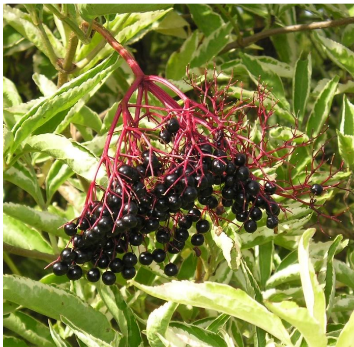
Figure 15. Blue elderberry, variegated foliage.

The blue elderberry native to Washington, Oregon, and Idaho is Sambucus nigra subsp. caerulea (Figure 15). The dark blue-purple berries are mildly poisonous if unripe. Ripe berries are edible after cooking and used to make jam, jelly, chutney, and Pontack sauce, a spicy elderberry catsup from seventeenth century United Kingdom.