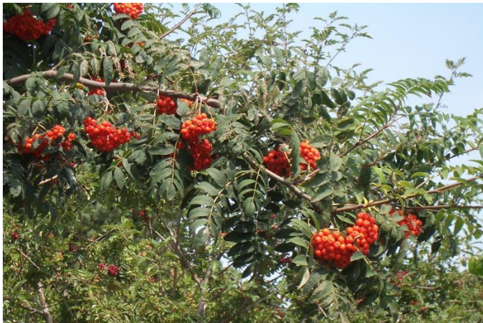
Figure 16. Mountain ash cultivar ‘Nevezhinskaya.’

The fruit, which is high in tannin and pectin, can be used in jams and other preserves—on its own or with other fruit. In the United Kingdom, it is made into a slightly bitter jelly and eaten with game. However, the raw fruit contains a known carcinogen, parasorbic acid. Freezing, cooking, or drying will degrade the parasorbic acid and reduce the bitterness. As a landscape tree they are very attractive with an upright growth habit, dark green pinnate leaves, clusters of white flowers, and red or red-orange fruit (Figure 16; Table 13).