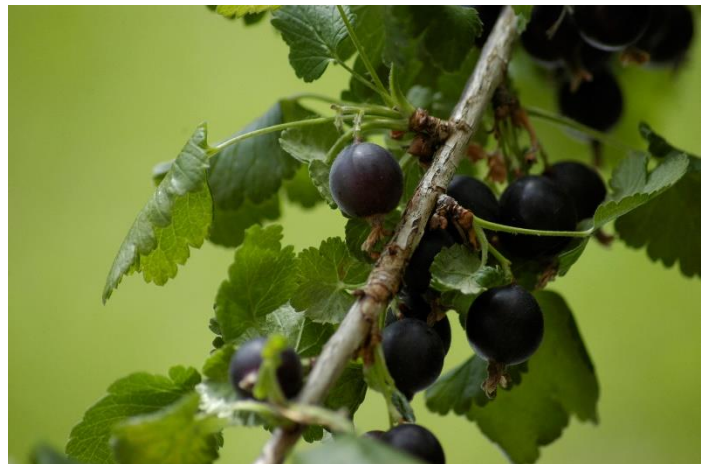
Figure 14. Jostaberry.

Harvesting jostaberries is relatively labor-intensive. Although harder to pluck than black currants, the plant is thornless.