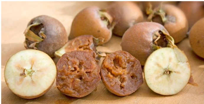
Figure 11. Medlar fruit before bletting (left and right) and after bletting, ready to eat (center). Photo by Istvan Takacs, Wikimedia Commons (this file is licensed under the Creative Commons Attribution-Share Alike 3.0 Unported license ).

The fruit resemble large, brown, fuzzy rose hips, and typically are not picked until late autumn, after leaf drop and a hard frost (Figure 11). The flesh is hard and unpalatable at picking and must go through a specialized ripening process ( bletting ) to become soft and edible. Fruit must be fully mature before harvest; medlars picked too early shrivel and never attain good flavor. Fruits are ready for harvest when they detach easily from the branch. Avoid bruising during picking. Store the fruit stalk end up in a cool place.