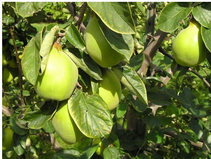
Figure 6. Top photo: quince flowers. Bottom photo: quince ‘Van Deman.’