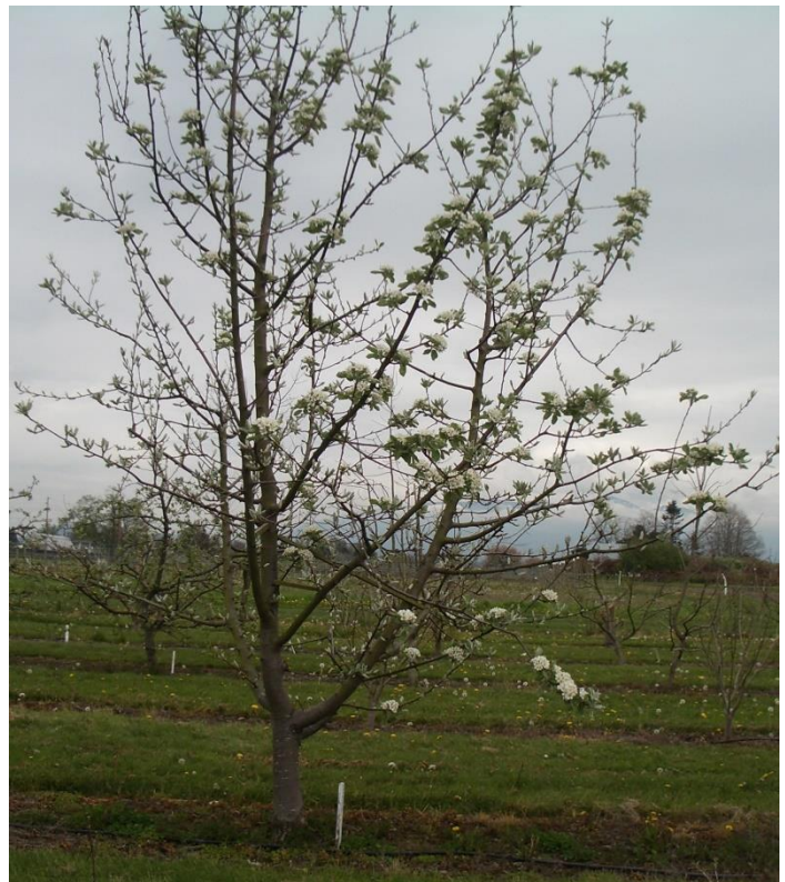
Figure 17. Mature fruiting tree in bloom.

Trees can reach 15–20 feet high, with an open, pyramidal growth habit requiring little pruning (Figure 17). It is notoriously slow to start fruiting, taking up to 15 years if growing conditions are not favorable. White five-petaled flowers are self-fertile but the tree generally produces larger crops when planted beside pear trees that bloom at the same time due to cross-pollination. Shipova fruit is about two inches in diameter with yellow skin and semi-solid, buttery, sweet, and fragrant white flesh (Figure 18). There is little information about the nutritional and nutraceutical characteristics of this fruit, but for fresh eating, its flavor is unsurpassed.