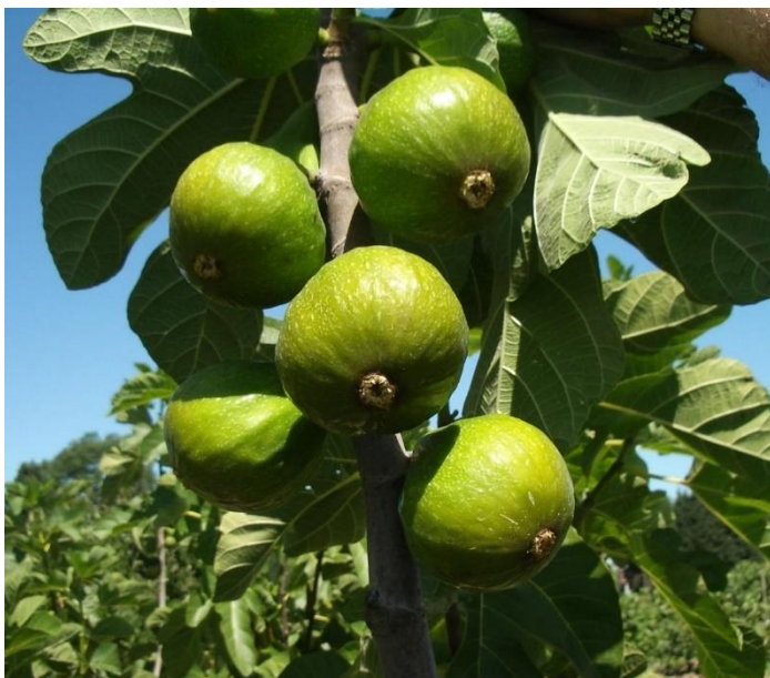
Figure 8. Fig ‘Desert King.’

The edible fig produces an inverted floral structure with many small, enclosed flowers. Some cultivars require pollination while others do not (Table 7). The ripe fruit, called a syconium , is primarily receptacle (stem) tissue that is consumed along with the gritty “seeds.” The mature edible fig has a thin skin which may be somewhat tough, a pale interior rind, and a sweet gelatinous pulp. Many fig cultivars have more than one common name. Some cultivars of fig were unknowingly mislabeled in the early years of their commercial propagation, and this issue carries over today for some nursery propagators.