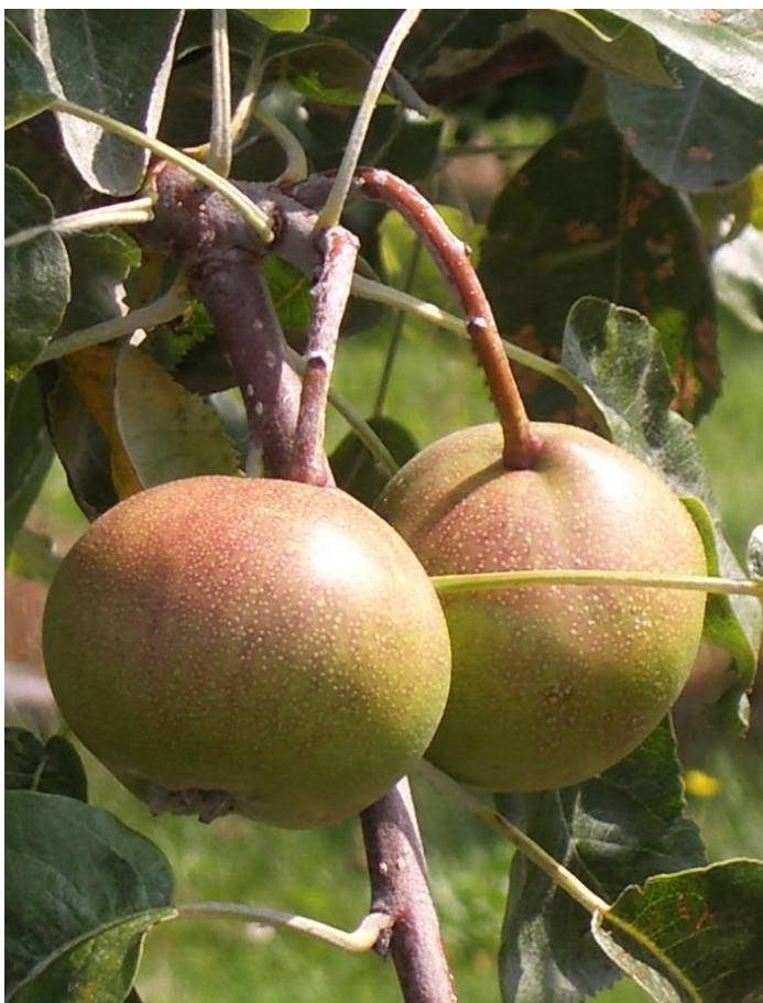
Figure 18. Shipova fruit.