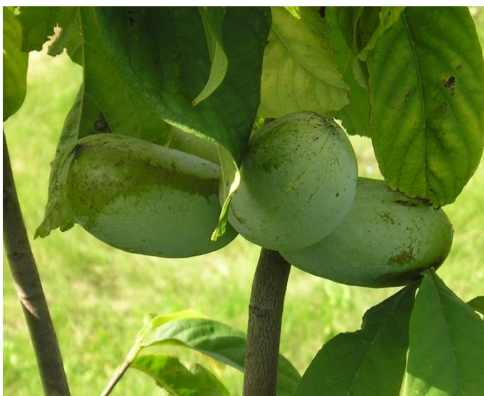
Figure 3. Pawpaw flowers (top photo) and fruit (bottom photo).

Fully ripe pawpaws last only a few days at room temperature but may be kept for a week in the refrigerator. If fruit is refrigerated before it is fully ripe, it can be kept for up to three weeks and