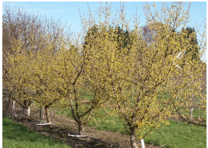
Figure 4. Cornelian cherry in bloom in early March.

A large deciduous shrub of the dogwood family native to southern Europe and western Asia, fruit from this tree has been used as a food crop in ancient Greece for over 7,000 years. Bright yellow flowers in dense, showy clusters bloom in very early spring before the leaves emerge (Figure 4). Cornelian cherry ( Cornus mas ) are somewhat self-fertile, but yield is improved with cross-pollination.