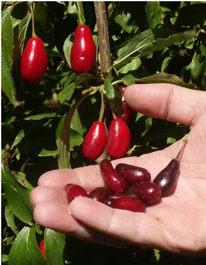
Figure 5. Ripe fruit in July.

The dense, hard wood was used for making spears, wheel spokes, and splitting wedges, according to classical Greek literature. Many Central Asian countries continue to use the wood for furniture, jewelry, and traditional musical instruments.