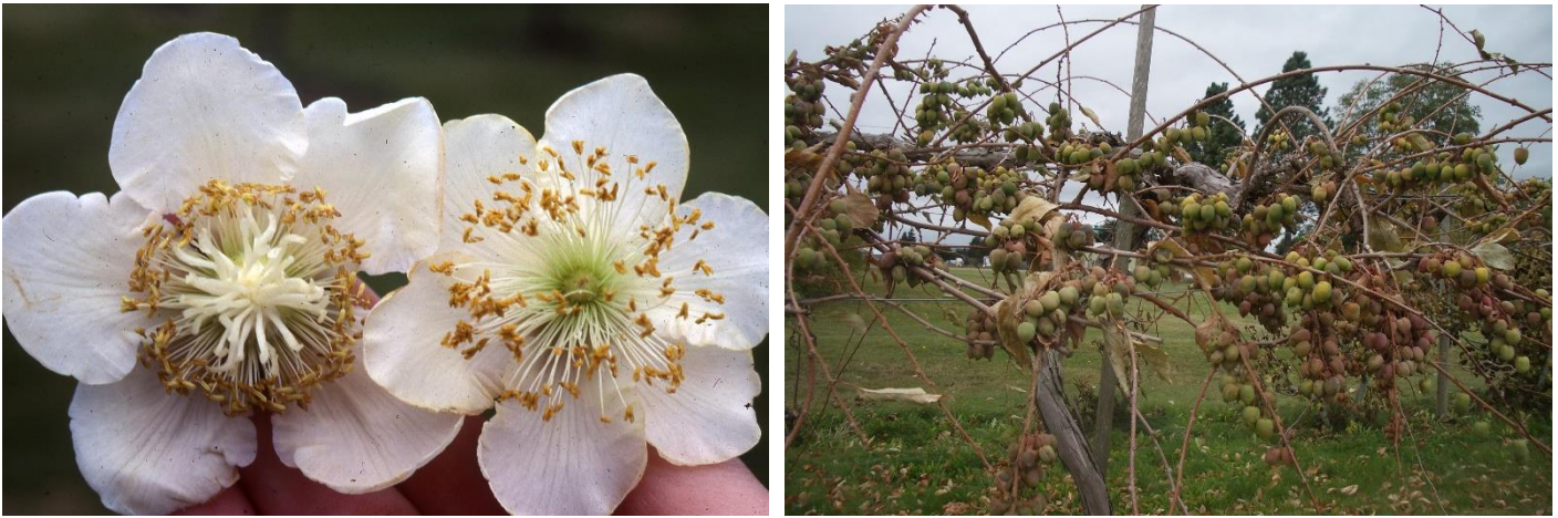
Figure 1. Left photo: female kiwi flower (left) and male kiwi flower (right). Right photo: hardy kiwi in full production.

In older classifications, A. deliciosa was considered to be a variety of A. chinensis , but since the 1980s, the two species have been split based on characteristics including fruit shape, skin texture, and hairiness (Courteau, n.d.). In general, A. deliciosa is more oblong and cylindrical, while A. chinensis is rounder and more globe-shaped. A. deliciosa is the source of the widely produced commercial cultivar ‘Hayward,’ but cultivars of A. chinensis were developed with commercial production starting in the 1990s; the fruit is marketed as “gold” or “golden” kiwifruit.