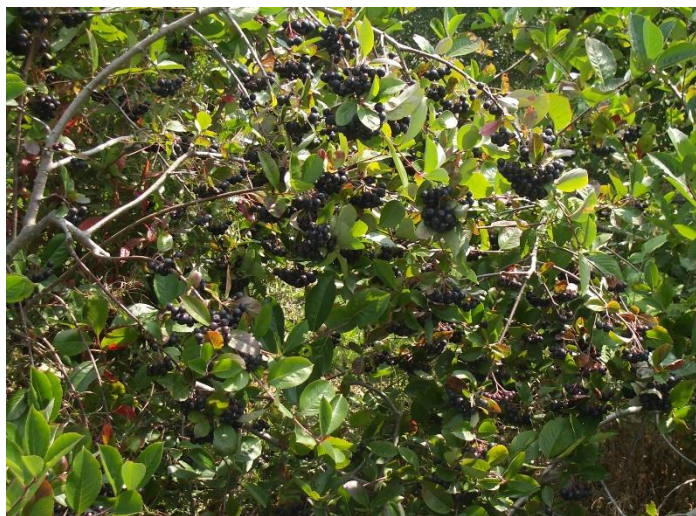
Figure 2. Aronia flowers are ornamental (top photo), and the bushes are very productive (bottom photo).

Aronia is well adapted to maritime climate conditions and is highly productive with few pests; netting of the crop may be needed to prevent bird damage as the late ripening fruit develops. The plants are self-fertile. As an ornamental shrub it produces mass clusters of white flowers in late spring and often has colorful fall leaves in shades of red and orange. For the most fruit, choose plants that have been selected for fruit production, not the ones that are primarily landscape ornamentals.