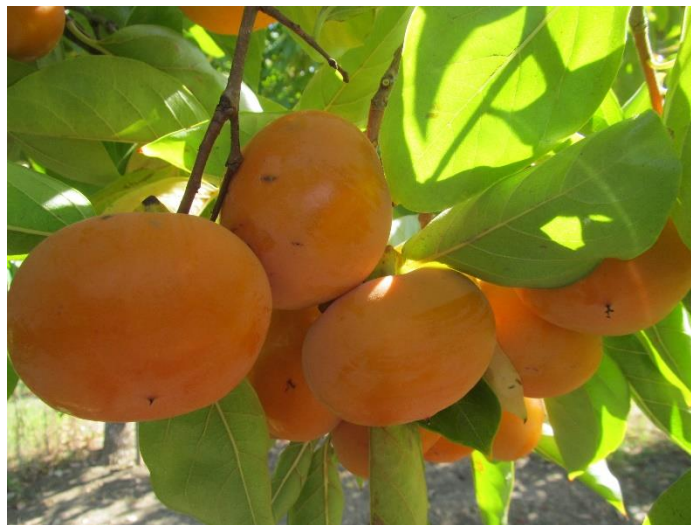
Figure 7. Persimmon.

bear non-astringent fruit. The astringency is due to the high tannin content. Freezing the fruit overnight and then thawing softens the fruit and removes the astringency; drying also removes astringency and preserves fruit for winter use. Harvest astringent varieties when they are hard but fully colored; protect the fruit from birds if it is left to soften on the tree. Astringent persimmons will ripen off the tree if stored at room temperature. Non-astringent persimmons are ready to harvest when they are fully colored, but for best flavor, allow them to soften slightly after harvest.