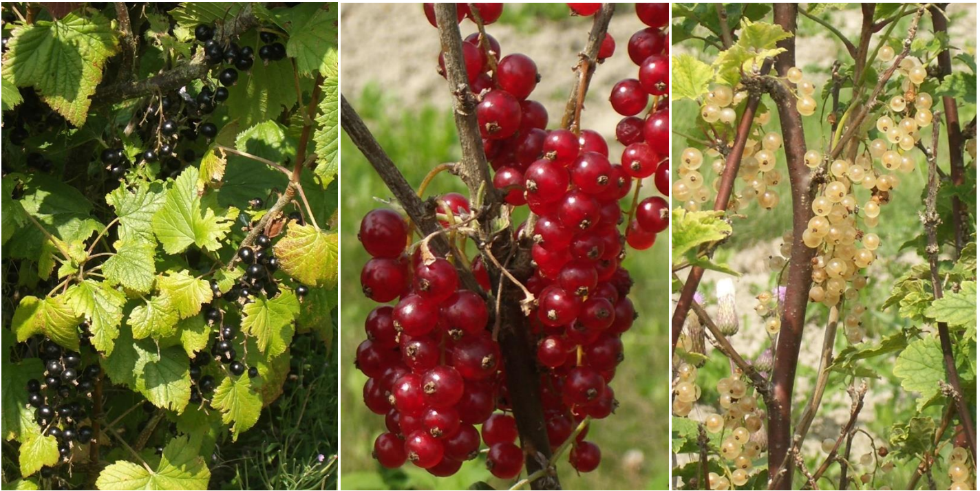
Figure 13. Black currants (left), red currants (center), and white currants (right).

Pacific Northwest have no restrictions for growing Ribes species with respect to this disease, it is still recommended to grow rust-resistant cultivars, especially if within a one-mile radius of five-needled pine trees.