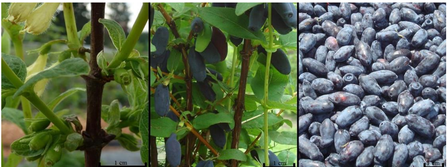
Figure 10. Haskap flowers and berries.