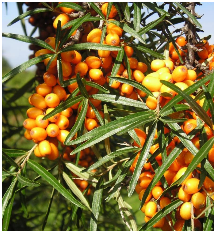
Figure 9. Fruit of sea buckthorn, also known as seaberry.

Sea buckthorn is very productive, bearing dense clusters of small, oval, yellow to orange fruit that has a citrus flavor (Figure 9; Table 8). The fruit contains very high amounts of vitamins C, B12, and E, as well as other beneficial flavonoids. Harvest is difficult due to the small size of fruit, dense fruit clusters, lack of an abscission cell layer so that berries tend to remain firmly attached even after ripening, and the very thorny branches. One method of harvesting is to prune off fruit-bearing areas of the branches and flash freeze them, which makes berries easier to detach. One side of a row is cut in alternate years to allow for regrowth (Fu et al. 2014). Hand harvest, though tedious, is still the most used method for home gardeners. Sea buckthorn is not recommended for planting in smaller gardens due to extensive suckering.