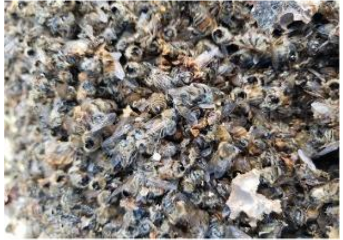
Figure 2. Suspected NGH damage.