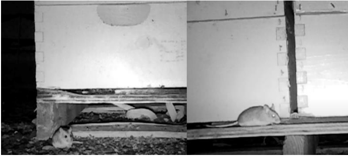
Figure 5. Trail camera photos of mice visiting honey bee colonies where NGH-like damage was observed.