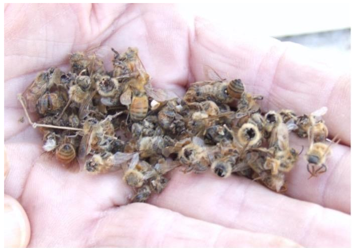
Figure 3. Suspected pesticide kill.

In 2019 it was announced that NGHs were present in Washington State. Naturally, beekeepers were concerned. Around that time, a beekeeper from the northwestern corner of the state submitted a photo (Figure 2) to the Washington Department of Agriculture showing damage to his bees, which were suspected NGH kills. The photo shows the bottom board of the hive covered with a large number of dead bees with holes in their thoraxes and many of their heads missing. In the fall of 2019, Washington State University’s Bee Program received photos from the Idaho Department of Agriculture regarding a pesticide-kill investigation (Figure 3). Again, the photos showed headless bees with holes in their thoraxes (Figure 3), which is not indicative of pesticide damage.