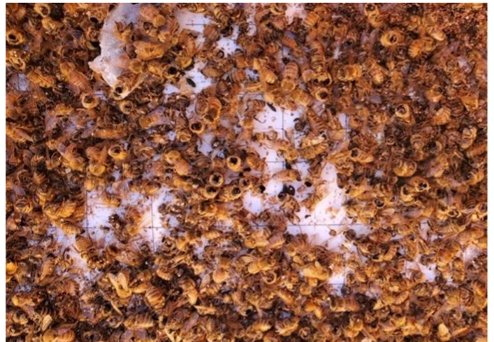
Figure 4. Mouse damage to a honey bee colony was observed by the WSU Bee Lab in Othello, Washington.

A few months later, as WSU research colonies were coming out of an indoor wintering experiment, strikingly similar damage was observed: numerous dead bees on the ground outside hive entrances had holes in their thoraxes, with much of the musculature bored out (Figure 4). These colonies had been sealed indoors at 39°F (4°C) for the winter months and were located in Othello, Washington, 300 miles from where NGH was detected, so the damage could not have been from NGH. Personal communication with local commercial beekeepers suggested that similar damage could be caused by shrews. Trail cameras were deployed to catch the culprit in action. Footage from these cameras revealed that mice were visiting the colonies at night and nibbling out the thoracic muscles (Figure 5).