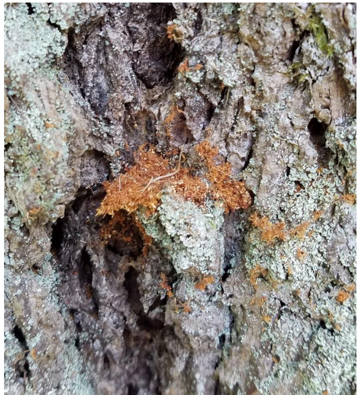
Figure 4. Red boring dust can indicate the exit or entry of beetles.