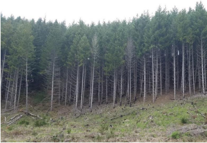
Figure 7. Forests become overstocked when they have too many trees for the available resources like water, sunlight, and nutrients. Ensuring forest stands do not become overstocked can prevent many forest health issues, including bark beetles.

Infested living trees that are not successfully defending themselves should be felled and treated similarly. Determining whether a tree is successfully defending itself can be difficult but, generally speaking, if there are exit or entry holes with cream-colored boring dust or multiple (more than ten) pitch streams on the main bole of the tree, it is not likely to survive.