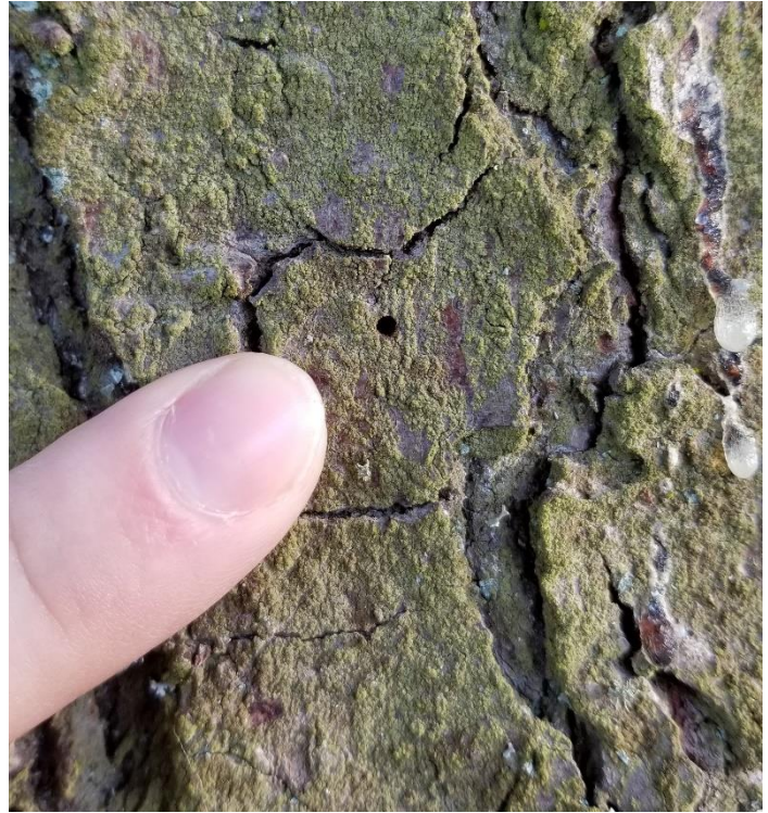
Figure 3. Small boring holes are demonstrated.

saprophytic insects (insects that feed on dead material) will move in, and it can be difficult to discern between the different insect damage.