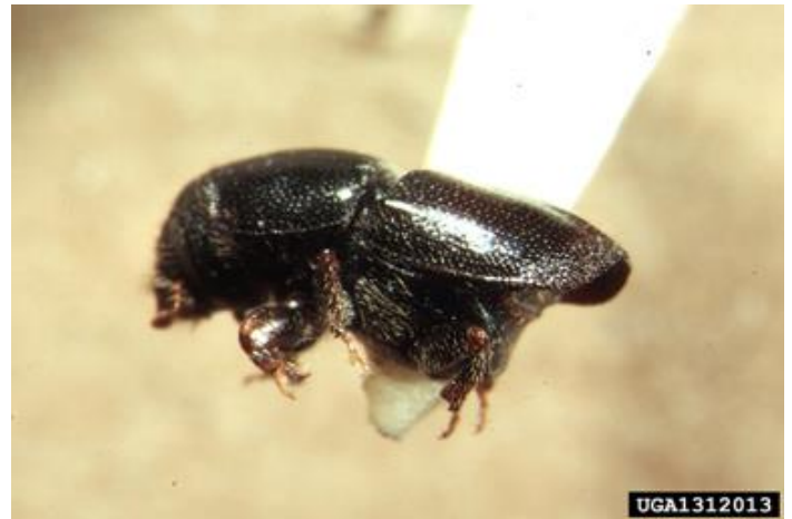
Figure 1. Adult fir engraver beetle ( Scolytus ventralis ).

The life cycle of the fir engraver starts beneath the bark of the tree. Adult beetles enter the tree, mate, and females go on to feed on the phloem in a single line, laying eggs in the excavated “egg gallery.” When a beetle successfully bores into a tree, it can emit a pheromone that attracts other fir engraver beetles, causing greater damage. Eggs hatch roughly two weeks after being laid, and larvae feed while forming larval galleries in lines