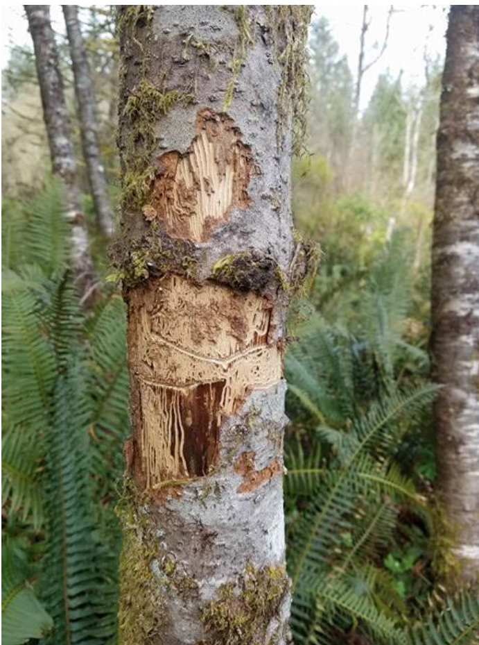
Figure 5. Looking below the bark of a tree may reveal signs of beetles that can be key to identifying the species responsible.

Once fir engraver beetles are confirmed on your property, reducing the threat requires managing the food source, which is the fresh, defenseless interior tissue of the tree. For instance, recently downed or topped trees (e.g., damage from a windstorm) should be managed promptly. To avoid providing habitat for bark beetles, these trees can be cut into firewood lengths (12–18 inches) to allow the inner layers to dry out. Debarking the tree is the best way to ensure the interior dries but may not be feasible on a large scale. Left unmanaged, the interior tissue can serve as a food source for fir engraver for up to two springs, so this form of management is only effective within that window.