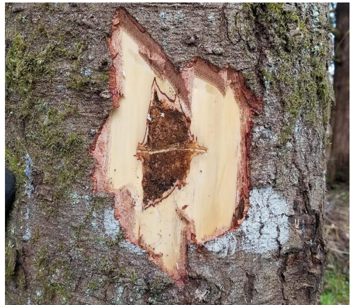
Figure 2. Trees can sometimes isolate beetles below bark to prevent further damage.