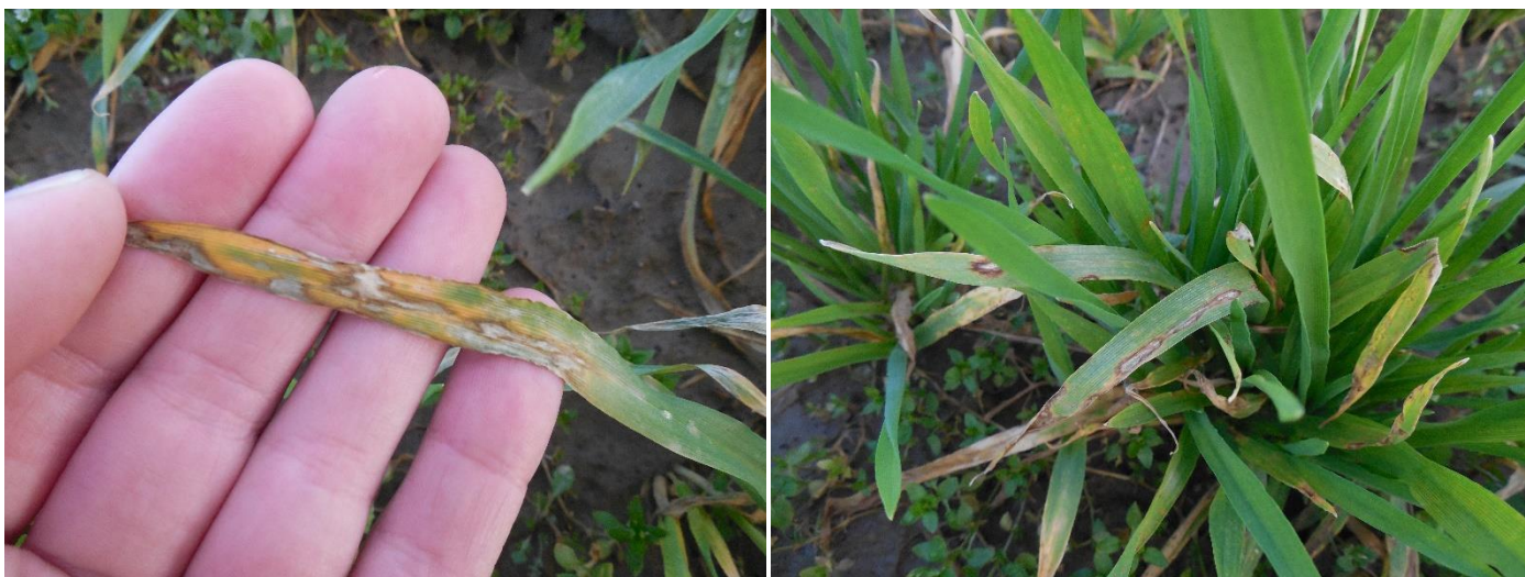
Figure 13. Scald infection on a leaf blade (left photo). Scald infection on lower leaves (right photo).

Powdery mildew is a fungal disease that primarily affects spring barley in western Washington (Figure 14). Under ideal conditions (heavy dews, dense stands), the powdery white fungus can cover the entire surface of lower leaves in the canopy. As a result, grain yield, test weight, and grain protein may decrease due to the reduced photosynthetic activity of infected leaves. Yield losses are greatest when infection occurs during the seedling stage. Control is best achieved by planting resistant cultivars. Additionally, proper fertility, green bridge elimination, and effective crop rotation can help reduce disease pressure. Fungicides can also be applied to help control the disease.