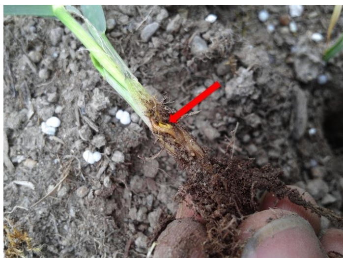
Figure 19. Wireworm ( Agriotes spp.) feeding on barley seedling.