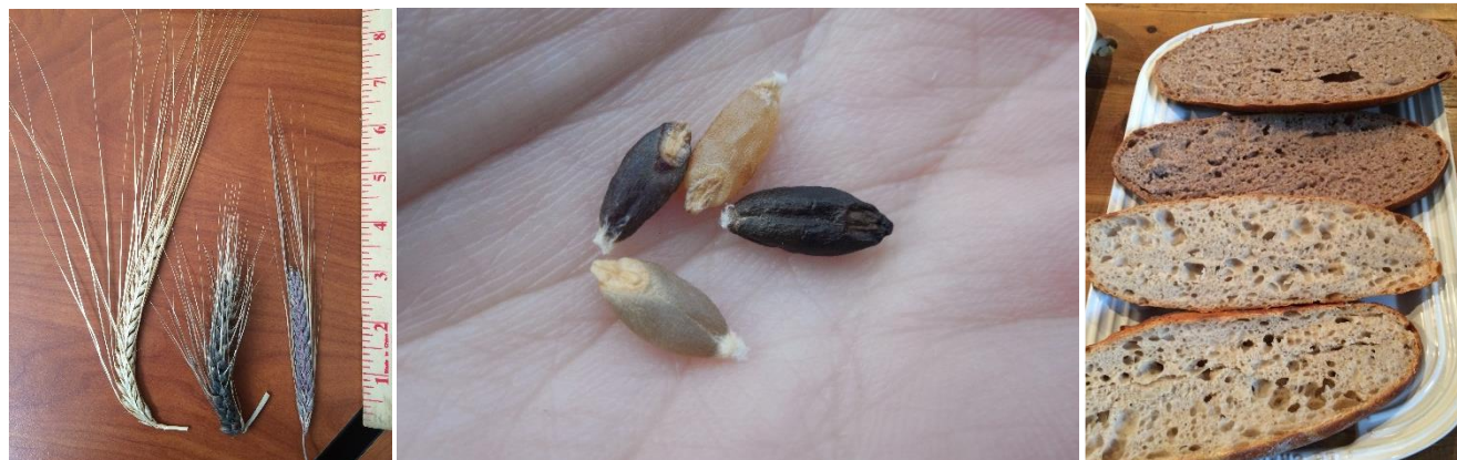
Figure 7. White, black, and purple barley spikes (left photo). Purple, white, black, and blue naked barley seed (center photo). Breads made with purple barley flour (upper bread slices) and white barley flour (lower bread slices) (right photo).

Barley is a versatile grain that can be used for animal feed, human food, and to produce malt for beer and whiskey. Not all varieties are equally suited for these diverse end uses. While many barley varieties can be used as animal feed, malting barley varieties have been bred to meet a very specific set of quality traits that make them highly suitable for malting. Within the United States, barley varieties intended for large-scale malt production have traditionally required the approval of the American Malting Barley Association (AMBA) to ensure that