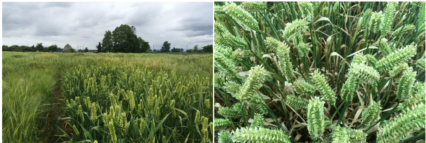
Figure 3. Hooded barley plot in a trial (left photo). Hooded barley spikes (right photo).

Barley is a member of the grass family (Poaceae) and part of the Triticeae tribe along with bread wheat ( Triticum aestivum ) and