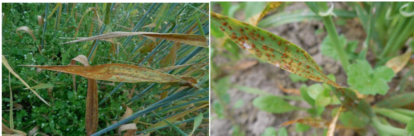
Figure 12. Severe leaf rust infection (left photo). Leaf rust spores beginning to form (right photo).