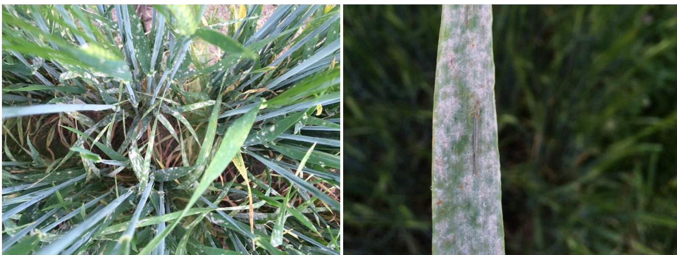
Figure 14. Mildew infection on lower leaves (left photo). Severe mildew on a leaf blade (right photo).