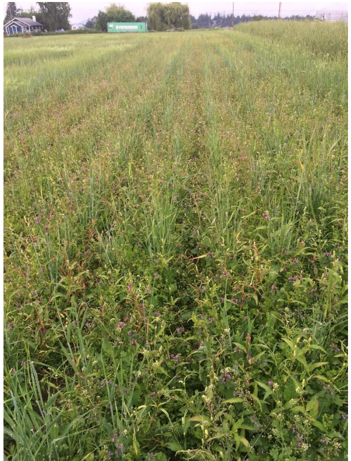
Figure 9. Extreme weed pressure in an organic field.