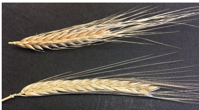
Figure 6. Six-row barley spike (top) and two-row barley spike (bottom).

Among barley varieties, there are two basic types, termed either as “two-row” or “six-row.” This distinction has to do with the structure of the barley head (“spike”) and pattern of how the grain kernels develop along it. Each spike is composed of numerous spikelets (a group of three flowers) arranged alternately along a central axis called the rachis. At each node of the rachis are three florets (flowers), one central and two laterals. In two-row barley varieties, the lateral florets are sterile or not fully formed and do not produce grain. As a result, the grain is arranged in two rows along either side of the rachis. In six-row barley, all three florets are fertile, and consequently six rows of grain are produced, three on either side of the rachis (Figure 6).