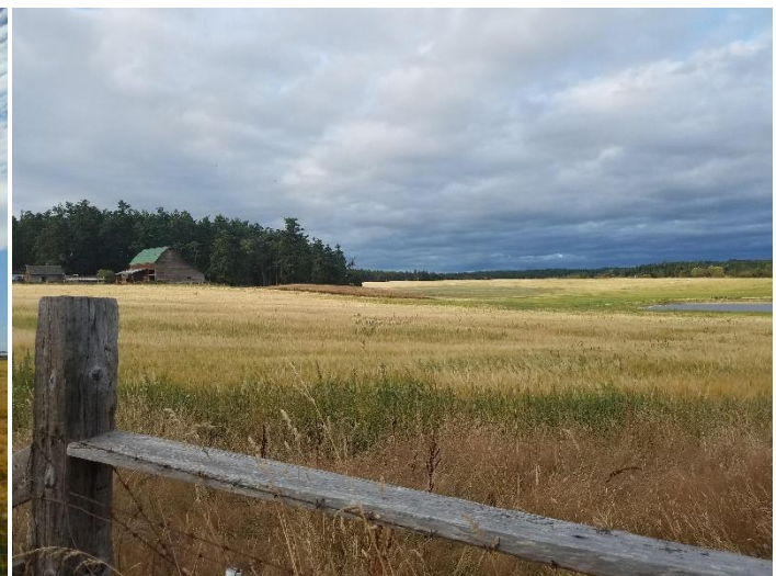
Figure 1. Commercial barley production in western Washington. Winter barley in Skagit Valley (left photo). Spring barley in San Juan County (right photo).