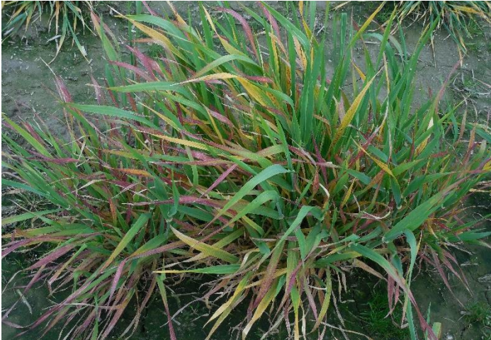
Figure 17. Patches of barley yellow dwarf virus infection in commercial production (top photo). Yellow and purple leaves on an infected plant (bottom photo).