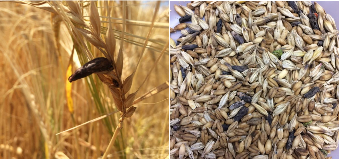
Figure 16. Ergot sclerotia on a mature barley spike (left photo). Sclerotia in harvested grain (right photo).