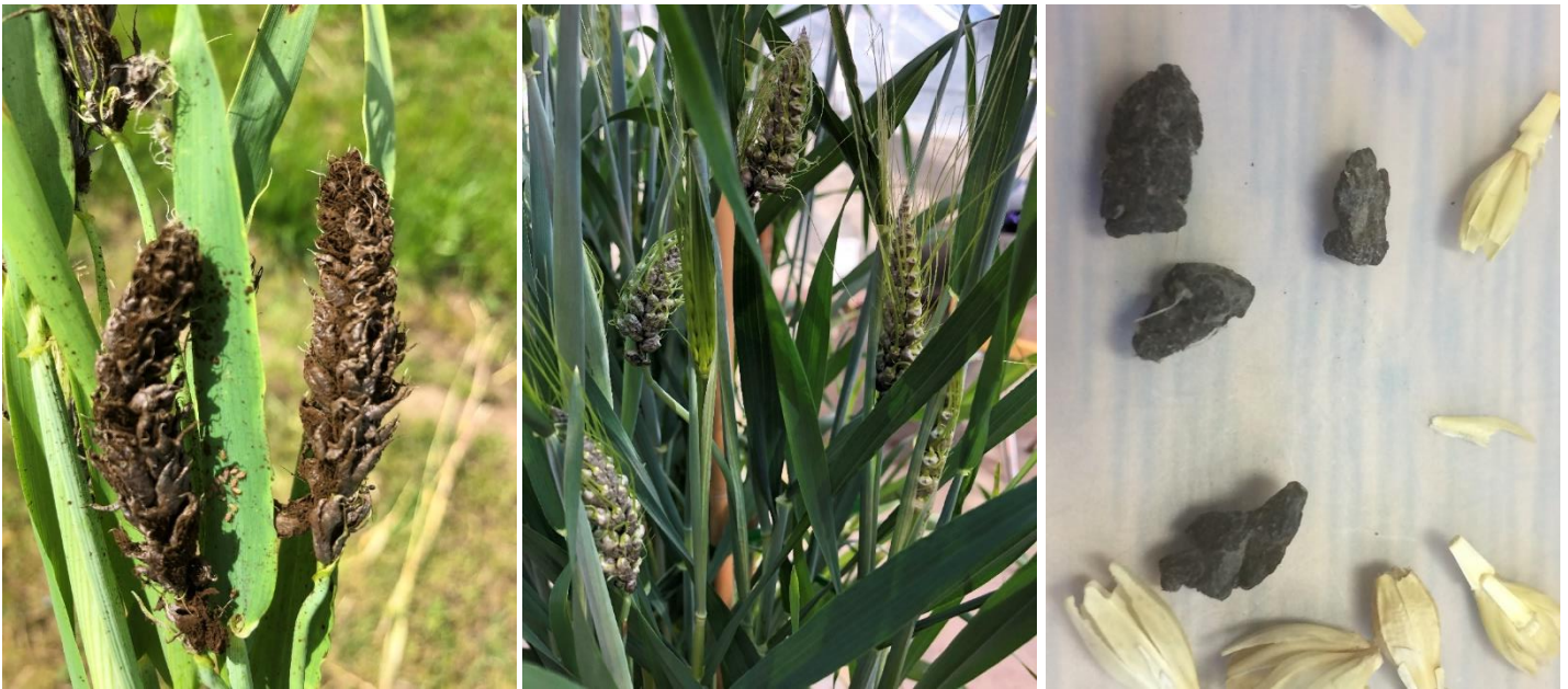
Figure 15. Loose smut infected plant (left photo). Covered smut infected plant (center photo). Covered smut balls found in harvested grain (right photo).