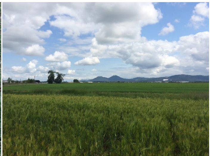
Figure 5. Plots of fall planted barley being evaluated for cold tolerance (left photo). The variety on the left lacks cold tolerance and suffered severely reduced stand due to freezing. Winter barley in the foreground, spring barley in the background (right photo).