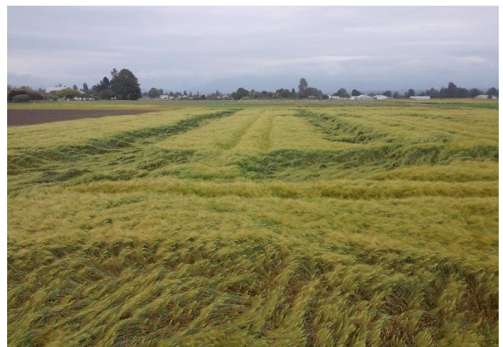
Figure 10. Lodging winter barley during early summer rain. Pattern of lodging is caused by overlapping fertilizer application, resulting in excess growth.

Due to a cool and wet climate and lack of hard, freezing winters, the fungal disease pressure on barley in western Washington is generally more severe as compared to other parts of the state. The most cost-effective approach to managing disease is to select varieties with moderate to high levels of genetic resistance; this information can be obtained from regional variety trials or by contacting seed providers. If genetic resistance is absent, a number of fungicides are available. For more information on control, including fungicide recommendations, the Pacific Northwest Plant Disease Management Handbook (Pscheit and Ocamb 2020) is an excellent resource.