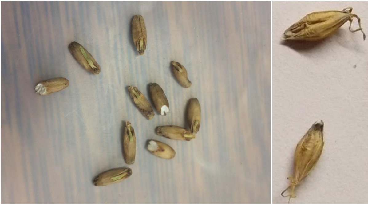
Figure 21. Barley kernels showing rootlet growth caused by preharvest sprouting (right photo). Naked barley kernels showing shoot growth caused by preharvest sprouting (left photo).

Commercial barley fields are harvested with grain combines. It is recommended to adjust concave settings and cylinder speed carefully to avoid excessively cracking kernels or peeling the hulls off covered barley, which will reduce the quality and germination. Small plots can be harvested with a sickle and threshed and winnowed by hand. Barley should ideally be stored at 12–13% moisture for storage longer than six months and only for short periods of time at moisture contents up to 15% to prevent mold and other storage issues. Grain can be harvested at a higher moisture (16%–18%) if grain dryers are available to bring the moisture down before storage. Grain moisture can be evaluated with a handheld moisture meter. For malting barley, a seed drying protocol should be used to preserve embryo viability. Drying at too high a temperature (greater than 110°F) can negatively affect germination rates.