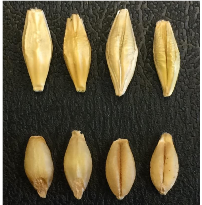
Figure 4. Covered barley (top) and naked barley (bottom).

varieties must be exposed to cold temperatures (“vernalization”) in order for flowering and grain production to be initiated. They also require sufficient winterhardness to survive the winter. If winter barley varieties are planted in the spring, they will remain vegetative and will not produce a grain crop. Spring varieties do not require vernalization and will transition from vegetative to reproductive growth quickly after planting. Spring varieties are generally not winter-hardy and are not recommended for fall planting. Facultative varieties are those that do not require vernalization (like spring types) but have good winterhardness (like winter types). These can be planted in either the fall or spring, giving the farmer considerable flexibility; however, few facultative varieties are commercially available.