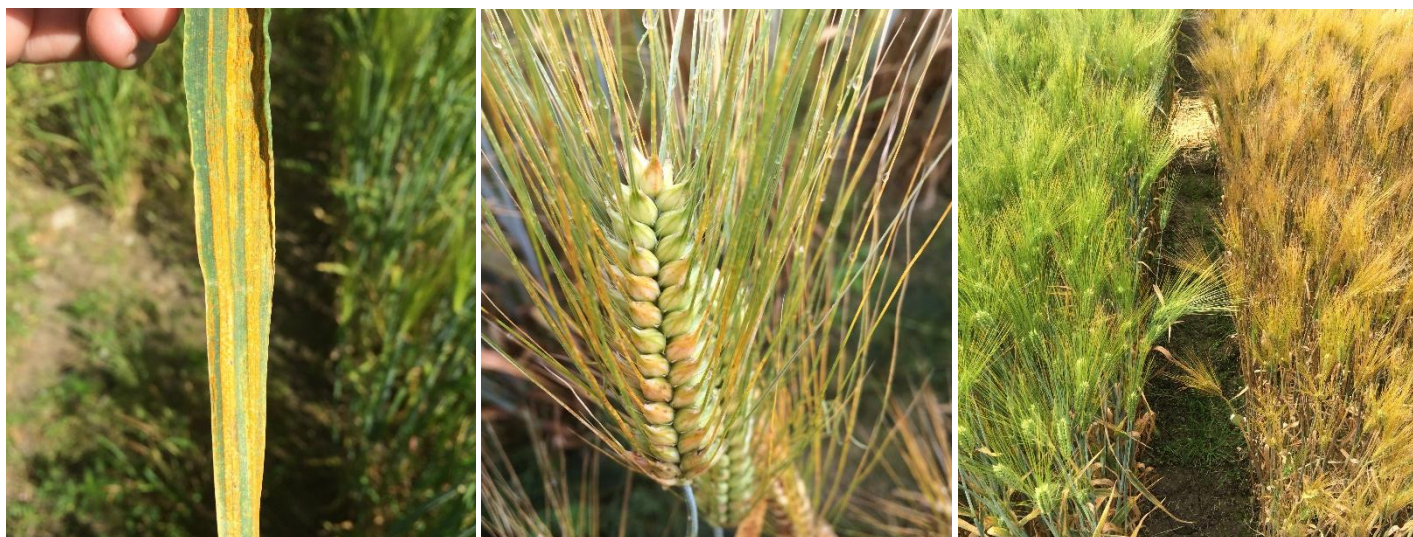
Figure 11. Barley stripe rust infection on leaf blade (left photo). Infected spike (center photo). In plots, healthy barley plants are shown on the left and infected plants are shown on the right (right photo).

Leaf rust, or brown rust, is another fungal pathogen that can affect barley grown in western Washington and be a major disease issue depending on infection levels (Figure 12). Leaf rust can be distinguished from stripe rust by the color and pattern of the urediniospores, which are darker orange brown in color and do not form in a specific pattern on the leaf blade and sheath. Leaf rust infections occur later in the spring and early summer and survive most optimally between 40 and 72°F. Like stripe rust, the spores of leaf rust are wind-distributed, so multiple infections can occur during one season. Both winter and spring barley can be infected by leaf rust. Leaf rust can pass readily from spring and winter barley crops grown in the same general area, so care should be taken to avoid overlapping production if leaf rust control is not possible. Leaf rust can cause significant yield losses, especially if the flag leaf is infected and photosynthesis is restricted.