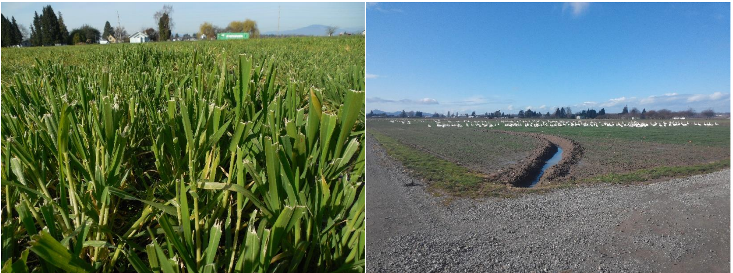
Figure 20. Winter barley damage by feeding snow geese and swans (left photo). Waterfowl grazing on winter grain field with drainage ditch in foreground (right photo).

Barley should be harvested once the kernels become dry enough to thresh cleanly and be stored safely. Winter barley requires approximately nine months from planting to harvest, and spring barley requires approximately four months from planting to harvest. Harvest of winter barley generally begins in mid-July, depending on temperature and grain moisture levels. Harvest of spring barley typically takes place in early to mid-August (Table 3).