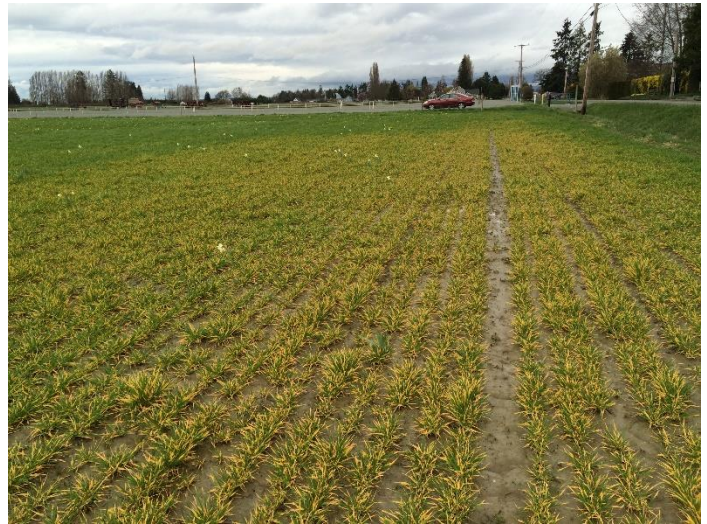
Figure 8. Yellowing in winter barley field due to nutrient limitations caused by waterlogging.

Steps required to prepare the seedbed for barley planting will depend on site conditions, soil type, and the prior crop. If converting established pasture, or a high residue cover crop, a typical sequence of operations involves plowing, discing, and harrowing. Plan to leave approximately four weeks between plowing and planting to allow for breakdown of established sod or heavy cover crop residue, which can tie up nutrients (Dufour et al. 2014). Plowing in the fall can allow for earlier planting in the spring, as sod will have had time to decompose over the winter; however, care should be taken to minimize nutrient leaching and erosion. If possible, a cover crop should be planted to maintain soil cover. If the field is already in annual crop production, lower disturbance methods may be possible, such as discing, cultivating, or harrowing. Rototillers can be used on a small scale. However, they typically cause more disturbance of soil structure and create a finer seedbed than is necessary for planting barley. A chisel plow may also be used in combination with other implements to reduce subsoil compaction. For more information on equipment selection, see Field Equipment for Grain Production on Modest Acreages and Diversified Farm Operations (Bramwell and Brouwer 2019).