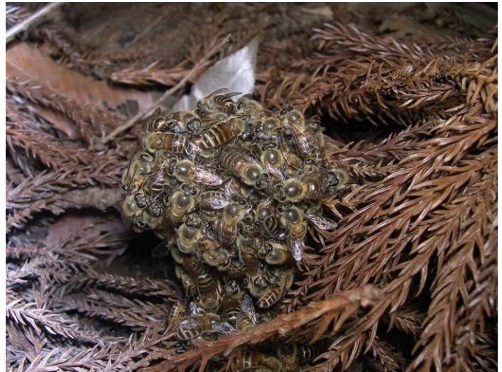
Figure 2. The Japanese honey bees ( Apis cerana japonica ) forming a "bee ball" in which hornets are engulfed and heated. Yokohama, Kanagawa prefecture, Honshu Island, Japan.

The EHB is easy and bountiful prey for the hornets, with no inherent defense mechanisms. As the bees rush out to defend their colony, they are slaughtered by the hornets, most of the adult workers are decapitated and discarded, the few remaining bees are ignored as the hornets collect and transport the bee brood back to their nest. The smaller A. cerana has coevolved with wasp and hornet predators and has developed several behavioral defense mechanisms and counter-attack strategies against them (Figure 2).