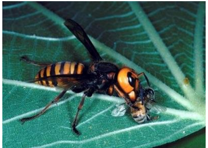
Figure 1. Northern giant hornet macerating a honey bee into a meat ball for transport back to the nest.

Here, we will cover how the NGH will impact the honey bee, give the reader a better understanding of the hornet, outline precautions to take, and first aid if attacked by the hornet.