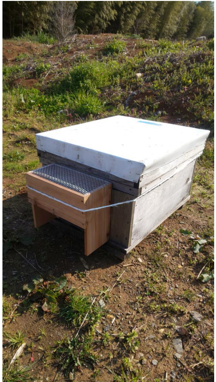
Figure 3. Japanese NGH trap on honey bee hive.

NGH difficult. If you can locate a nest, proceed with extreme caution and contact the WSDA immediately. Do not try to exterminate the nest yourself.