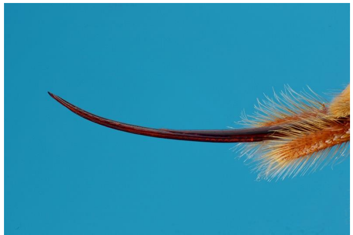
Figure 5. Stinger of V. mandarinia . A close-up of the stinger is shown in the top photo.

(ventrally). Muscular action works the lancets as they alternate their downward movement and tear into the flesh of the victim. As the stinger works its way into the victim, it alternates back and forth, digging deeper at the same time two diaphragms within the venom sac facilitate a pumping action, delivering venom through the hollow main shaft. When the bee flies away, the barbs on the stinger keep it lodged in the victim, leaving the stinger, venom sac, and some of the internal abdomen behind.