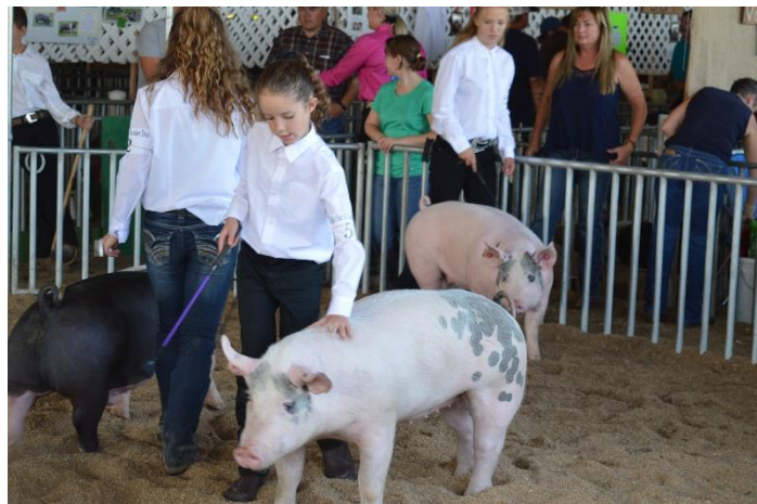
Figure 7. Swine Showmanship class.