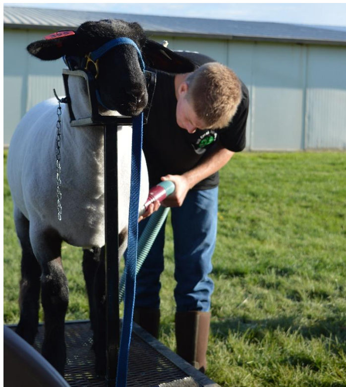
Figure 6. Fitting a market lamb.

There are basically two types of buyers at the market sale of fairs and shows. Buyers may purchase an animal and have it processed at a local butcher. Some fairs and shows will call individuals that purchase animals for home consumption “take out buyers.” Take out buyers pay for the entire price of the animal as well as the cost to process the animal at a local butcher.