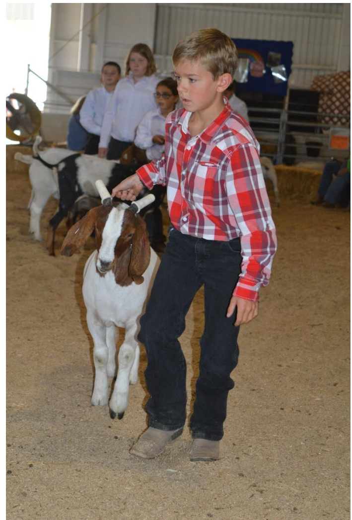
Figure 4. Market Goat class.