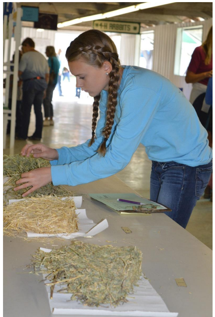
Figure 2. Judging forages.

Before livestock are purchased, it is important to review all requirements for purchase, ownership, participation in a fair or show, and selling a market livestock project at a 4-H livestock