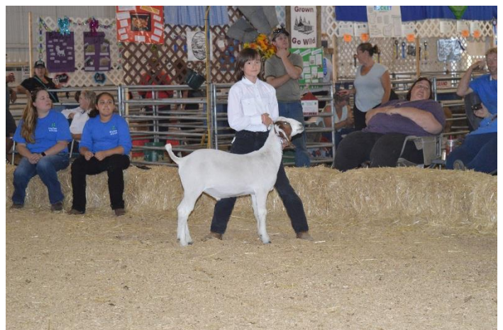
Figure 1. Market Goat class.

Youth with residency in another state may enroll in Washington State 4-H, as long as they follow their own state's minimum age policies. Youth may not be simultaneously enrolled in the same 4-H project in another club, county, or state. For example, youth may not be enrolled in the 4-H Market Beef project in both Oregon and Washington. Contact local county Extension offices when planning to enroll from another county or state.