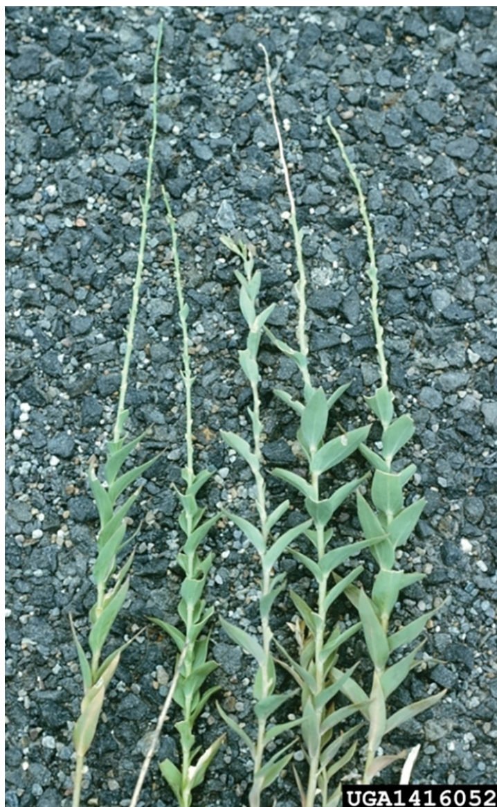
Figure 16. Calophasia lunula larval feeding damage.