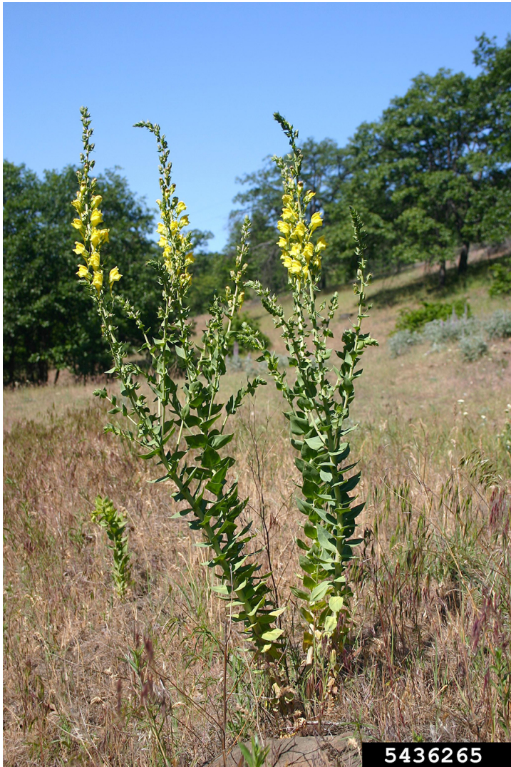
Figure 1. Dalmatian toadflax plant.

Dalmatian toadflax, Linaria dalmatica (L.) Mill. (Figure 1), and yellow toadflax, Linaria vulgaris Mill. (Figure 2), commonly referred to as “butter and eggs,” are two non-native plants that were introduced into North America as ornamentals from the Mediterranean region. Introduced by the 1800s, these two non-native plants have since escaped flower beds and have become two of the most troublesome invasive weeds infesting millions of acres across much of temperate North America. In the Pacific Northwest (defined here as Washington, Oregon, and Idaho) these plants can be found infesting forests, range and grassland, rights of way, lands put into conservation programs like the Conservation Reserve Program (CRP), and other disturbed areas (Sing et al. 2015). Surprisingly, these plants can still be found today occurring in flower beds (Figure 3).