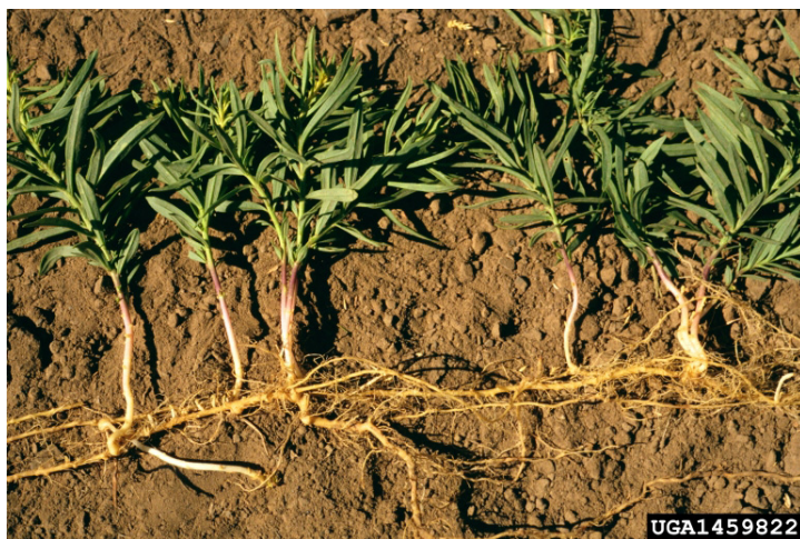
Figure 10. Yellow toadflax root system.

Furthermore, both of the species have an extensive root system that can contribute to their invasive capability (Figure 10; Vujnovic and Wein 1997). Yellow toadflax can produce taproots that can grow up to 3.3 feet deep (1 m), whereas Dalmatian toadflax taproots are large and can penetrate deep down to a distance of 4 to 10 feet (1.2 to 3 m) depending on soil types. Both plants can produce lateral roots or branches that extend out several feet to several yards from the parent plant. Vegetative buds formed along these roots can give rise to new plants the following spring. Dalmatian toadflax root fragments severed by tillage or via other factors as small as 0.4 inches long (1 cm) can give rise to new plants. In contrast, yellow toadflax root fragments need 4 inches or longer (10 cm) in order to develop into a new plant (Sing et al. 2015).