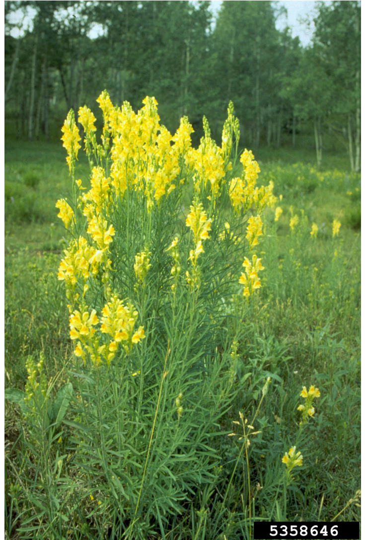
Figure 2. Yellow toadflax plant.