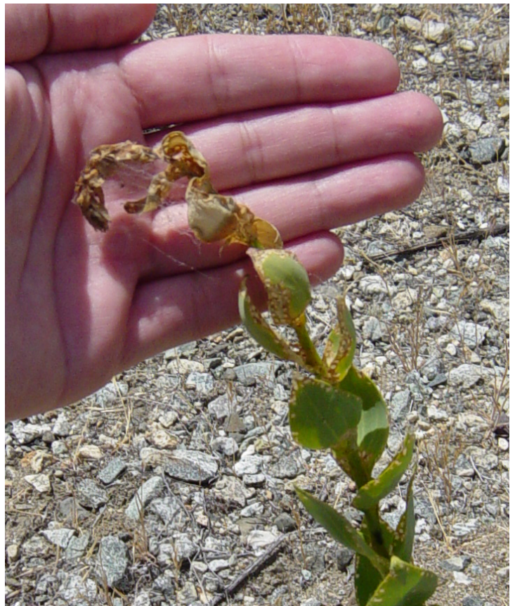
Figure 20. Dalmatian toadflax upper shoot killed from adult feeding.