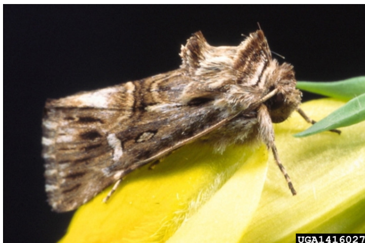
Figure 14. Calophasia lunula adult.

Larvae prefer to consume younger leaves and shoots but will move to and devour older leaves and stems as they continue to develop and as the plants become increasingly defoliated. Smaller plants can be completely stripped of flower buds and leaves, leaving behind naked stems (Figure 16). This type of defoliation can kill seedlings and one-year-old plants, diminish root sugar reserves, and eventually impact plant vigor and reduce seed production in more mature, established plants (Peterson et al. 2005).