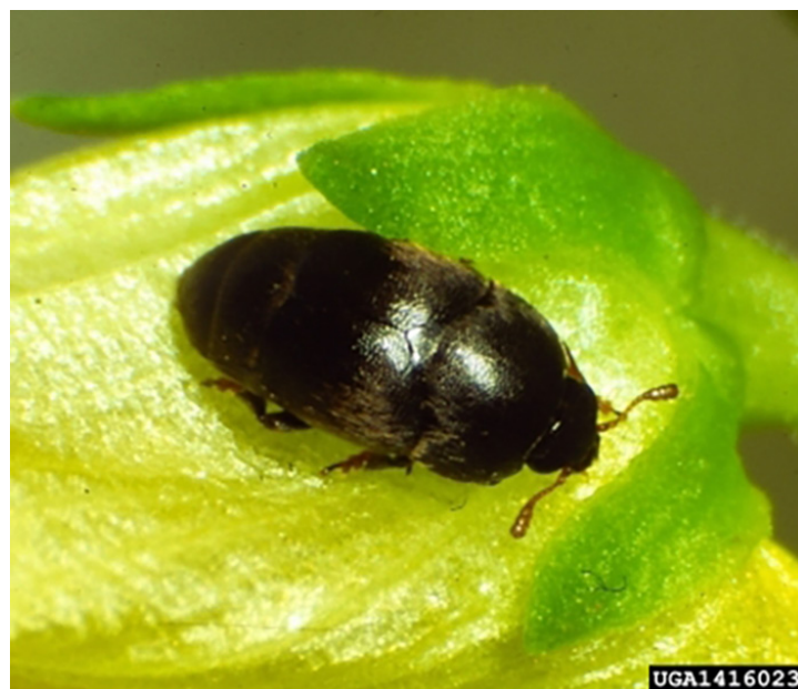
Figure 13. Toadflax flower-eating beetle Brachyterolus pulicarius .

While this agent is widespread, its overall impact is less than desired. On Dalmatian toadflax in the US, adult feeding damage results in plant stunting and leads to increased secondary branch production. This overall damage is considered minimal at most sites. This insect prefers yellow toadflax and at times can reduce seed production by 80–90%. Any seeds produced by beetle-damaged flowers are typically smaller and less viable than seeds from non-infested flowers. However, even with the potential to destroy a large percentage of seed, the overall impact has been shown to be minimal, even on its preferred host (Sing et al. 2015).