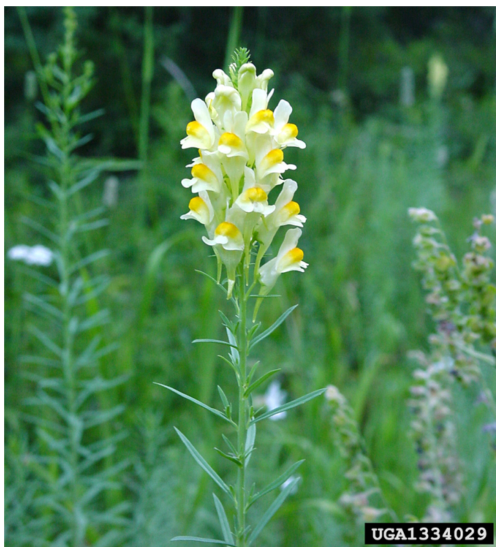
Figure 8. Yellow toadflax flowers.

appearance. It has been suggested that drought-stressed plants having experienced unfavorable environmental conditions may play a role in why plants may possess both broad and narrow leaves (Sing et al. 2015).