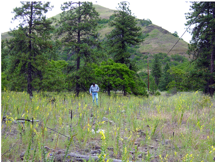
Figure 4. Dalmatian toadflax infestation.

Dalmatian and yellow toadflax belong to the plantain (Plantaginaceae) family. New seedlings (Figure 5) rapidly grow to produce mature, upright stems (Figure 6). Both plants produce upright stems, 11 to 35 inches (Dalmatian toadflax) and 11 to 24 inches (yellow toadflax). Dalmatian toadflax is more robust than yellow toadflax with increased branching in the upper third of the plant.