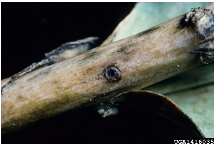
Figure 19. Mecinus janthiniformis oviposition scar.

Pupation occurs starting in mid-June through early September for both species in oval chambers formed within the mined stems (Figure 21). It takes an average of 50 to 63 days to go from egg to adult. Newly formed adults overwinter within the feeding chambers in the dead stems. During the following spring, adults will chew their way out of the old stem in search of new plant growth, leaving a small round hole. Therefore, it is important not to destroy or remove the old stems as this would be detrimental to either Mecinus spp. This weevil completes one generation per year. Toadflax stems that lack sufficient snow cover can expose adults to cold temperatures and humidity. Temperatures that reach -18.5^{\circ}\text{F} ( -28^{\circ}\text{C} ) can severely impact survivability with documented mortality rates of 75% to 100% (Sing et al. 2015).