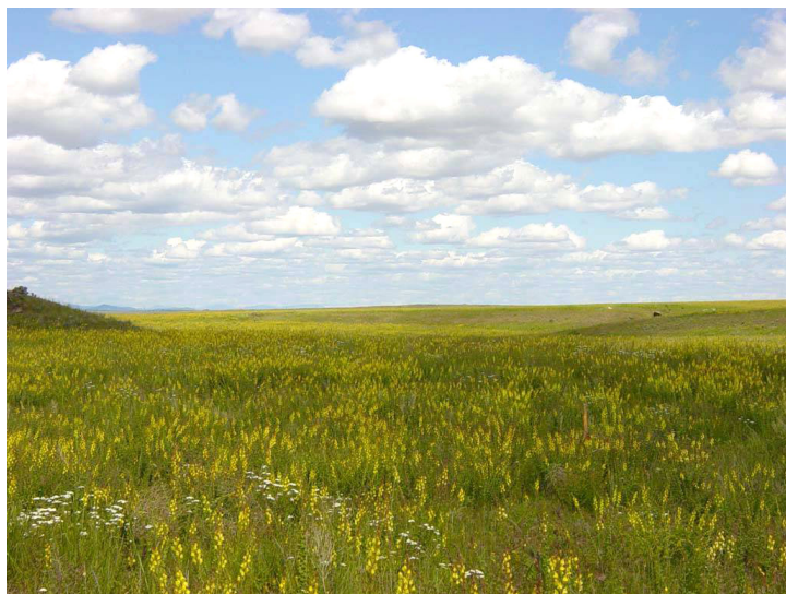
Figure 12. Conservation Reserve Program toadflax infestation.

Both toadflax species have become pervasive in the Pacific Northwest (Figure 11). Dalmatian toadflax has become particularly problematic in rangeland and land enrolled in CRP (Figure 12), thereby reducing the diversity and value of the land. The cost of control for severe infestations can quickly exceed the “annual rental payments” issued by the US Department of Agriculture. This program pays producers to remove environmentally sensitive land from agricultural production and plant species that will improve environmental health and quality.