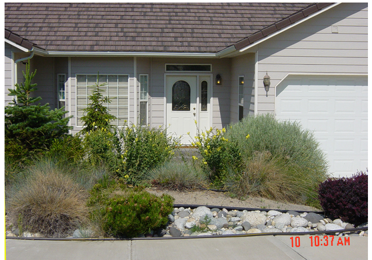
Figure 3. Dalmatian toadflax ornamental planting (2009).