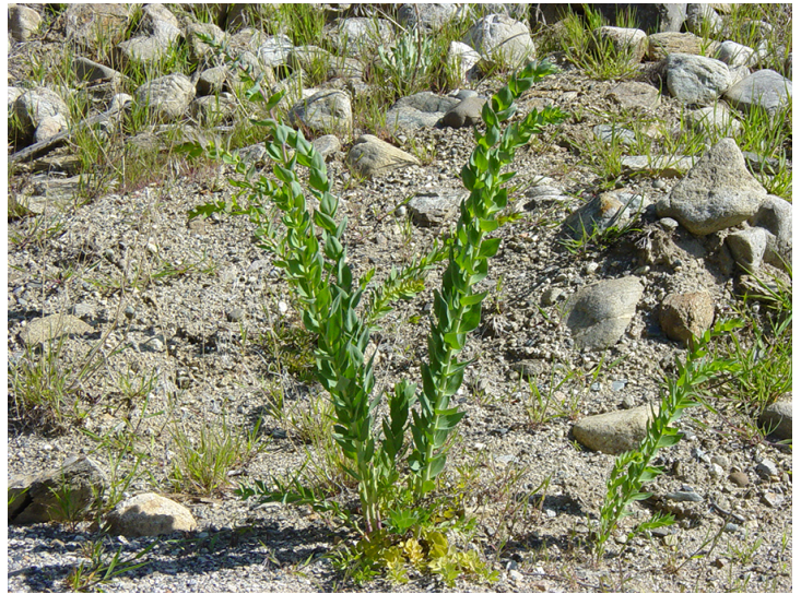
Figure 6. Dalmatian toadflax mature stems.

Dalmatian toadflax has light blue-green, waxy, pointed, heart-shaped leaves that clasp the stem, while the leaves of yellow toadflax are pale green, long, narrow, and pointed at both ends. Flowers of Dalmatian toadflax occur in clusters with the separate flowers attached by short, equal stalks at equal distances along a central stem (Figure 7). They can range from 0.75 to 1.5 inches long, are bright yellow with a yellowish-orange bearded throat and have a long, straight, or somewhat curved spur. Flowers of Dalmatian toadflax are one inch or longer, bright yellow with an orange throat, and long spur. Yellow toadflax flowers, on the other hand, are also one inch or longer but are a more pale yellow and have a brighter orange bearded throat (Wilson et al. 2005). Flowers of both toadflax species appear as dense terminal clusters that gradually elongate, with new flowers forming above as the fruits mature below (Figure 8).