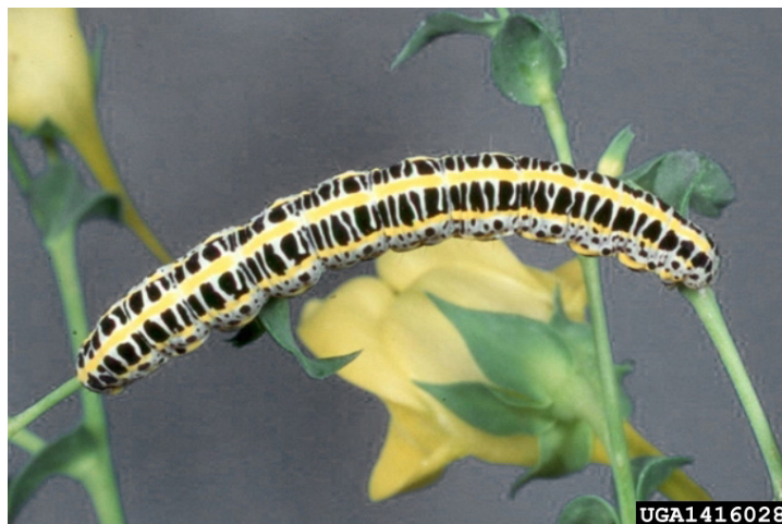
Figure 15. Calophasia lunula larva.