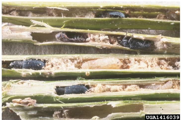
Figure 21. Mecinus janthiniformis larval feeding damage.

M. janthiniformis is highly effective and one of the most destructive and successful biocontrol agents released for Dalmatian toadflax in North America. This insect has been shown to be an excellent flier and can quickly move throughout toadflax-infested areas. It has been recorded traveling over two miles in just four years from release sites in Canada. Since its introduction into the US, M. janthiniformis has readily established itself, spread very rapidly from release locations, and has provided 100% control of Dalmatian toadflax at some sites within three to five years after release.