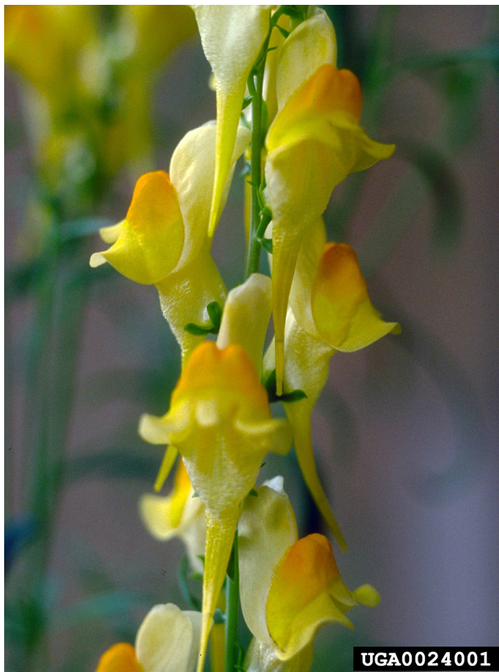
Figure 7. Dalmatian toadflax flowers.