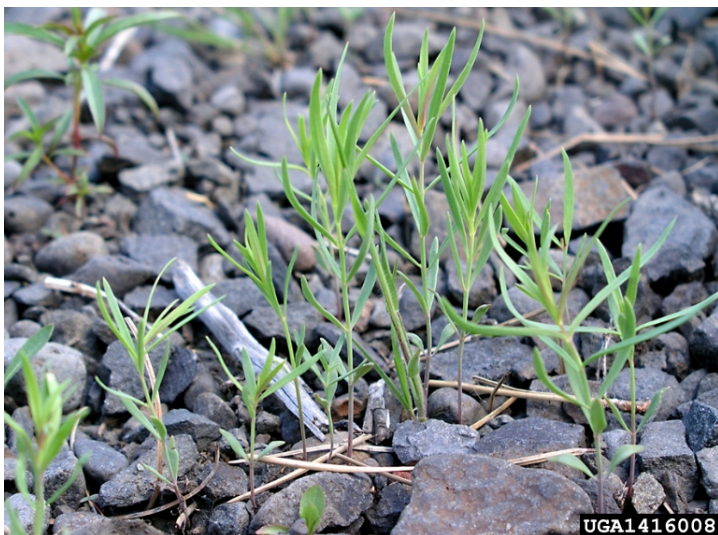
Figure 5. Dalmatian toadflax seedlings.