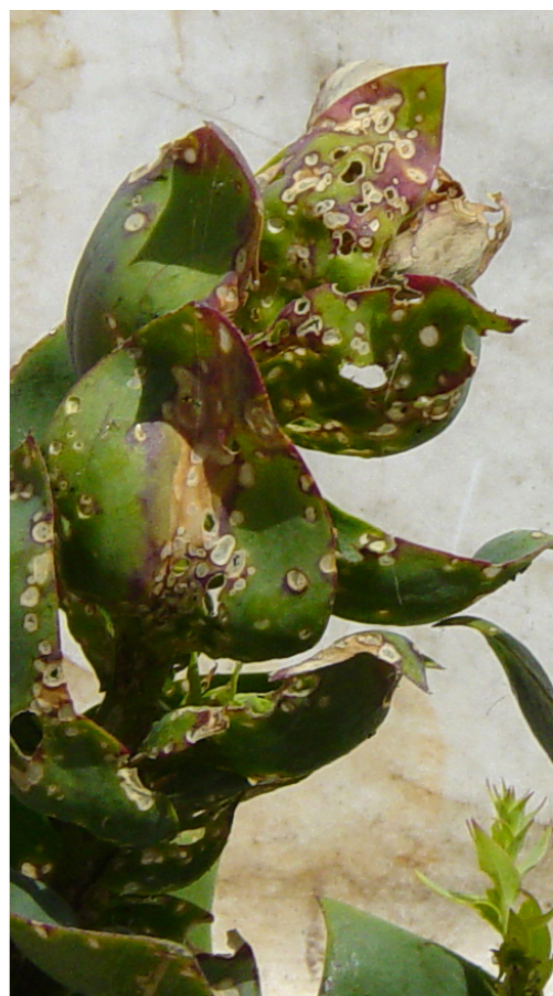
Figure 18. Mecinus janthiniformis adult feeding damage.

inhibiting potential flower development and seed formation (Figure 18). Up to 100% of the plants in an area may experience injury from adult feeding once the insect has become well established (for Dalmatian toadflax only).