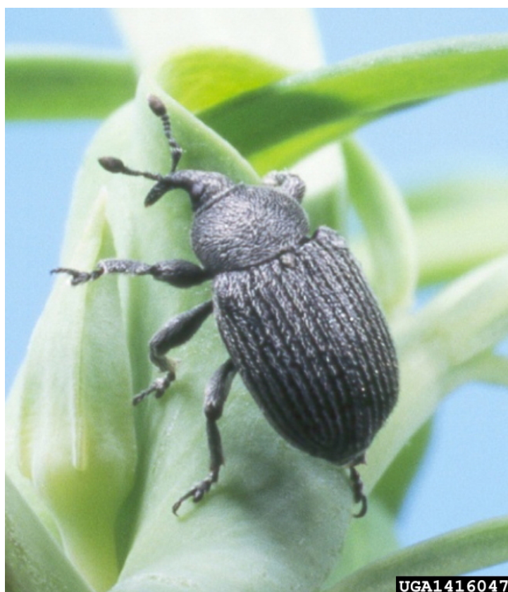
Figure 22. Toadflax seed-galling weevil Rhinusa antirrhini .

Adult weevils are gray to black and covered in dense, short hairs. They have a long, curved pointed snout with a pair of elbowed antennae arising near the base of the snout (Figure 22). The size of this weevil varies depending on which toadflax plant it has been utilizing. Adults that have developed on yellow toadflax are smaller in size, 2.5 to 3 mm long, while those utilizing Dalmatian toadflax as a host can be up to 5 mm long. (Sing et al 2015).