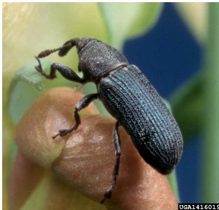
Figure 17. Stem-boring weevil Mecinus janthiniformis for Dalmatian toadflax.

Newly emerged adults are bluish-black, somewhat cylindrical in shape, about 0.2 inches in length, and have a long, curved snout (Figure 17). A number of site-specific factors such as elevation, latitude, and if any snow cover remains at the site can all influence adult spring emergence. Adults are generally active from late April to mid-August (Sing et al. 2015). They can often be found in large numbers on the upper third of the plant, feeding on the new succulent foliage and buds. Damage on the leaves, shoots, and stems caused by adult feeding resembles a shot hole pattern. Extensive feeding damage can result in the death of the terminal portions of the stems, thus