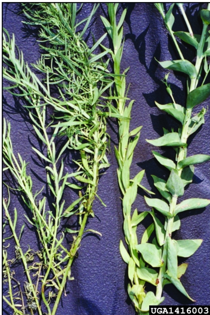
Figure 9. Hybrid toadflax plant (center) between yellow toadflax (left) and Dalmatian toadflax (right).