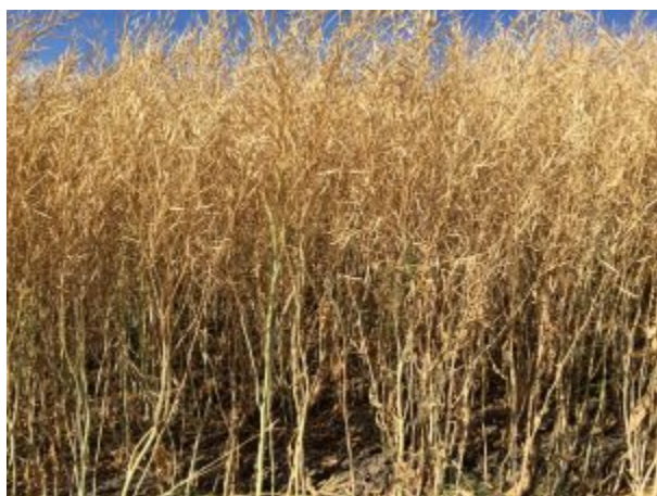
Figure 5. Mustard at the Wilke Farm.