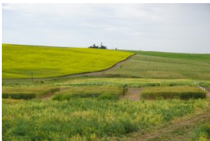
Figure 1. Cropping systems research at Wilke Farm.