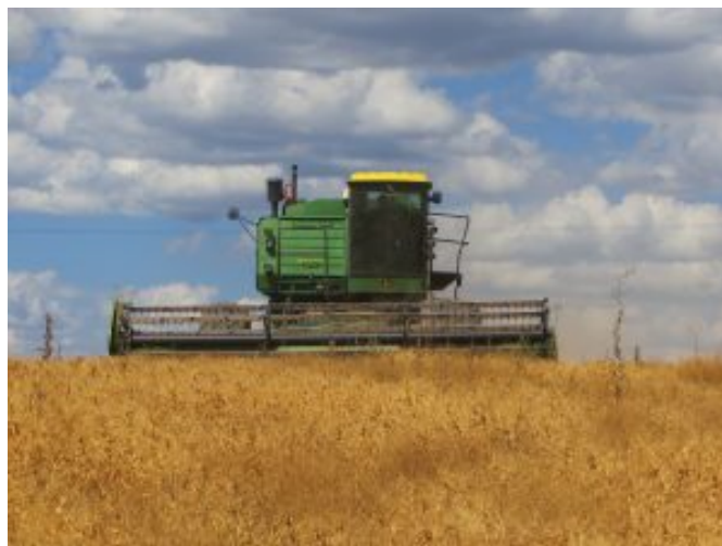
Figure 4. Harvesting Winter Peas.