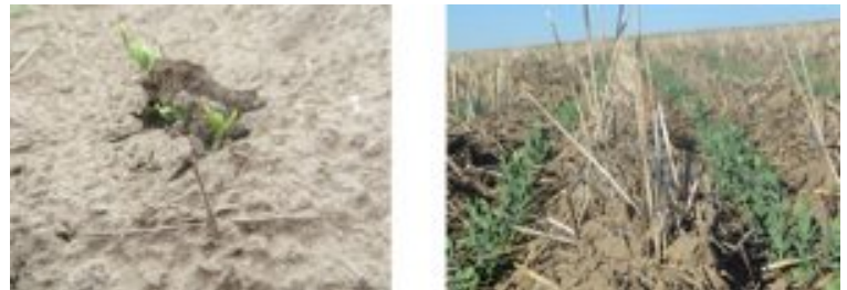
Figure 10. Winter yellow pea emerging from deep seeding and crusting conditions (left) and good stand establishments (right) were observed a month after planting at WSU Wilke Farm.

‘Windham’ winter yellow peas were seeded on 25 acres of no-till fallow on the WSU Wilke Farm on August 25, 2015. They were seeded at 75 lb/acre and 1 gal/acre 7-23-3-0 fertilizer, 0.5 gal/acre 14% humic acid, 12 oz/acre 9% zinc, 16 oz/acre 10% boron, and 6.5 oz/acre Capture LFR insecticide was applied with the seed. Forty-five days after seeding, 6.0 oz/acre Assure II and 1.0 qt/100 gal Activate Plus were applied. A second post-emergence weed control application was applied on March 31 mostly for mustard control. This application included 4.0 oz/acre Raptor and 7 qt/100 gal Noble crop oil concentrate. Eight days prior to harvesting 32.0 oz/acre Gramoxone SL 2.0 and 1.5 qt/100 gal Activate Plus were applied to aid with harvest. An additional 48 oz Gramoxone SL 2.0, 1.0 qt/100 gal Activate Plus and 3.0 oz/acre Interlock were applied to remove weed regrowth a month after harvest.