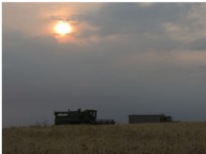
Figure 3. Harvest at Wilke Farm.

Red italicized crops are those that have been altered for cereal rye management.