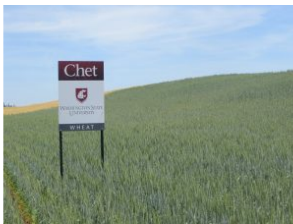
Figure 2. Chet Wheat.