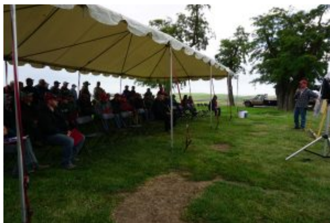
Figure 6. Wilke Field Day.