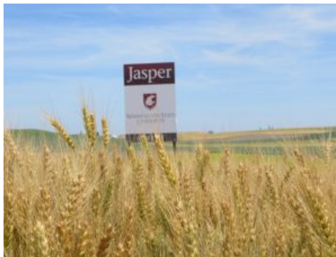
Figure 8. Jasper Winter Wheat Research Plots.