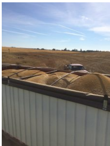
Figure 12. Truck Load of Oriental Mustard.