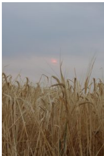
Figure 7. Spring barley at Wilke Farm.

Red italicized crops are those that have been altered for cereal rye management.