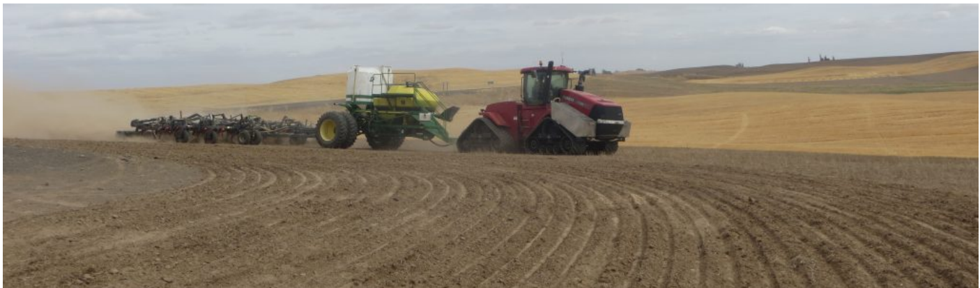
Figure 11. Seeding Peas.