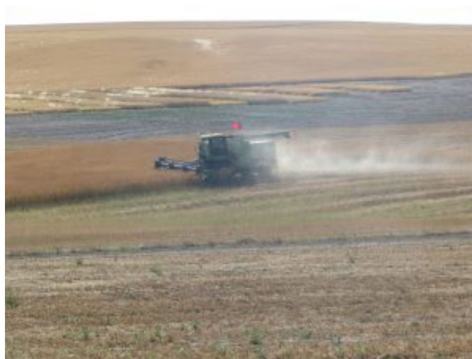
Figure 13. Harvesting Oriental Mustard.