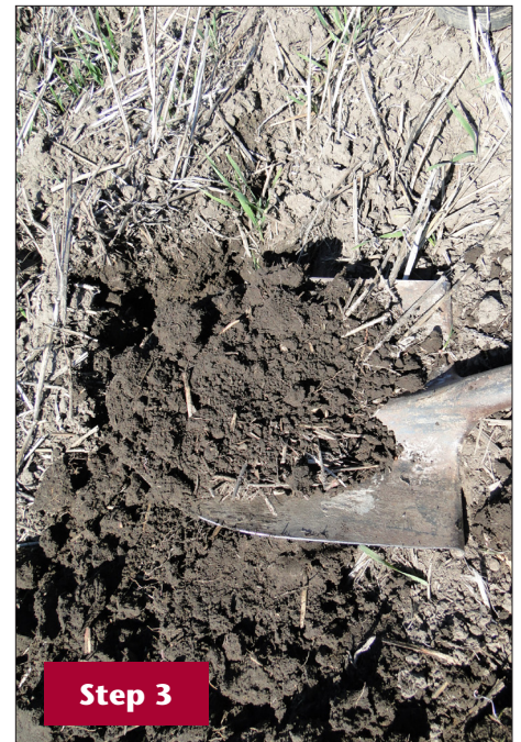
Figure 2. The three steps for shovel sampling for wireworms.