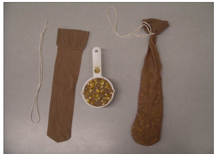
Figure 3. Filling up the nylon bait trap with wheat and corn seed.

Step 3: Dig a hole in the soil approximately 3–5 inches deep and 8–10 inches wide. Place the bait trap in the hole and spread the grain mixture across the bottom of it. Leave the string outside the hole to help relocate the trap (Figure 4).