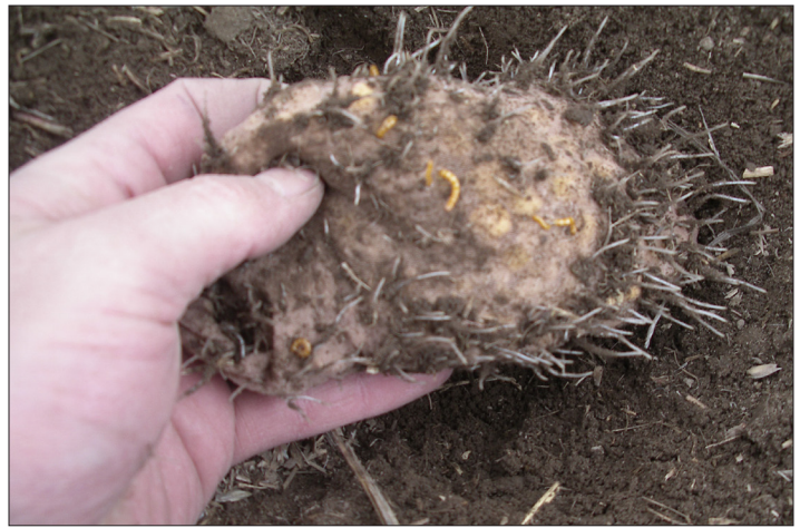
Figure 6. Wireworms caught in the mesh of a bait trap.

Step 7: Cut the bait trap open and examine the grain