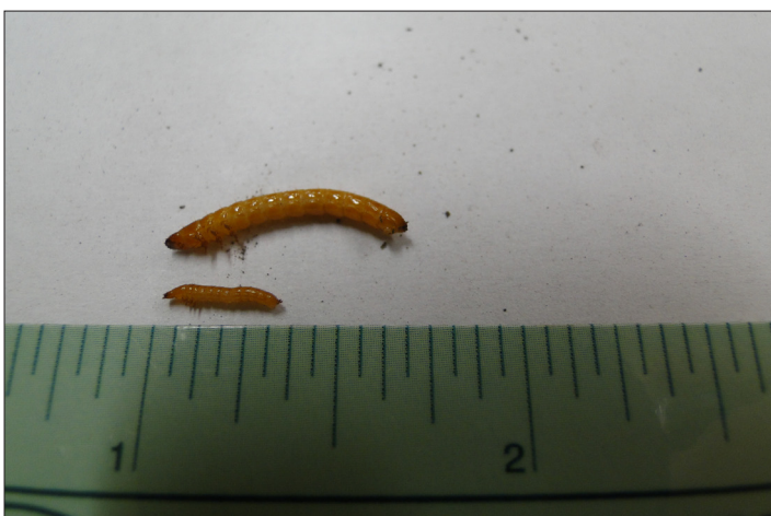
Figure 1. Wireworms vary in size.

The first requirement when scouting for wireworms is to be able to correctly identify them. Wireworms are \frac{1}{4} to \frac{3}{4} inch long, have hard, slender, semi-cylindrical bodies, and are white, yellowish, or coppery color. They have 3 pairs of short legs located behind the head (Figure 1).