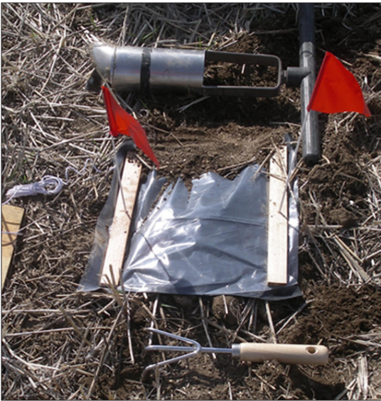
Figure 5. Bait trap covered with black and clear plastic and flagged.

both the black and the clear plastic to wood lath and drill a hole for a flag that will keep the plastic in place and make it easier to relocate the site.