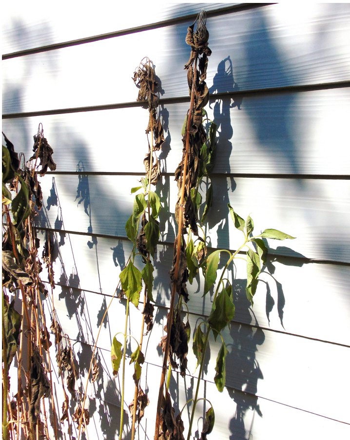
Fig. 1. Wilting symptoms of white mold on Jerusalem artichoke in a home garden.

White mold is a major disease of both Jerusalem artichoke and sunflower. Sometimes called Sclerotinia stem rot, it is caused by the fungus Sclerotinia sclerotiorum . Initial symptoms of white mold on Jerusalem artichoke typically appear in late summer and first appear as wilting tops. Eventually, tops form a curled and drooped “shepherd’s crook” as leaves darken and become dry (Fig. 1).