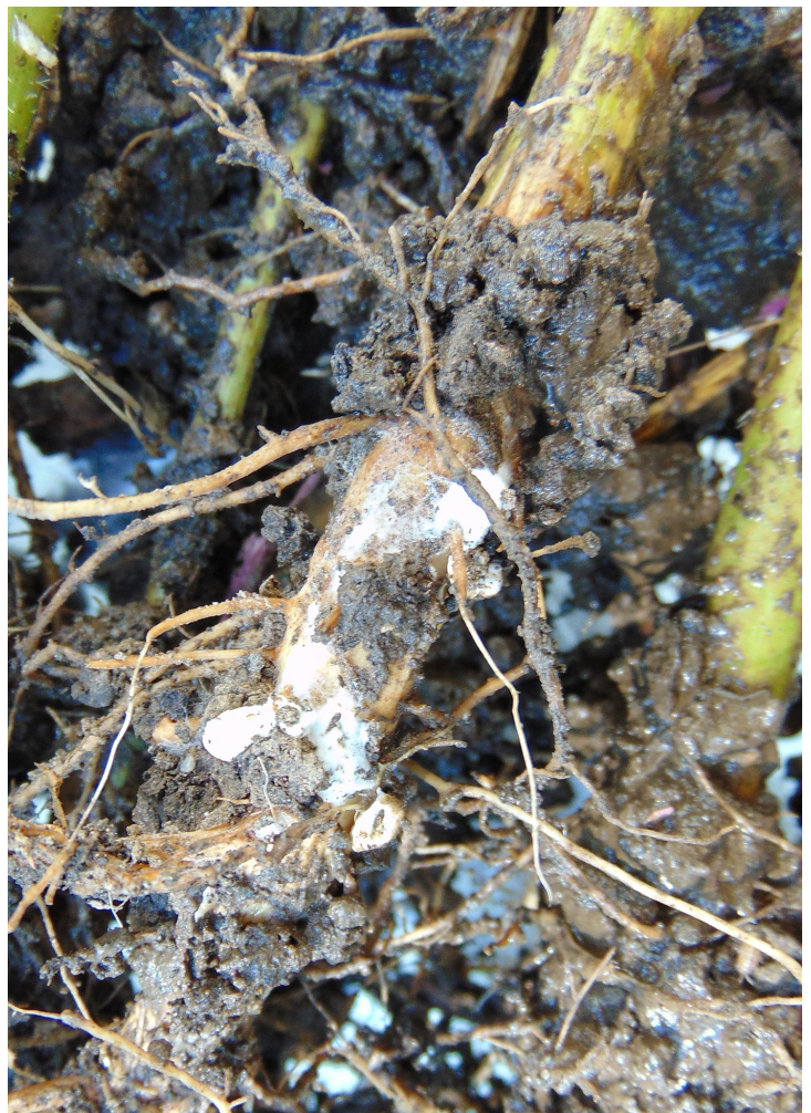
Fig. 2. Dense white mycelium on lower stalk and upper root of Jerusalem artichoke.

Microscopic ascospores are a key inoculum of white mold on Jerusalem artichoke. During cool, moist conditions, these spores are released from small (often less than a quarter-inch wide), cup-shaped, brown apothecia. These spores germinate under high humidity. Subsequent growth on a food base of senescent or dead plant material is required in order to infect the living host. These conditions are usually found in the shaded lower canopy of the plant.