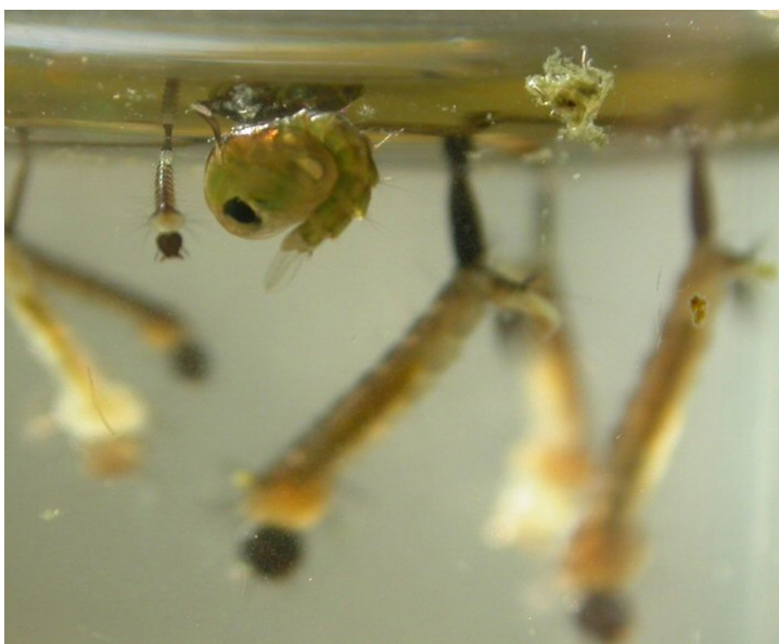
Figure 3. Pupa of a mosquito in the foreground with the larvae in the background.

Larvae then pupate in the water until the adult is ready to emerge. Pupae are often referred to as “tumbler,” due to their characteristic movement when startled (Figure 3).