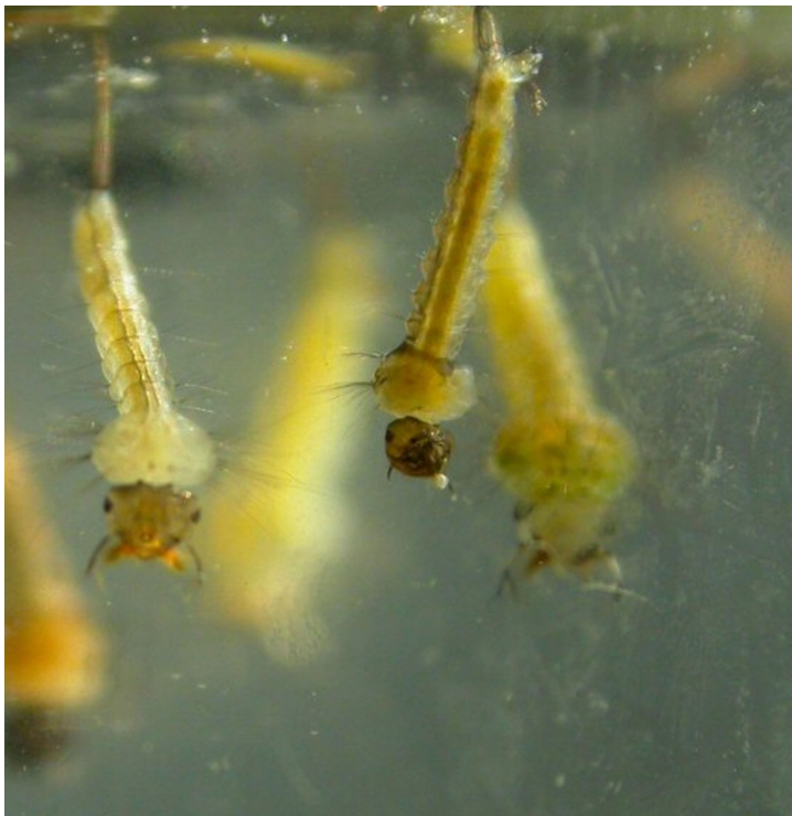
Figure 2. Larvae of mosquitoes suspended in pond water.

Mosquito eggs hatch into larvae, which are aquatic and need standing water to filter-feed on organic debris in the water (Figure 2). Mosquito larvae have a characteristic breathing tube. When startled, larvae wiggle away from the water's surface to seek protection in deeper water.