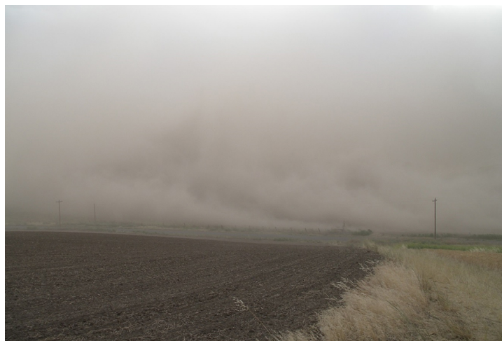
Figure 1. Wind erosion may be created with excessive tillage in traditional summer fallow systems.

Despite its identified advantages, conservation tillage fallow is not widely used in eastern Washington (Janosky et al. 2002). Wheat farmers generally do not practice no-till (i.e., chemical