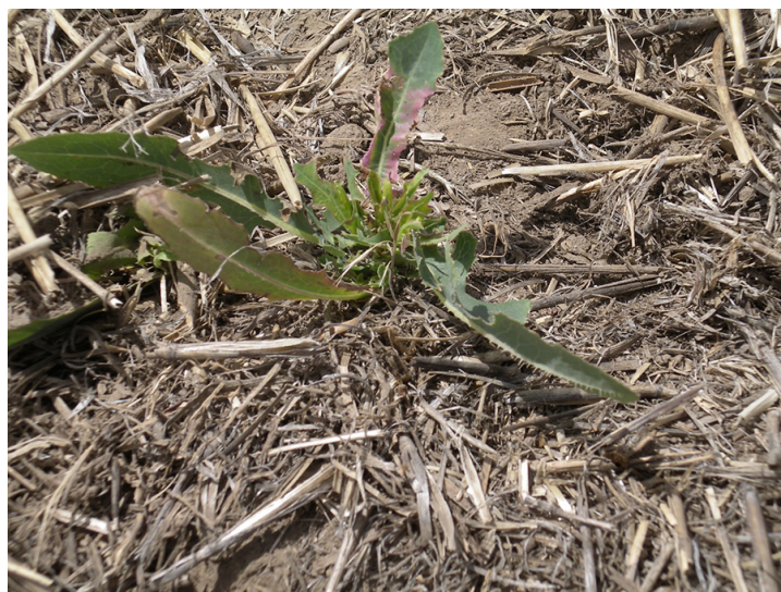
Figure 2. Prickly lettuce ( Lactuca serriola L.) is one of the species of “hard to kill” weeds in a NTF systems that the cooperators are having difficulty controlling with glyphosate herbicide. This plant is showing glyphosate damage but will continue to grow and produce seed if not controlled.

herbicide) summer fallow because of increased evaporative loss of seed zone soil moisture during the dry summer months compared to tillage fallow (Zaikin et al. 2007). Our objective was to examine the value of a one-time “sweep” cultivation to improve seed zone moisture and kill weeds that can be troublesome (Figure 2) with multiple applications of primarily glyphosate herbicide application compared to a true NTF system. This practice is also designed to minimize or delay the development of weed biotypes resistant to herbicides, for example, glyphosate, which is currently the most widely used herbicide for fallow management.