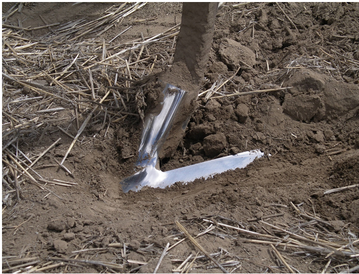
Figure 3. A 10-inch sweep on an 8-inch shank spacing was run two inches deep to sever weeds not fully controlled by glyphosate application.

During the last two years of the OFT a third “early” sweep treatment was incorporated into the study to evaluate the timing of the sweep application (Table 1).