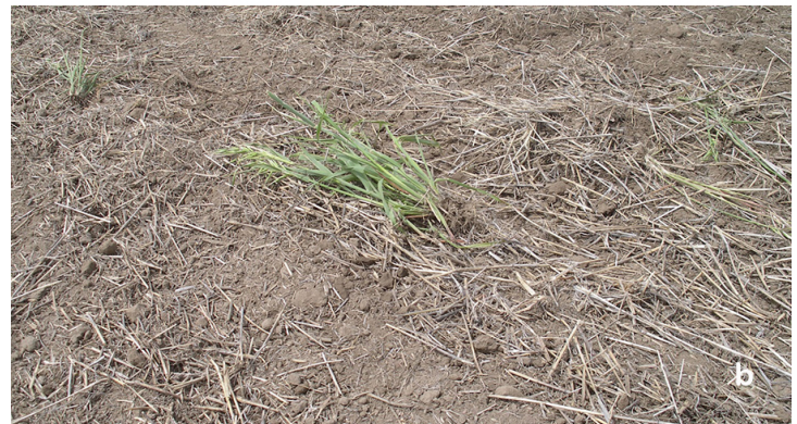
Figure 8. In conclusion, a single Sweep in fallow did not impact grain yield or test weight (a), but did remove difficult to control weeds (b).