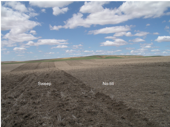
Figure 4. The OFT was a randomized complete block design with four replications each of the four years. Plot size was 43 feet wide and at least 600 feet long each year. The study site was harrowed each spring to help with residue management.