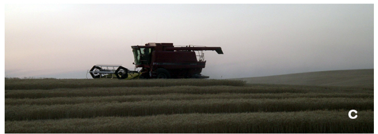
Figure 5. The cooperators establishing the sweep treatments (a), seeding the OFT with a ConservaPak no-till drill (b), and harvesting the plots (c).