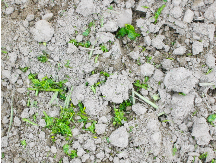
Figure 3. Green manure crop that has been incorporated into the soil.

Current practice is to chop the green manure before incorporating to ensure that this mixing occurs (Figure 3). A high-speed flail chopper, such as those used by some grass seed and asparagus growers, may be the best implement for this. See Mustard Green Manures (McGuire 2016) for more information on green manure incorporation.