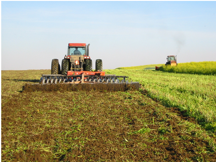
Figure 1. A mustard green manure crop being chopped and disked in the fall before spring potato planting.

A green manure is a crop that is grown and then incorporated into the soil while still green. This practice was widely used to improve soils and provide nutrients to crops before synthetic fertilizers became available. Recently, innovative farmers have been giving this old technology a new look with mustard green manures (Figure 1). Washington potato producers are using green manures to produce better crops by improving the quality of their soils. In contrast to the low-input, low-management green manures of the past, mustard green manures require fertilizer, irrigation, and intensive management. They require a current understanding of soil ecology, soilborne pests, plant biochemistry, and breeding and screening techniques. And unlike synthetic fertilizers, they can improve the soil's physical, chemical, and biological qualities (McGuire 2003).