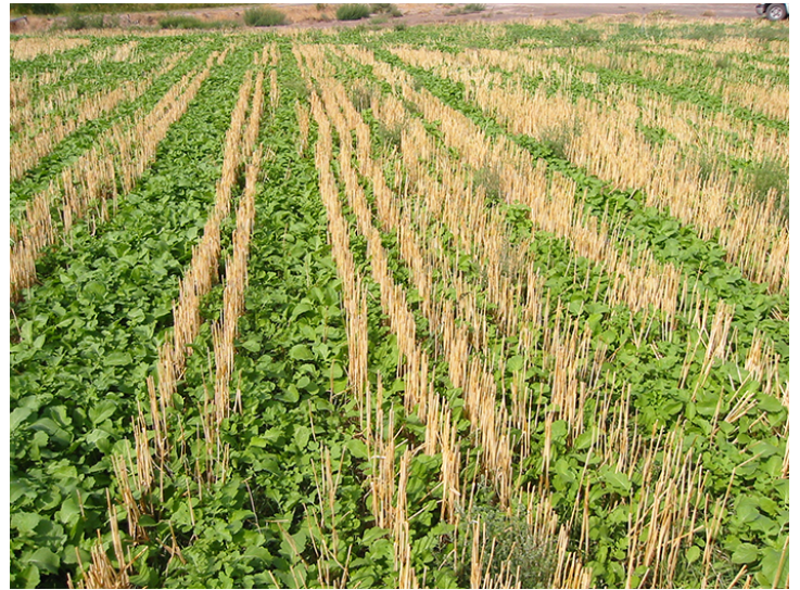
Figure 4. Green manure crop growing in standing wheat straw.

This should not prevent you from developing your own system, but be aware of the possible complications when changing system components.