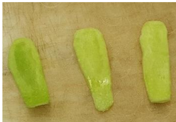
Figure 2. Segments of peel from three apples.