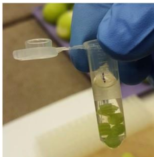
Figure 7. Add 1 mL hexane to the centrifuge tube with discs of peel.