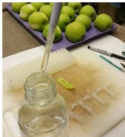
Figure 6. Remove 1 ml aliquot of hexane. The hexane should be decanted from stock bottle into a Schott bottle to prevent contamination.