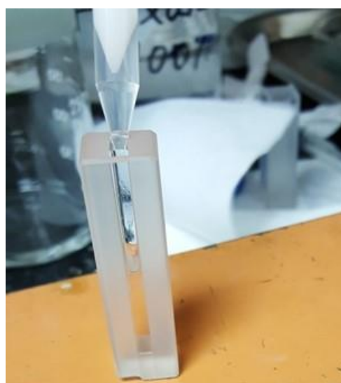
Figure 8. Add sample solution to quartz cuvette, after 10 minute incubation and triple inversion.