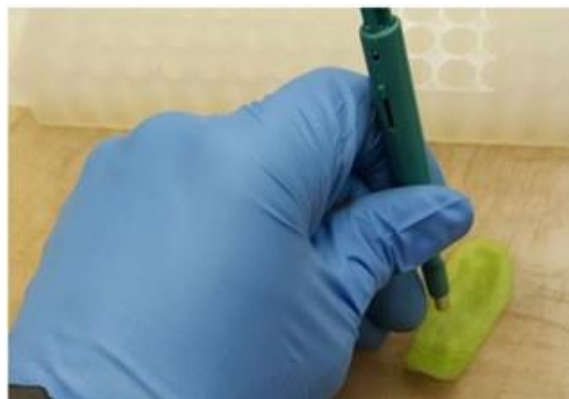
Figure 3. Remove discs of peel with a biopsy punch.