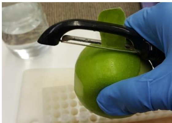
Figure 1. Peeling apple from stem bowl to calyx.