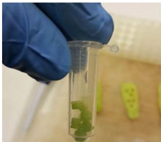
Figure 5. Eighteen discs in a centrifuge tube.