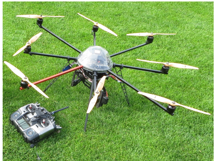
Figure 1. Rotocopter type sUAS are commonly used in agriculture.

The most utilized sUAS are rotocopter and fixed-wing systems (Figures 1 and 2). Rotocopters (also called multi-copter or multi-rotor) have highly flexible flight attributes and use anywhere from a few to many rotary propellers. Often, the name signifies the number of rotors used on the sUAS. For example, quad-, hexa-, and octo-copters respectively signify the use of 4, 6, and 8 rotors. Rotocopters offer several advantages as they can hover at a chosen point of interest for a pre-determined time, use GPS-based waypoint navigation, fly horizontally and vertically, and require very little space for takeoff and landing. The limitations include lower travel speed and shorter flight times, limiting coverage of larger fields.