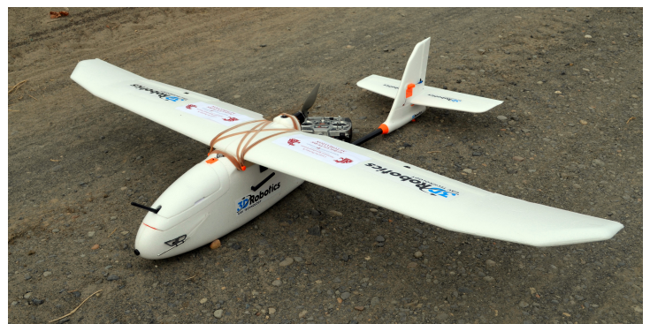
Figure 2. Fixed-wing sUAS also are commonly used in agriculture.