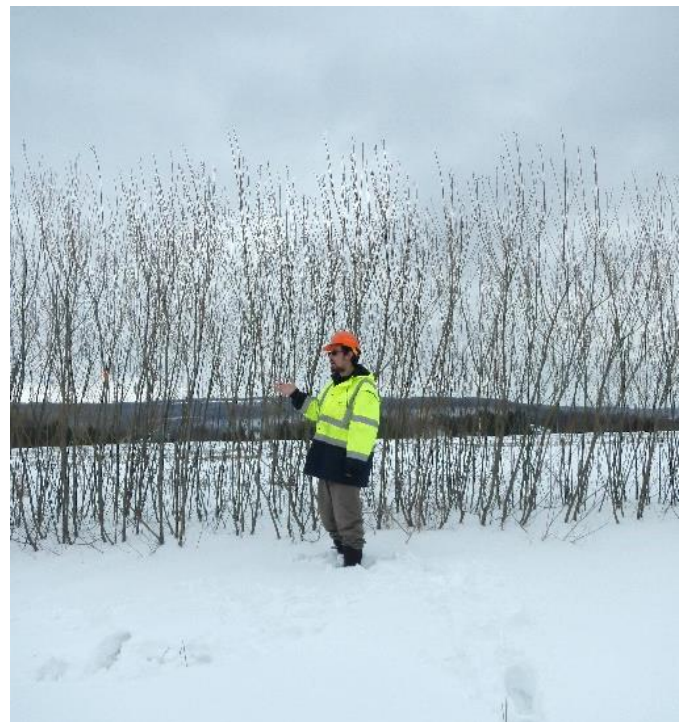
Figure 2. A snow drift formed around a shrub willow living snow fence along an interstate highway in New York State. The willow stems act as a windbreak causing blowing snow from the open field upwind of the fence to be safely deposited in drifts around the fence before it reaches the road.

When the snow holding capacity of the fence exceeds the seasonal quantity of blowing snow at a site, the length of the downwind snow drift formed between the fence and road is decreased (Figure 1 and Figure 2). Studies in New York State and Minnesota have shown that willow LSFs can grow to heights that create excess storage capacity in as little as three years after planting (Heavey and Volk 2014;