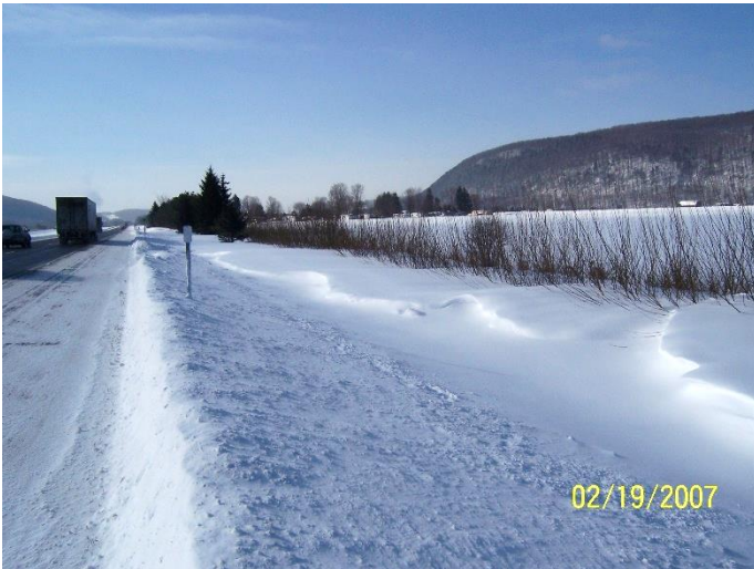
Figure 3. Perpendicular view of a shrub willow LSF in New York State. The amount of open space in the fence achieved by planting one willow shrub per linear foot of fence. This creates a fence that has the maximum snow holding potential relative to the height of the willows.

Zamora et al. 2015), and can likely achieve similar results in similar climates. This excess capacity shortens the downwind drift length and allows willow LSFs to be safely planted in closer proximity to roadways compared to other species (Figure 3). This expands the number of sites on which LSFs are possible and avoids land rental payments when the land available for planting is limited to the transportation agency right of way.