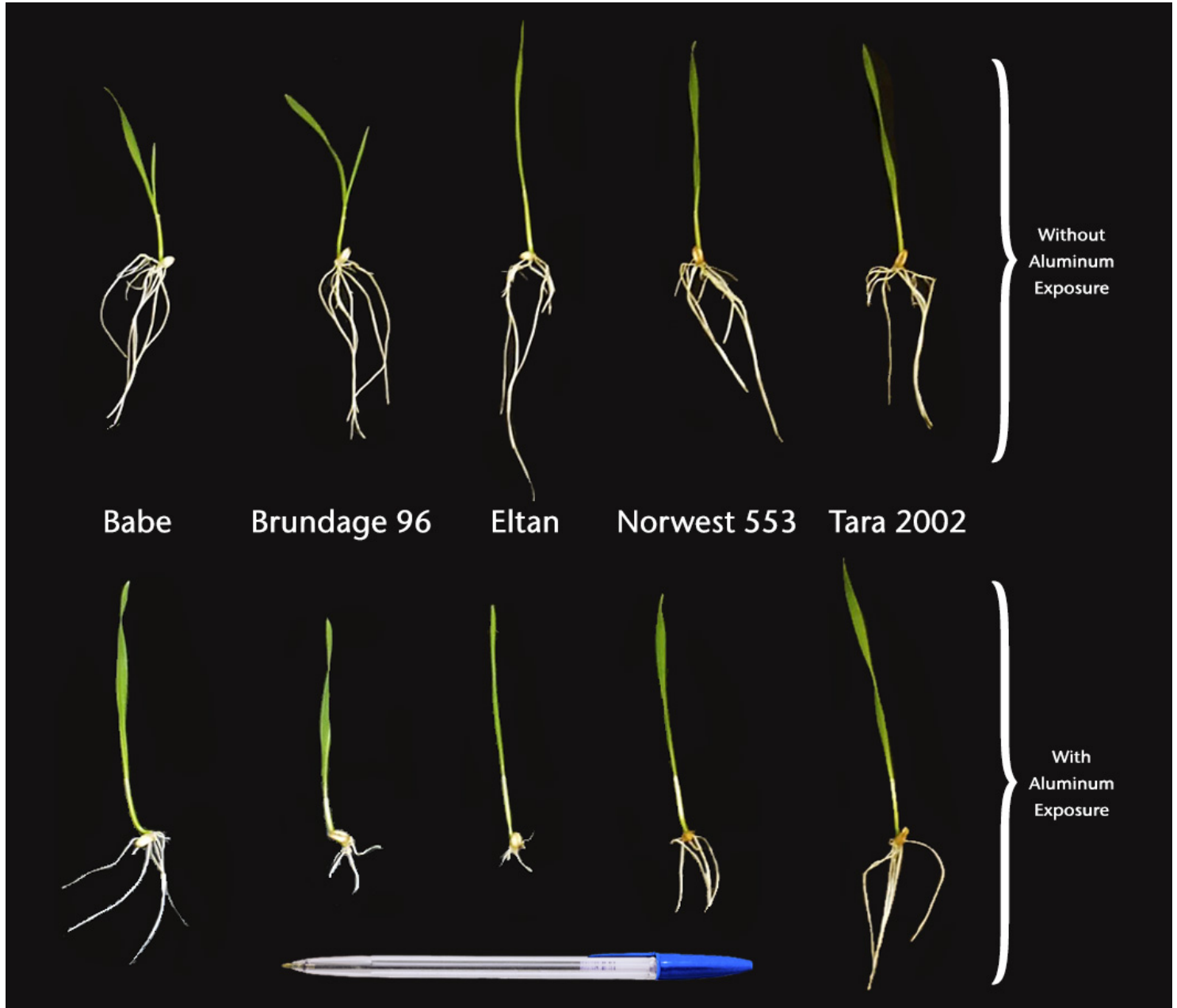
Figure 2. Seedling root growth of some tolerant and sensitive wheat varieties, with and without aluminum (Al) exposure, in a hydroponic solution. Note the root stunting of the sensitive variety Eltan, compared to the healthy root growth of the more tolerant variety Babe.

Immediately following seed germination, cell walls in emerging root tips are bound by Al in acidic soil solutions and become prematurely stiff and brittle, resulting in root stunting (Figure 2) (Ma et al., 2004).