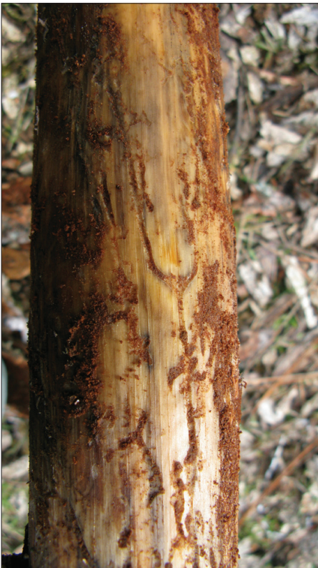
Figure 3. A characteristic CFI inverted Y-shaped gallery found underneath the tree bark.

The adult male is the first to attack a tree by boring into the bark and creating an enlarged “nuptial chamber.” Adult females are then attracted to the chamber by a combination of chemicals emitted by the tree and male beetle pheromones. Typically three females visit the nuptial chamber, where mating takes place. Each mated female will then chew a tunnel that leads away from the nuptial chamber and lay individual small white eggs along the sides of this tunnel. This creates a very characteristic gallery pattern on the sapwood surface, which is easily recognized when the bark is removed. CFI galleries can be recognized by the typical Y shape that is formed by the egg chambers that originate from the central nuptial chamber (Figure 3). As many as fifty percent of the adult beetles will reemerge to