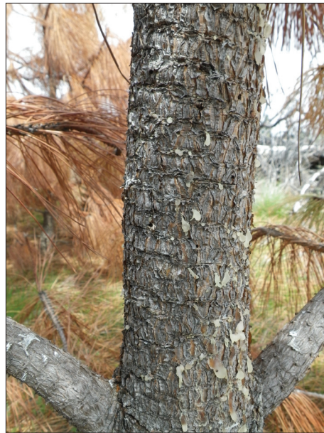
Figure 6. Holes formed in the outer tree bark by emerging beetles.

Healthy trees are able to ‘pitch’ adult beetles out. In response to a beetle attack, trees exude sap to physically flush the invading insect out from underneath the bark. However, when trees are weakened or beetles too numerous, this natural resistance does not function effectively. Adult beetles chew into the bark, mate, and lay eggs. Hatched larvae then feed on the living tissues of the inner bark (the phloem). Adult beetles can also introduce a fungus that kills tissue around the attack area. The fungus aids in weakening the tree and its ability to produce resin flows. The fungus is often recognized after tree death by the blue staining of the wood. When beetle populations are high enough, the beetle and fungus activity can girdle a tree.