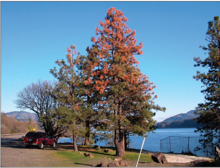
Figure 4. Symptoms observed on a mature ponderosa pine killed by a CFI infestation, at Underwood WA in the Columbia River Gorge. Recent fires and strong wind storms exposed susceptible trees to bark beetle infestation.