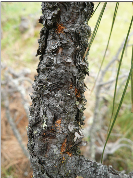
Figure 5. Red frass accumulations from adult beetles maintaining inside galleries, a telltale sign of CFI infestation.

to infest the thinner bark at the top of the tree, while other bark beetles, such as the western pine beetle or red turpentine beetle prefer to infest the trunk.