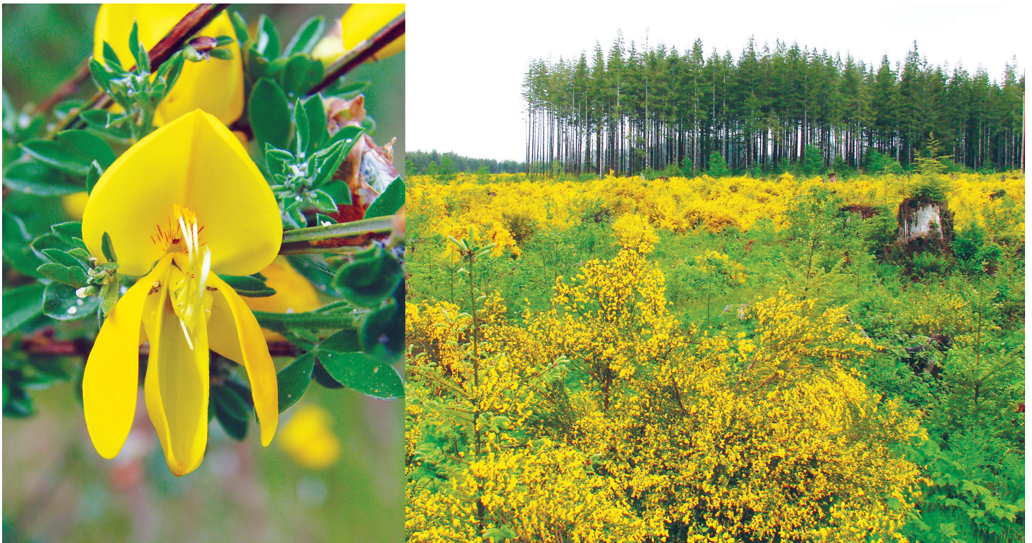
Figure 1. Close-up of a scotch broom flower (left). Scotch broom infestation invading forestland after a timber harvest (right).

Information about integrated weed management strategies for Scotch broom control are available from the WSU Integrated Weed Control Project, Washington State Noxious Weed Control Board, or your county noxious weed control program.