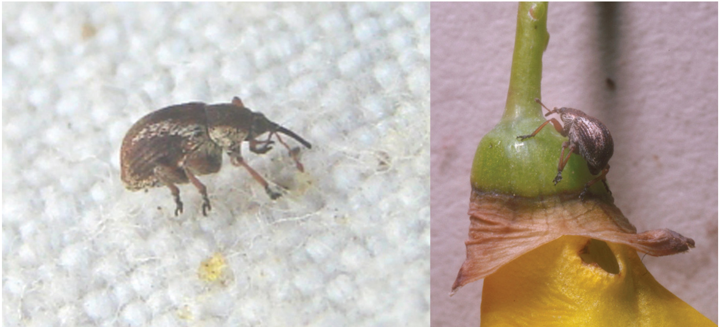
Figure 5. Adult seed weevil, Exapion fuscirostre .