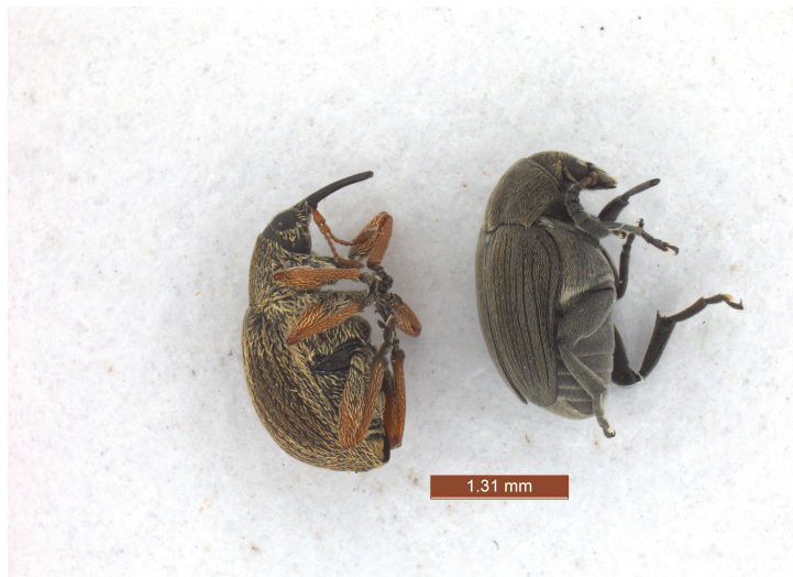
Figure 7. The seed weevil, Exapion fuscirostre , (left) can be distinguished from the seed beetle, Bruchidius villosus , (right) by the presence of a long snout, and its color and body shape.

At some sites, up to 98% of Scotch broom seeds are attacked by these biocontrol agents. However, attack rates vary greatly and may depend on site conditions (Andreas et al. Unpublished data).