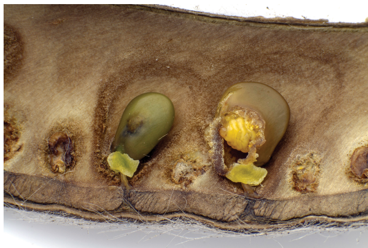
Figure 8. Bruchidius villosus larva are not readily visible as they feed within the developing seed, creating a mottled appearance in the seed (on left). Comparatively, Exapion fuscirostre and its feeding damage are readily visible (on right).