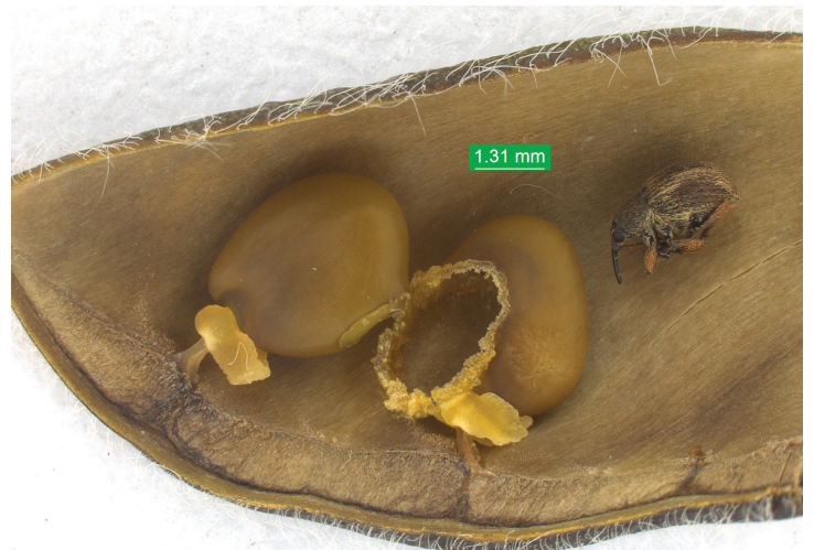
Figure 6. External seed-feeding damage created by a seed weevil larva, Exapion fuscirostre .

One larva per seed usually prevents germination.