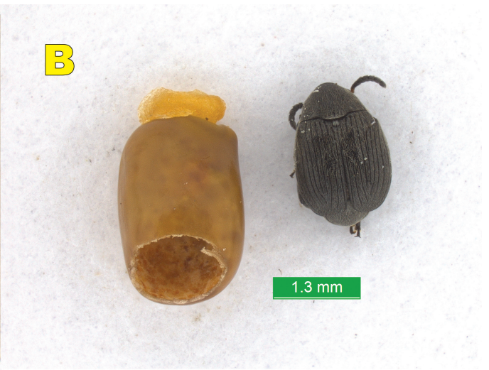
Figure 4 (A) The seed beetle, Bruchidius villosus , feeding within a Scotch broom seed, creates a mottled appearance (left), compared to a healthy seed (right). (B) Once pupated, adults emerge from a hole chewed through the seed wall.