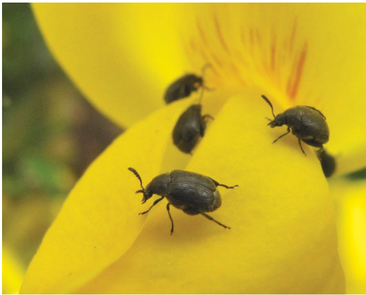
Figure 2. Adult seed beetle, Bruchidius villosus .