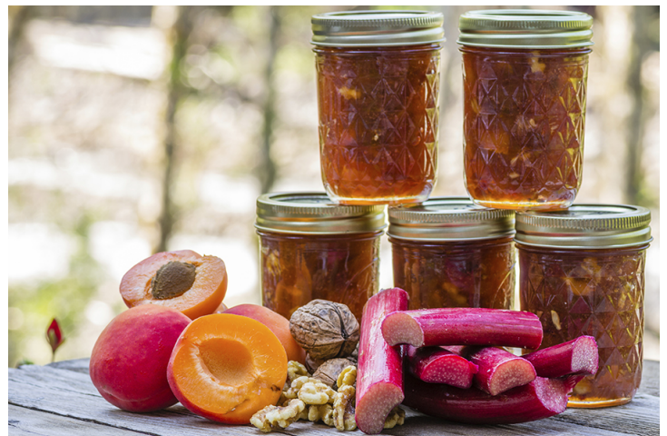
Home-canned apricot, rhubarb, and walnut conserves.

Marmalades are soft jellies with small pieces of fruit or peel evenly suspended in the clear jelly. Marmalades are usually made from citrus fruits and/or peels. Marmalades are made with sugar and can be made with or without added pectin.