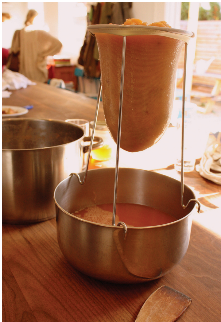
Jelly bag and jelly stand.