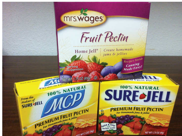
Commercial pectin in powdered form.

Sugar aids gel formation, acts as a preserving agent, and contributes to flavor. The correct proportion of sugar must be present with the acid and pectin to form the gel. Since sugar is the preservative for fruit spreads, it prevents the growth of microorganisms. Cane and beet sugars are most commonly