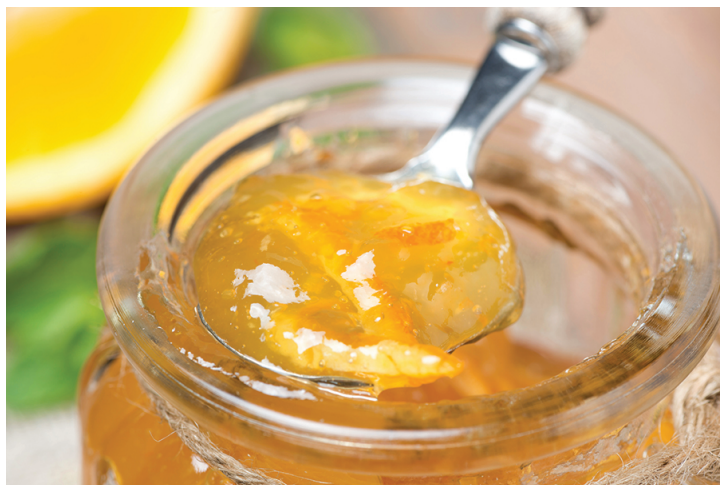
Marmalade often contains citrus peel.

Pectin is a natural substance found in fruit. It forms a gel when present in adequate amounts with the correct proportions of acid and sugar. All fruits contain some pectin. Under-ripe fruits contain more pectin than fully ripe fruits. When fruits with low pectin are preserved, they should be combined with fruits high in pectin or with commercial pectin.