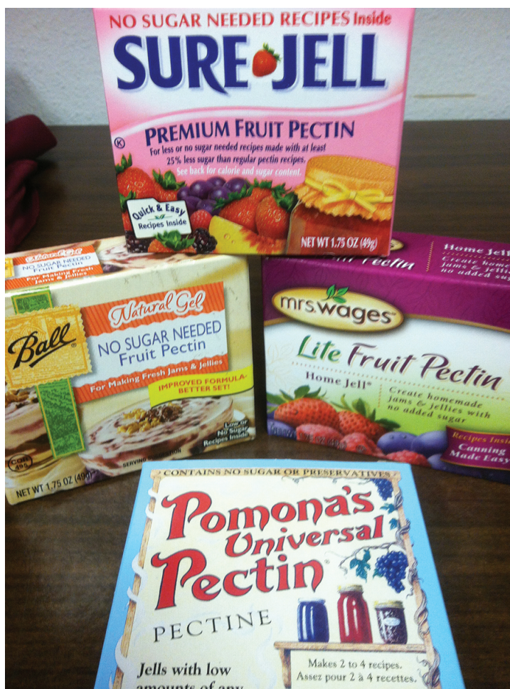
Look for “no sugar needed” on the packaging of modified pectin.