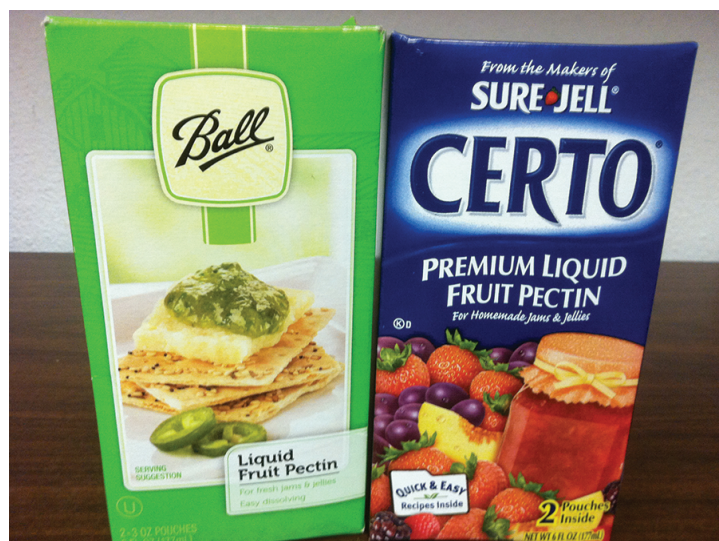
Commercial pectin in liquid form.

used. Do not reduce the amount of sugar in a recipe unless you are using a low sugar pectin product.