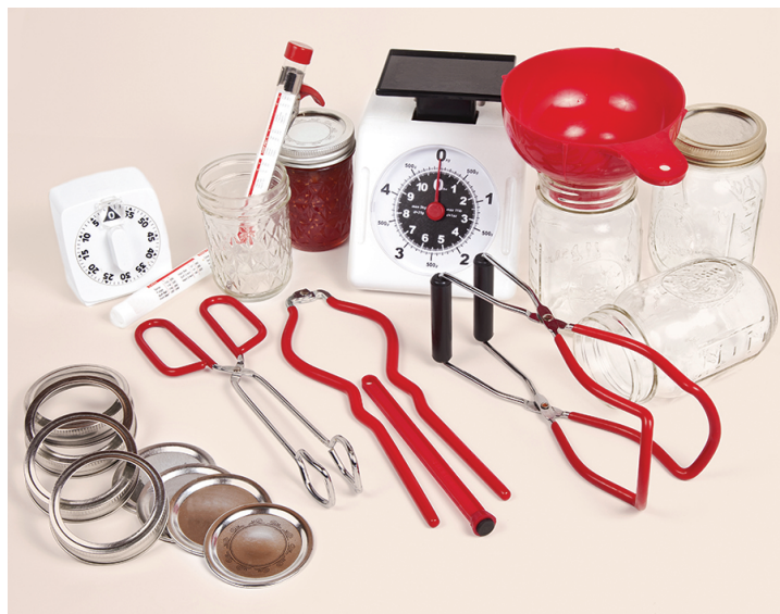
Some of the equipment needed for canning jams, jellies, and fruit spreads.