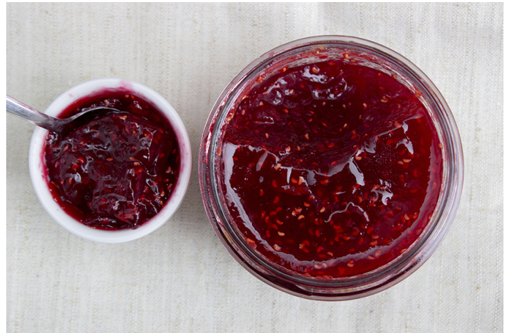
Home-canned raspberry jam.

Preserves are characterized by the thick or slightly jelled syrup, in which small, whole fruits or small, evenly-sized pieces of fruit are suspended. Preserves are made with sugar and can be made with or without added pectin.