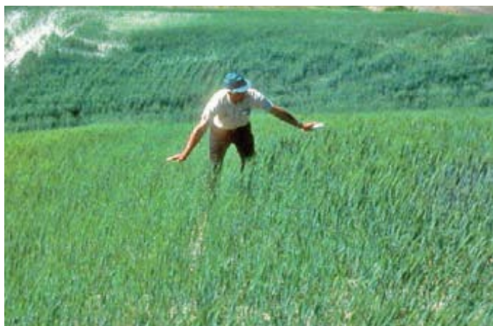
Figure 2. Semi-dwarf (left) and tall wheat (right) cultivar stands in the field.

Delaying winter wheat seeding in the fall by only a few weeks allows more time to control jointed goatgrass with non-selective herbicides or tillage before planting. This can provide effective jointed goatgrass control and allow for wheat stands to escape competition during early development. Additionally, early planted wheat generally results in a more vigorous seedling population that is more competitive with weeds (like jointed goatgrass) later in the season. In some regions, the impact on jointed goatgrass control of altering planting date hinges on weather. If an