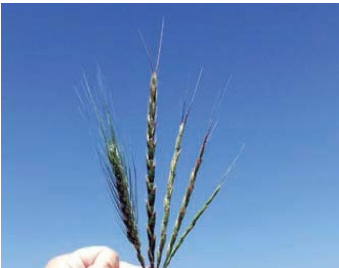
Figure 1. Left to right: wheat, wheat x jointed goatgrass hybrids (3 hybrid spikelets shown), and pure jointed goatgrass.

Herbicide-resistant wheat and jointed goatgrass are genetically related and some cross pollination may occur (1 to 2%). If the resulting hybrid is then allowed to backcross to jointed goatgrass, a herbicide-resistant biotype can occur. Naturally-resistant biotypes may also be selected for in jointed goatgrass populations. Repeated application of herbicides with the same mode of action creates a selection pressure that favors biotypes resistant to that mode of action. This includes different herbicides with the same mode of action used to control weeds in other crops in the same field. Research has shown that rotating the use of herbicides with differing modes of action is an effective strategy in slowing the development of resistant weed populations.