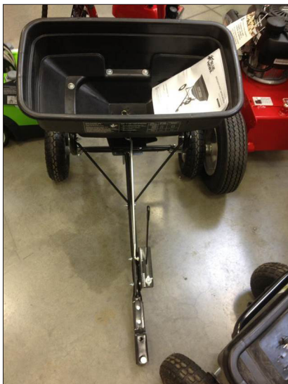
Figure 3. Drop-type fertilizer spreader for applying granular fertilizer in a garden.

Most of these spreaders come with an instruction manual that contains useful information about capacity, use restrictions, and other essential information. The following are simple steps you can follow to calibrate your fertilizer spreader.