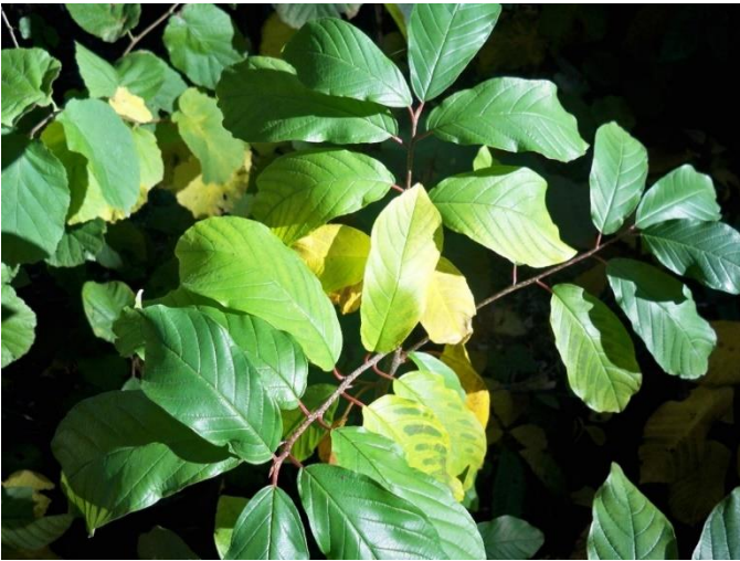
Figure 2. Magnesium deficiency occurs first in oldest leaves.

There was no consistent success with this approach. The scientific literature is full of studies that contradict each other. Researchers warned of damage to plants from the overuse of magnesium sulfate (Boynton 1943; Boynton et al. 1943; Nagai et al. 1966). Unfortunately, because foliar sprays have a quick and obvious effect on leaf color, frequent applications of foliar magnesium sulfate became the popular way for tree fruit growers and others in production agriculture to temporarily alleviate the problem. This approach does nothing to alleviate the nutrient imbalances in the soil.