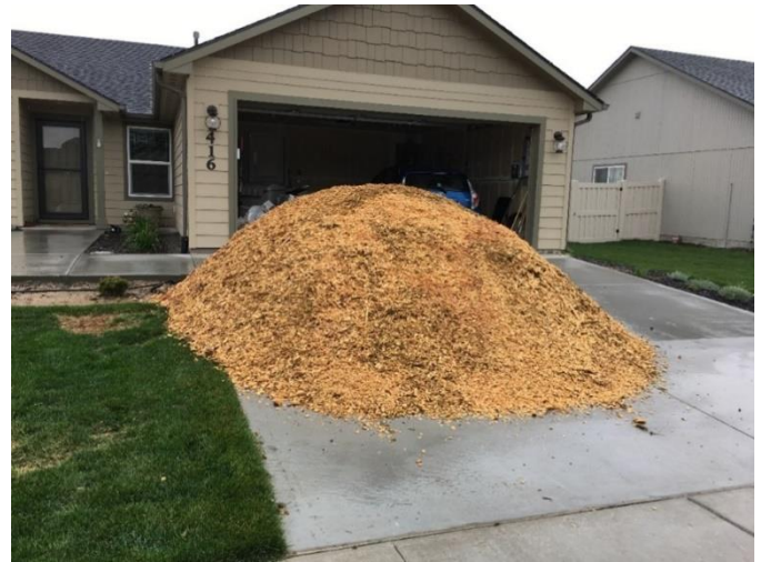
Figure 5. Arborist wood chips are an ideal mulch for soil improvement.

Adapted from Chalker-Scott, L. 2007. Epsom Salts. MasterGardener Magazine 1(2):17–19.