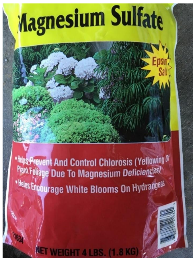
Figure 1. Magnesium sulfate, sometimes sold as Epsom salt.

Magnesium sulfate, or Epsom salt, is a naturally occurring mineral consisting of magnesium and sulfur ( \text{MgSO}_4 , Figure 1). It readily dissolves in water, releasing positively charged magnesium ions ( \text{Mg}^{+2} cations) and negatively charged sulfate ions ( \text{SO}_4^{-2} anions).