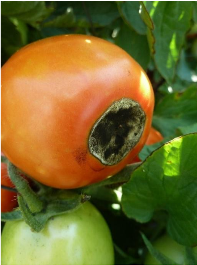
Figure 3. Blossom end rot on tomato is not related to magnesium deficiency.