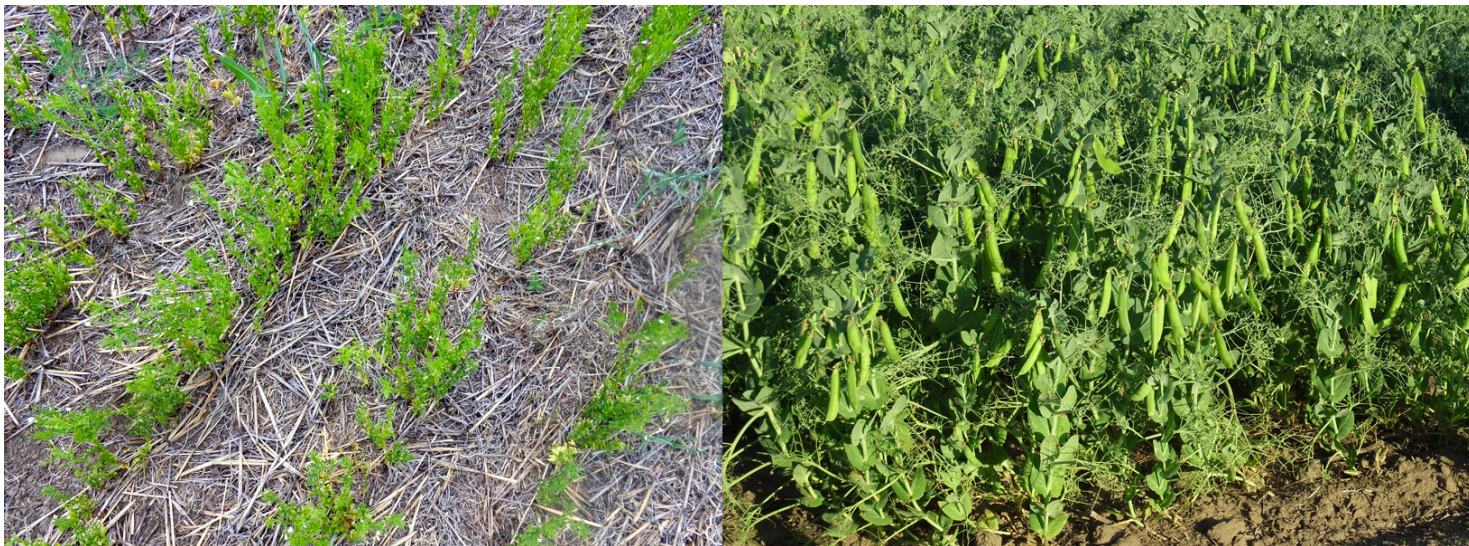
Figure 6. The Camps have experimented with both winter and spring peas. Spring peas are shown in mid-June in 2014 (left) and fully developed in July 2013 (right).