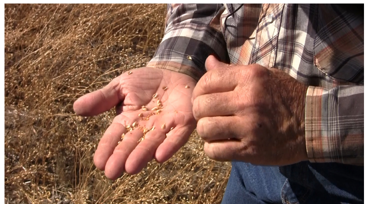
Figure 5. Camp shows tiny brown camelina seeds in his hand, and light yellow hulls.