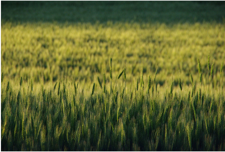
Figure 12. Improved soil quality benefits all their crops, including wheat.

These improvements in soil quality, in combination with crop residues that reduce evaporation, have led to soils that hold more water. And with only 12 to 14 inches of rain per year, every drop counts. Steve explains, “If we can save even a small amount of usable moisture down in this area, you’re talking about some money. Moisture has real value to us.”