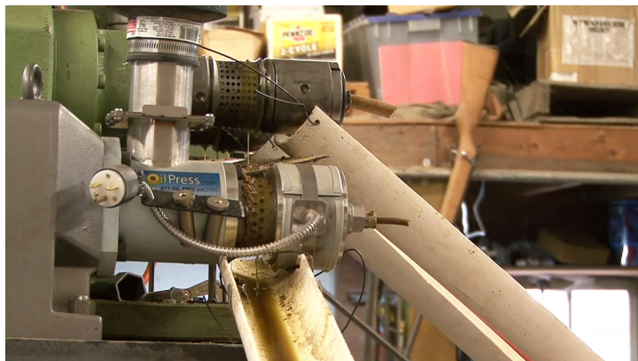
Figure 14. The Camps use a cold pressing process to produce biodiesel from oilseeds.

By growing multiple oilseeds and consuming a portion of their own crops in the form of biodiesel, the Camps are also, in essence, diversifying their markets (Figure 14). For example, in 2013, canola prices fell by about 50%. However, over the same time period, camelina prices were relatively stable and the price of diesel (which their biodiesel substitutes for) fell only slightly.