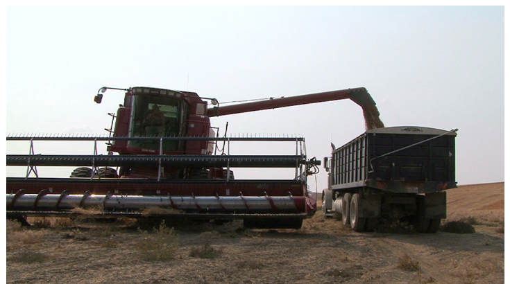
Figure 13. Camelina is among the diversified crops that the Camps produce.

Markets are a major source of risk for most farmers, including the Camps. However, they feel that their market risk is lower than it is for many other dryland farmers because they are producing a diversified group of crops and products, including peas, barley, wheat, oilseeds, and oilseed meal (Figure 13). Their grains are sold through commodity markets, though they continue to explore alternative markets.