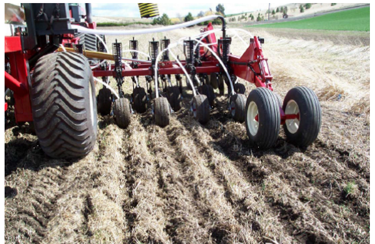
Figure 2. By planting into the residue of the previous crop, Steve Camp aims to reduce soil erosion, conserve water, and enhance soil microbial activity.

Diverse crops and flexible rotations are cornerstones of the Camps' strategy. The Camps are currently growing spring canola, spring camelina, and winter barley, along with the more traditional crops of winter and spring wheat and spring barley. Steve has added new crops slowly, experimenting on a small scale before planting larger areas. This has helped them