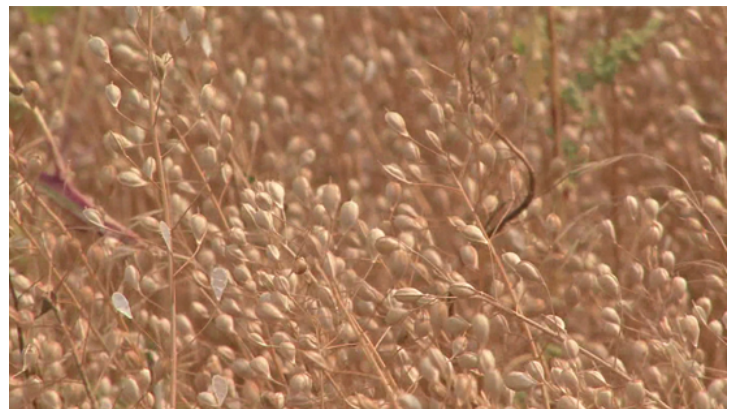
Figure 4. Camelina at seedling stage (top) and at maturity (bottom) is a key oilseed crop that adds diversity to Camp's farm.