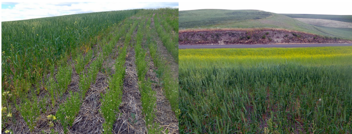
Figure 9. The Camps feel that benefits come from having diversity in their cropping system. Examples of this include spring wheat and spring peas grown in adjacent fields (left) and spring canola below spring wheat (right).

Having a more diverse set of crops and rotations to choose from provides Steve and Becky with additional tools to break up cycles of weeds, insect pests, and diseases. Steve finds that grains following oilseeds