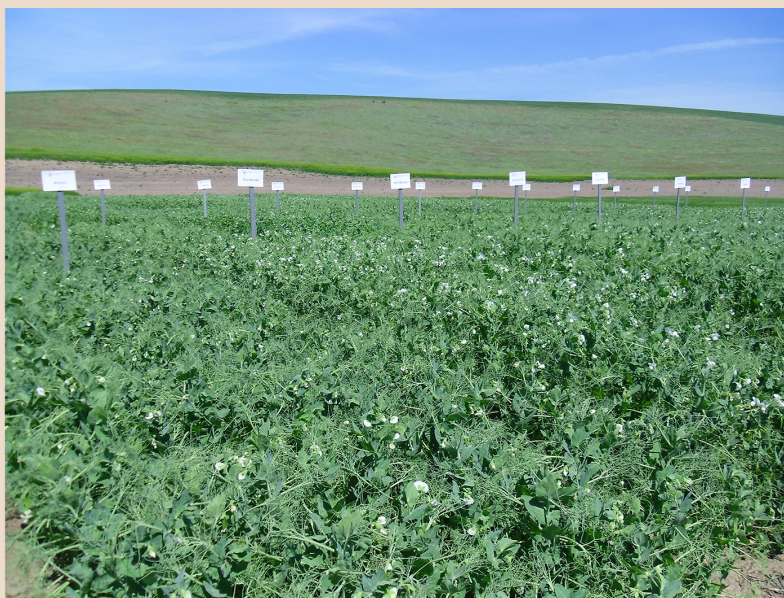
Figure 7. The 2013 spring pea variety trial at the Camp farm in early June.

Full results can be found on the WSU Extension Variety Testing Program website .