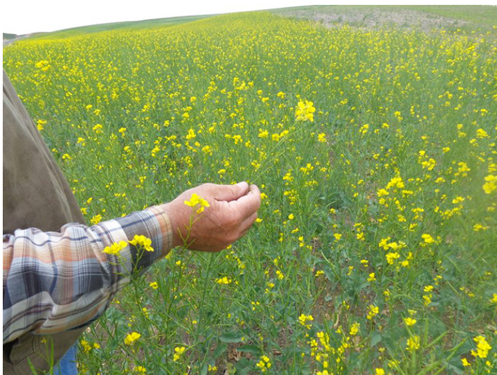
Figure 3. Camp shows canola in bloom in his fields.