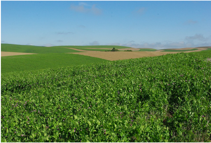
Figure 1. Austrian winter peas near the Camp farm contrast with a checkerboard of winter or spring wheat and fallow in the background— a more common pattern for the Camps' area.