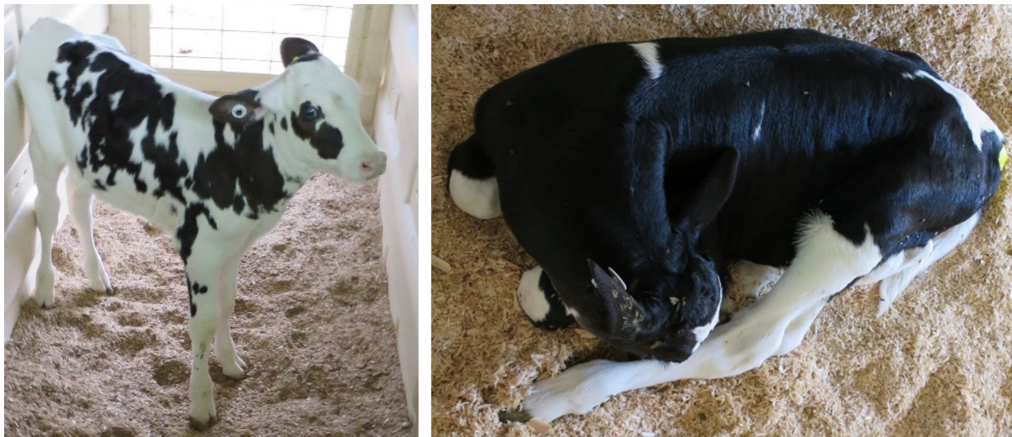
Figure 2. Picture of two calves diagnosed with diarrhea. Each calf exhibits illness differently.

calves and is categorized as either alert (normal) or depressed (abnormal). A depressed calf lacks interest in its environment (including humans), is slow to stand and eat (or refuses to eat), has a decreased milk drinking speed, walks with a lowered head, and may have lowered (droopy) ears. Each calf responds differently to illness, so keep in mind that a sick calf may not exhibit all the behaviors associated with sickness.