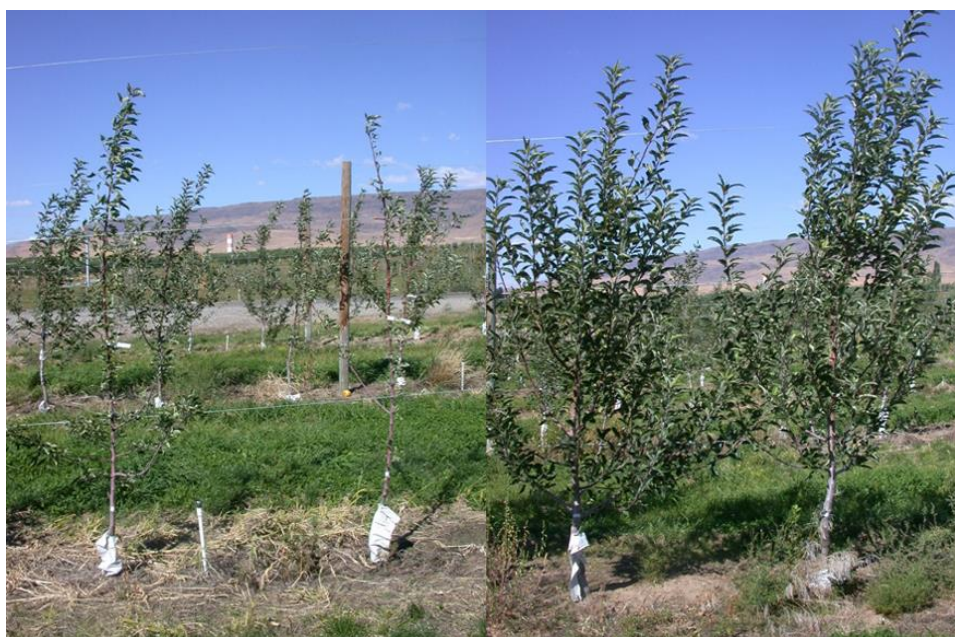
Figure 1. Trees on the left are in a site with replant disease compared to healthy trees on the right.

In the spring when newly planted or recently dormant roots become active, the pathogen propagules germinate, and nematode eggs hatch in response to exudates from the roots. Fungi and oomycete mycelia grow from the propagules and infect the fine roots.