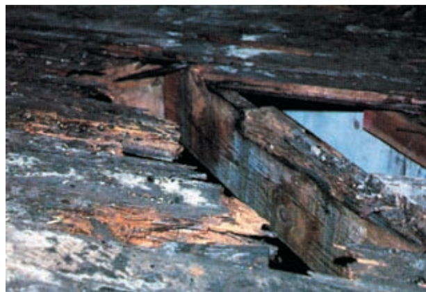
Fig. 1. Beetle damaged floor.

Cultural control —Anobiid beetles thrive best in wood when moisture content ranges between 14%