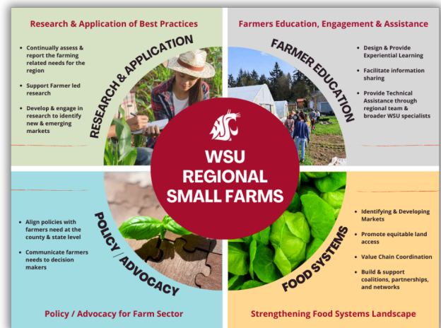
Regional Small Farms Program Pillars

“ I'm new to all this and found this information was very helpful and digestible for someone in my position. ~ Farm Grants From Start to Finish Class Attendee