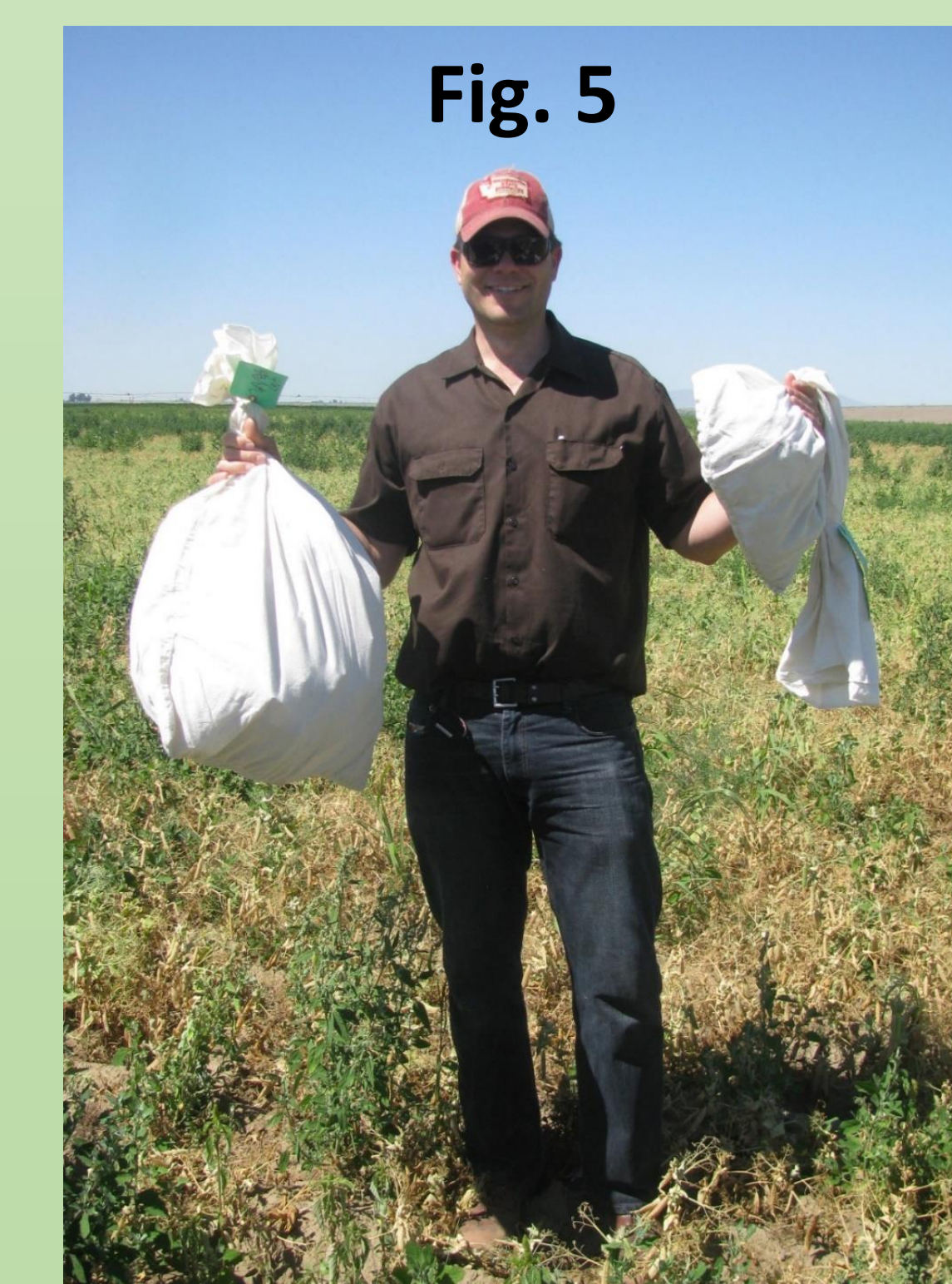
Fig. 1. Pea plants showing the effects of Rhizoctonia (right) compared to healthy plants (left). Fig. 2. Early stage of growth of a pea crop (May 2013) showing patches caused by Rhizoctonia spp. in a field near Basin City, WA. Fig. 3. Advanced infection showing severe stunting in a distinct patch (June 2013). Fig. 4. Aerial image of the pea field with stunted patches. The light red area is the pea crop. The small, pale spots are patches of stunted plants. Fig. 5. Pea plants harvested from outside (left bag) vs. inside (right bag) a patch of stunted plants on 4 July 2013. Table 1. Pea yields from inside vs. outside stunted patches of pea plants caused by Rhizoctonia .