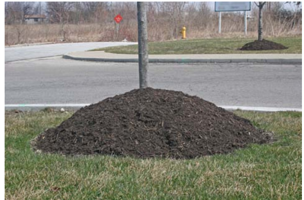
Figure 18. “Mulch mounds” or “volcano mulching.”

Plant stress may also produce a progression of symptoms. However, there are two types of plant stress: acute and chronic. Acute stress is caused by an immediate event, such as flooding, drought or defoliation by an insect pest. Symptoms are usually immediately evident and easy to diagnose since the cause is close at hand.