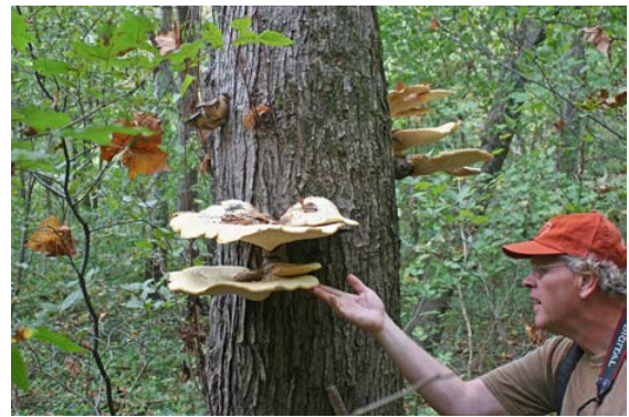
Figure 6. These bracket-like fruiting structure of the wood-decay fungus Polyporus squamosus is a disease “sign.”

Knowing your plants, and even what family and genus they are in, is a great starting point for diagnostics. This, of course, helps not just with identifying infectious diseases like fire blight and rust, but with other problems as well. Consider a yew or rhododendron growing in poorly drained soil. Knowing these plants are particularly prone to root decline and root rot in poorly drained sites helps immensely with a proper