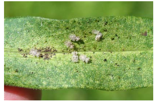
Figure 7. The “symptom complex” for lace bugs is illustrated by these chrysanthemum lace bugs.

Finally, when considering symptoms, keep in mind that there are often a series of symptoms, known as the “symptom complex,” which together helps fingerprint a particular problem. When questioning if lace bugs are a problem, check not only for flecking and yellowing of leaf tissue, but also for tarlike excrement deposits. When checking for Verticillium wilt on maple, check not only for leaf scorching and stem dieback but also for discolored streaking of the vascular tissue.