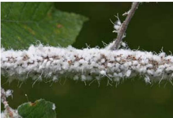
Figure 25. Beech blight aphids.

However, here you need to be a good communicator, to understand your clients and listen to their concerns. Just because a problem will not affect plant health, or in your opinion, affect aesthetics significantly, does not mean your client agrees. In some sense, plant problems are in the eye of the beholder. While powdery mildew of lilac may be irrelevant to plant health in one landscape, it may matter a great deal to a client who will simply take his or her business elsewhere if you do not do something about the problem. And it certainly matters to a garden center displaying lilacs in its sales area.