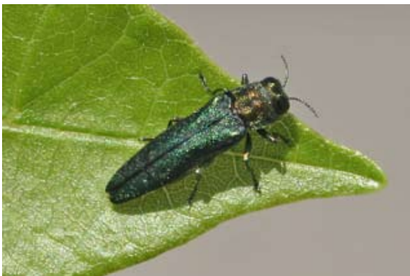
Figure 23. An emerald ash borer adult beetle.

By now, having asked all kinds of questions and in some cases consulting others or sending in samples for analysis, a good diagnostician asks for the last time, “What else might I be missing?” Question #6 provided the first “reality check” in the diagnostic process; this is the second. You should stop and reconsider everything you have learned thus far. Does it all add up to support a good diagnosis?