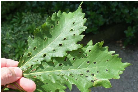
Figure 17. Damage from the oak shothole leafmining fly.

Plant symptoms sometimes progress through a series of different “looks.” It is helpful to consider symptom progression in the context of having a beginning, middle and end. The oak shothole leafmining fly ( Agromyza viridula ) uses its sharp ovipositor to puncture young expanding oak leaves to cause liquids they feed upon to flow. They often produce holes in a row, and if new leaves are punctured prior to unfolding, the holes will appear as mirror images on different parts of the leaf. In the beginning, the holes are extremely small; however, they become larger as the leaves expand. In the end, they may measure over ½ inch in diameter. Of course, by this time, the fly is long gone.