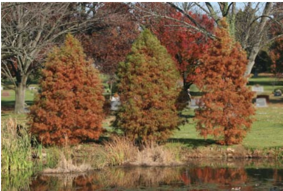
Figure 2. Baldcypress with fall color; it is a deciduous conifer.

Plant characteristics are variable enough that what is perfectly healthy for one plant may be a sign of a serious problem for another. A good example can be found in deciduous conifers such as baldcypress, dawn redwood and larch. These three trees bear cones and needles, and neophyte plant lovers may think they are evergreens.