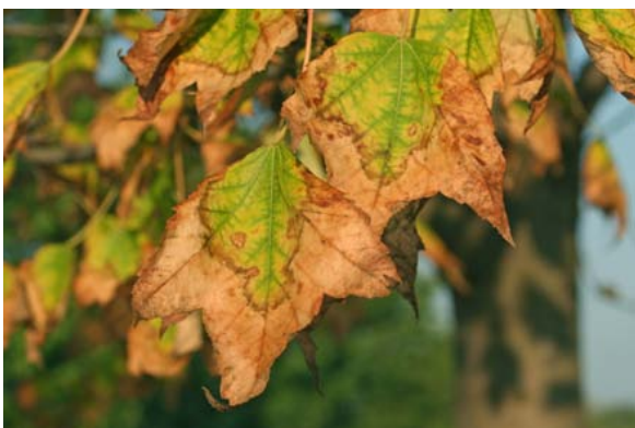
Figure 10. Physiological leaf scorch on maple is characterized by leaf-browning that starts along the edges of leaves, and moves inward.

It is very important to note the pattern of damage. Is the damage on older leaves, newer leaves or both? Is the damage only on the lower part of the plant, upper part of the plant or throughout the plant? Do symptoms appear to be located on a particular part of the leaf? A good example of this is the difference in symptoms between maple anthracnose and physiological leaf scorch of maple.