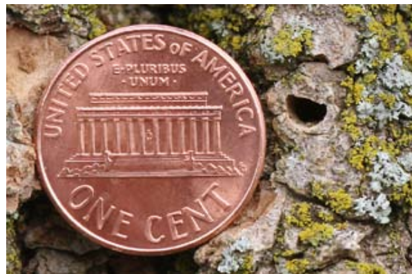
Figure 24. Emerald ash borer “D”-shaped adult emergence holes.

Emerald ash borer provides a good example of the value of stopping to reconsider everything before making a diagnosis. Prior to the discovery in 2002 that this non-native beetle was living in the United States, people were certainly aware that ash trees were dying. However, correctly diagnosing a plant problem that is not known to occur is without doubt the most difficult diagnosis to make. We tend to focus on the “known.”