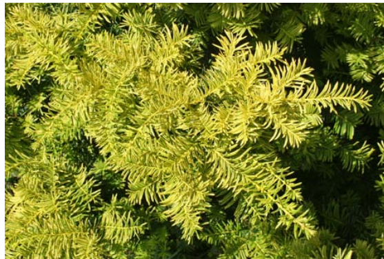
Figure 3. Taxus 'Helen Corbit' foliage is variegated with needles trimmed in yellow.

However, they are indeed deciduous, with fall colors ranging from spun gold to reddish brown, followed by leaf drop. Many a baldcypress has felt the bite of the saw from new homeowners who notice a completely brown-leaved tree in their new landscape in late fall. Indeed this total browning of foliage would be a sign of almost certain death on a true evergreen conifer, such as pine. Knowing how to identify these deciduous conifers and understanding that their fall color and leaf drop is normal can be all you need for proper diagnosis.