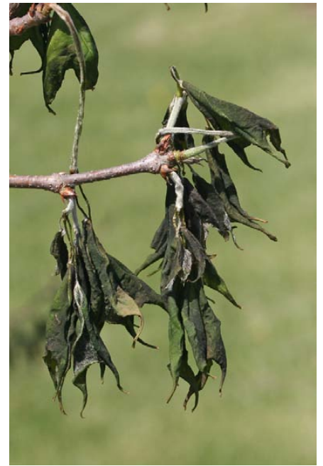
Figure 19. Late-spring freeze damage to trident maple.

A careful interview of the client regarding their thoughts on the problem can provide critical pieces of information that contribute to an accurate diagnosis. Remember that you are interviewing the client, not interrogating! Avoid asking "leading" and accusatory questions, such as, "Did you over-fertilize the plant?" or "Did you give the plant too much water?" These questions are not likely to yield useful information; they are more likely to yield an angry client.