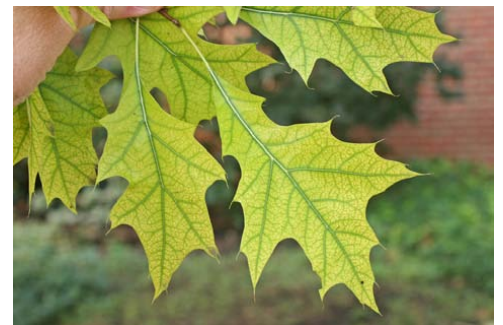
Figure 15. Iron chlorosis on pin oak may signal a high soil pH.

Sun and shade exposure is also critical to the success of many plants. Japanese maples tend to thrive in protected sites, developing physiological leaf scorch in hot, sunny areas. Flowering dogwoods generally do poorly in open, hot sites (and often develop borer problems if stressed) and also in densely shaded sites where diseases, such as dogwood anthracnose, are favored. Partial shade is best for flowering dogwood.