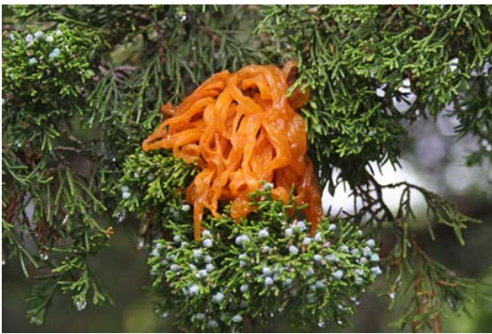
Figure 5. Cedar-apple rust fungal spore horns sprouting from a plant gall caused by the fungus on juniper.

Fungi are not the only gall-makers. There are a number of insects and mites that direct the growth of plant galls, and most are highly specific to their hosts. Indeed, most are so specific the gall-maker can be identified to species based on the gall structure alone without the need to see the actual gall-maker. There are over 800 gall-making insects that are specific to oaks, and over 700 are tiny wasps belonging to the family Cynipidae. The cynipid wasp Amphibolips prunus stimulates plant cells in pin oak acorn caps to grow an unusual ball or plum-shaped structure that surrounds a single wasp larva. The galls are commonly called oak plum galls, or oak acorn galls, and they are only produced by this wasp on pin oaks.