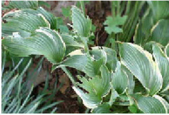
Figure 12. Deer feeding activity on hosta is often signaled by torn leaves that have tattered edges.