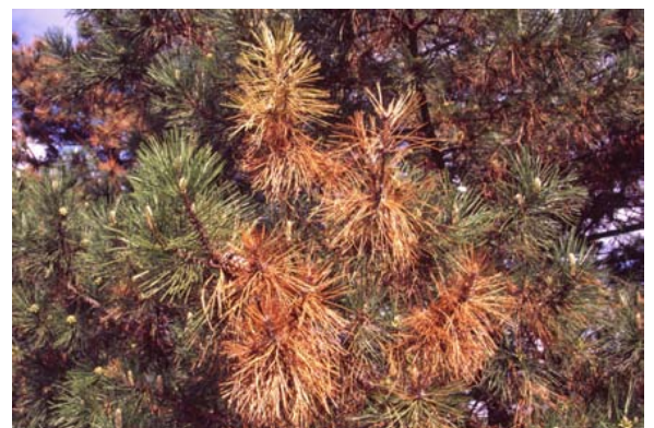
Figure 11. Diplodia ( Sphaeropsis ) tip blight of pine is characterized by browning and stunting of new shoots.