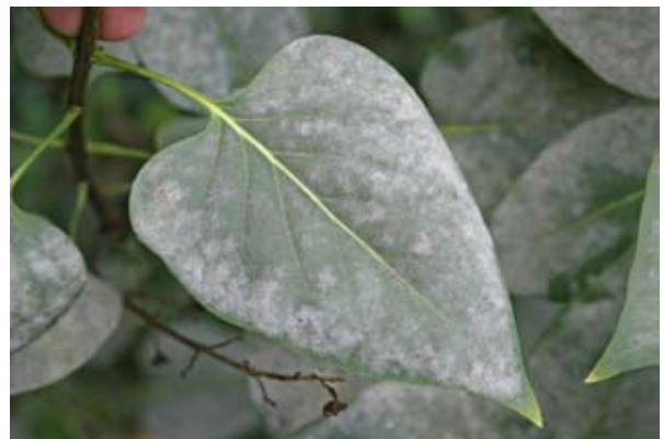
Figure 26. Powdery mildew of lilac.