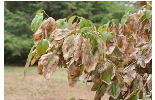
Figure 20. Leaf scorch on dogwood caused by a summer drought.

Good, sharp hand pruners are important for cutting small twigs to look more closely at stem and leaf problems. It is also unprofessional, to say the least, to collect a sample by