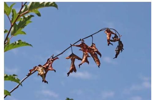
Figure 4. A characteristic “shepherd’s crook” on crabapple caused by bacterial fire blight.

For example, fire blight, caused by the bacterium Erwinia amylovora , causes a blighting of shoots that result in discolored leaves and a curling of the shoot often characterized as a “shepherd’s crook.” This symptom is helpful in considering fire blight as a possibility. However, such symptoms can also be caused on many plants by far simpler problems, such as moisture stress, resulting in leaf and shoot wilting. For which plants should fire blight be considered a possibility? As it turns out, fire blight occurs only on plants in the rose family (Rosaceae). So if you see a crabapple, firethorn or mountainash with a shepherd’s crook symptom, fire blight should be considered and investigated. If the plant is a maple, white ash, or pine—not members of the rose family—fire blight is not a possibility.