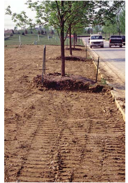
Figure 16. Soil compaction from construction equipment.

Always keep an eye on plant selection when assessing site conditions. It is very difficult to modify the site once a plant is planted. In cases where it's "wrong plant, wrong site," your recommendation may be to replace the plant. Good plant health management means starting with the right plant in the right place.