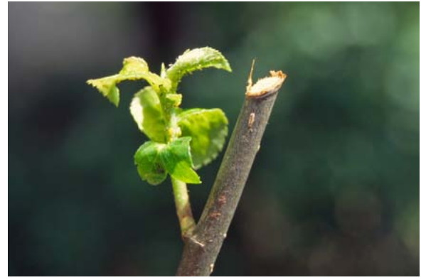
Figure 13. Rabbit feeding damage is characterized by cuts made at 45 degree angles.