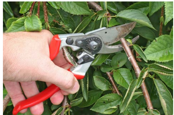
Figure 22. Hand pruners are useful for collecting samples.