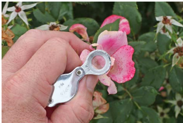
Figure 21. A hand lens provides useful magnification for field diagnostics.

For larger stems, a small foldable pruning saw is also easy to carry. A knife is useful for cutting into a stem to check for discoloration of the vascular system (typical of Dutch elm disease or Verticillium wilt disease) or to check stems for the presence of insect borers. Although less portable, pruning poles can also be useful tools to get samples from high in a tree.