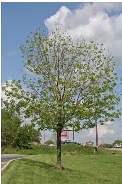
Figure 8. The thinning canopy of this ash tree indicates an overall decline in the health of the tree.

It is a good reminder to put into perspective overall plant health. Presumably you have found something abnormal or you would not be continuing with the diagnosis, but step back for a moment to consider overall health. This helps later in terms of what you will recommend and how important various problems on the plant might be, but it also helps provide focus relative to how long problems might have been present. Consider, relative to a healthy specimen of the same plant, such questions as whether leaf size and color are normal, if the canopy is full or if the growth rate is normal.