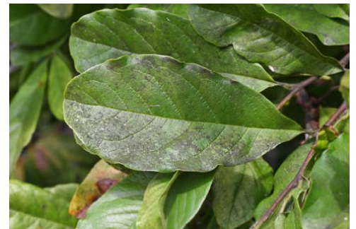
Figure 14. Black sooty mold on the surface of a magnolia leaf.

Often noticing what is occurring on overhanging plants can prevent embarrassing misdiagnoses. Scale insects, which suck sap from plants, excrete this processed sap out the other end in the form of “honeydew.” Often this clear, sugary, sticky liquid becomes covered with a sooty mold fungus that simply grows on the sugary substance, rather than plant tissue itself. Calico scale is a prolific producer of honeydew. Consider what happens to the leaves of plants underlying a tree that is heavily infested with this scale insect. The underlying plants are not infested; however, their leaves become blackened with sooty mold. Of course, an effective treatment must focus on the scale infestation rather than non-infested plants with blackened leaves.