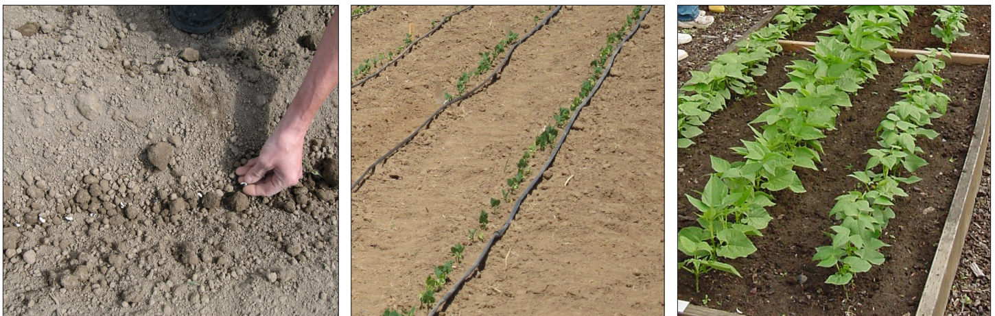
Figure 1. Placing bean seed in a row (left), rows of beans emerging (center), and a raised bed with dry bean plants (right).

Water is especially important during flowering to ensure good pod formation. Too much or too little water can cause blossom and pod drop, which leads to a decrease in yield. Apply water to the base of the plant and avoid