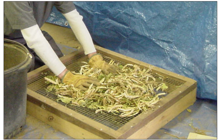
Figure 3. Threshing dry beans: stomping on plants that are in a burlap bag (left); sifting beans from plant debris using a compost screen.