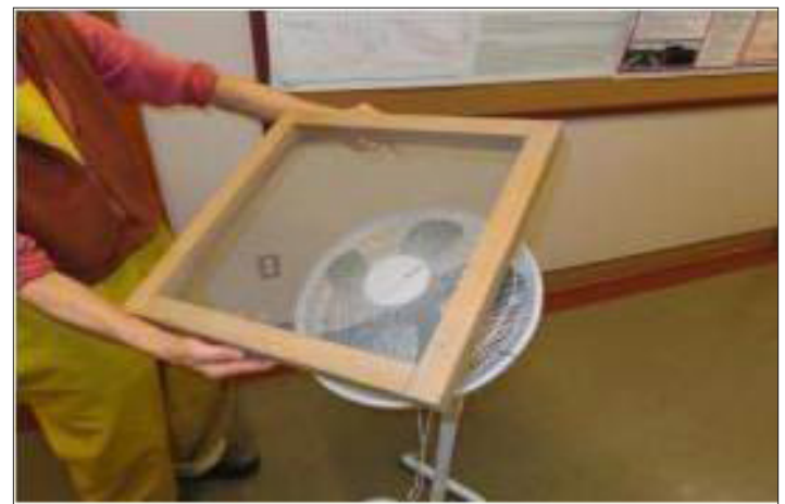
Figure 4. Cleaning dry beans: sifting out the smaller debris (left), and using a fan to blow out the remaining debris (right).