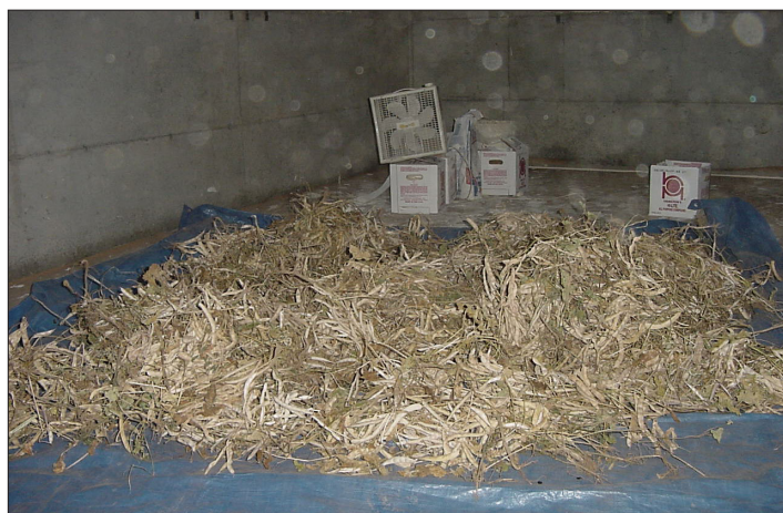
Figure 2. Drying harvested bean plants on a tarp in a sunny driveway (top), and in a garage with a box fan (bottom).