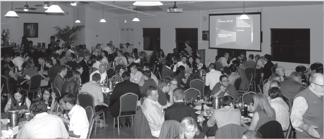
SES Alumni and Friends at the Annual Banquet and Auction on Homecoming Weekend.