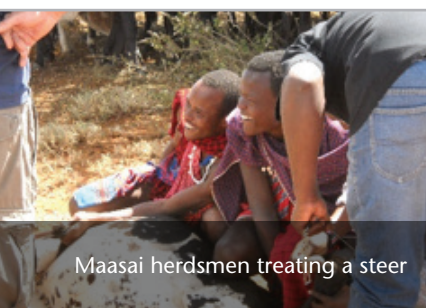
Maasai herdsman treating a steer