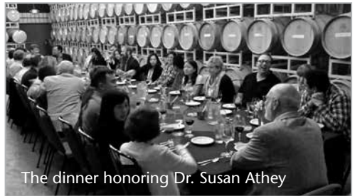
The dinner honoring Dr. Susan Athey

In 2013 the Leigh Memorial Economics Excellence Fund sponsored a university-wide address by Dr. Susan Athey, economics of technology professor at the Stanford Graduate School of Business. Professor Athey is an eminent scholar, especially well known for his work on the economics of the internet,