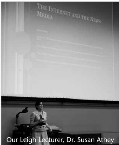
Our Leigh Lecturer, Dr. Susan Athey

In 2013 the Leigh Memorial Economics Excellence Fund sponsored a university-wide address by Dr. Susan Athey, economics of technology professor at the Stanford Graduate School of Business. Professor Athey is an eminent scholar, especially well known for his work on the economics of the internet,