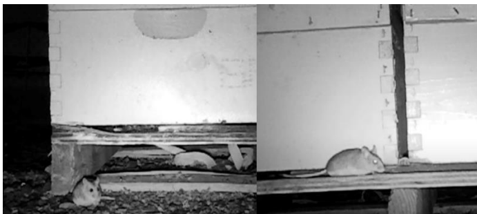
Figure 5. Trail camera photos of mice visiting honey bee colonies where AGH-like damage was observed.