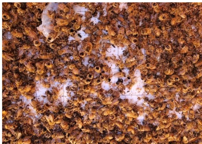
Figure 4. Mouse damage to a honey bee colony was observed by the WSU Bee Lab in Othello, Washington.