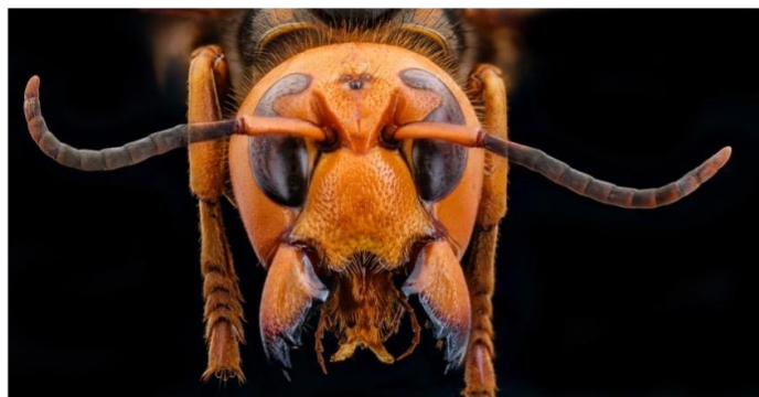
Figure 1. The face of an AGH. AGH is the largest hornet in the world and can be up to two inches long.

While AGH has been given an intimidating public image, in reality very few people need to be concerned about encountering them. They are currently only located in northwestern Washington State and adjacent British Columbia. Although they have a longer stinger and greater amounts of venom than other wasps or hornets, the AGH is no more defensive than other stinging Hymenoptera and will only attack humans or animals if disturbed. AGHs ferociously prey on honey bees (and other eusocial bees and wasps) and can decimate entire colonies in a span of just a few hours, so beekeepers in Washington and British Columbia should be concerned. Resources for beekeepers and others are listed in the Further Reading section of this publication. If you are in Washington State and think you may have seen an AGH, be sure to report it to the Washington State Department of Agriculture at agr.wa.gov/hornets .