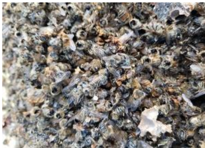
Figure 2. Suspected AGH damage.

A few months later, as WSU research colonies were coming out of an indoor wintering experiment, strikingly similar damage was observed: numerous dead bees on the ground outside hive entrances had holes in their thoraces, with much of the musculature bored out (Figure 4). These colonies had been sealed indoors at 39°F (4°C) for the winter months and were located in Othello, Washington, 300 miles from where AGH was detected, so the damage could not have been from AGH. Personal communication with local commercial beekeepers suggested that similar damage could be caused by shrews. Trail cameras were deployed to catch the culprit in action. Footage from these cameras revealed that mice were visiting the colonies at night and nibbling out the thoracic muscles (Figure 5).