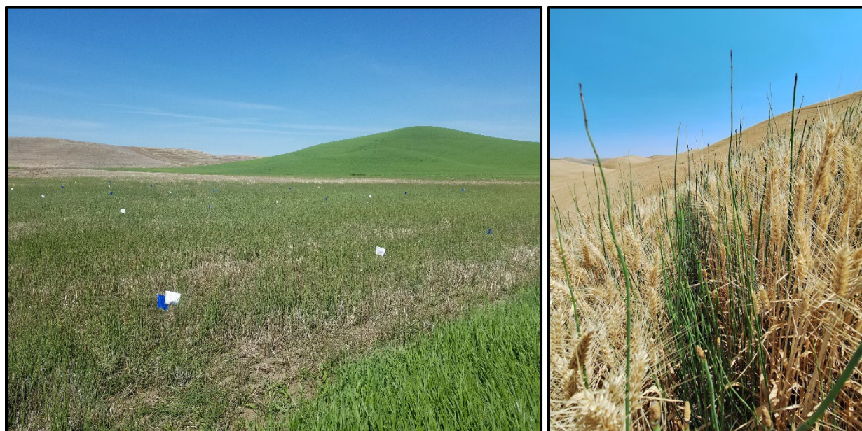
Figure 1. Smooth scouringrush in fallow (left) and in winter wheat (right).

Smooth scouringrush control in wheat/fallow rotations in eastern Washington (Figure 1) has been difficult because of limited effective herbicide options. In other studies, we have shown that applications of chlorsulfuron, one of the active ingredients in Finesse (chlorsulfuron + metsulfuron), can have activity on smooth scouringrush at least two years after application; however, tank mixing RT 3 (glyphosate) with Finesse in fallow-year applications may increase control of smooth scouringrush into the following crop year and beyond. RT 3 has been effective when applied at a high rate and with an organosilicone surfactant. In contrast, Finesse is effective for at least two years after application, but when applied alone, does not control all weeds that may be present in the fallow. This study examines the effect of Finesse and RT 3 applied alone or in combination at different rates of RT 3 up to three years after application in fallow.