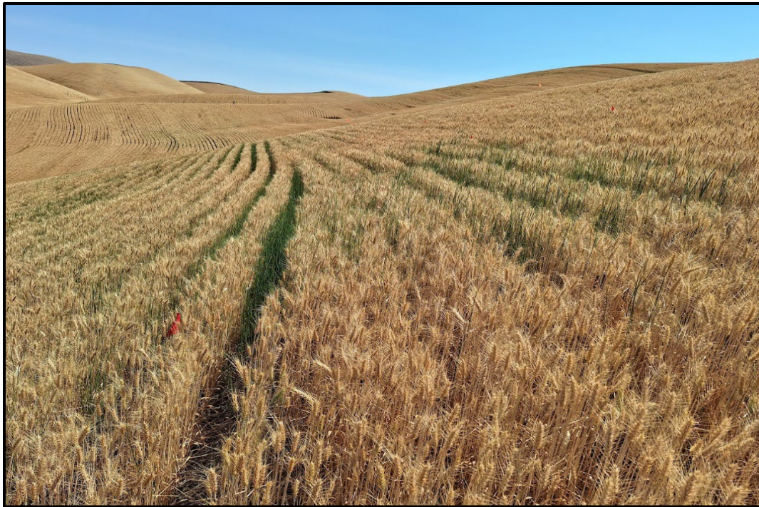
Figure 2. Smooth scouringrush in winter wheat near Dayton. Foreground treated with Finesse in 2020.

In 2023, smooth scouringrush density was assessed at each location by counting stems in two 1.2-yd 2 quadrats per plot. At the Dayton site, all treatments that included Finesse averaged 86% fewer stems than the nontreated check (Figure 2). There was no difference in stem density between the nontreated check and either the 32 or 64 oz/A rate of RT 3 applied alone; however, the 96 oz/A rate had fewer stems than the nontreated check (Figure 3). At Steptoe, the treatments with Finesse averaged 99.6% less density than the nontreated check, and RT 3 alone at 96 oz/A was not different from Finesse alone or Finesse plus RT 3 at 32 oz/A. Furthermore, RT 3 at 32 oz/A was 86% less dense than the nontreated check.