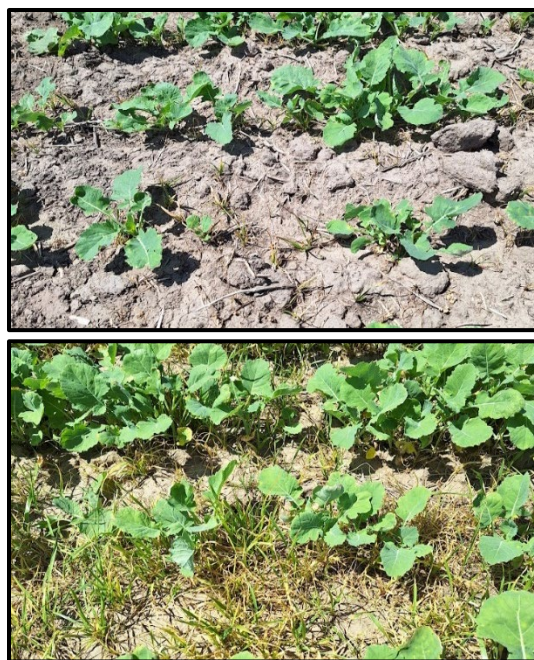
Figure 1. Top photo: Liberty following preplant Treflan on Italian ryegrass in canola. Bottom photo: Liberty on Italian ryegrass with no preplant Treflan.